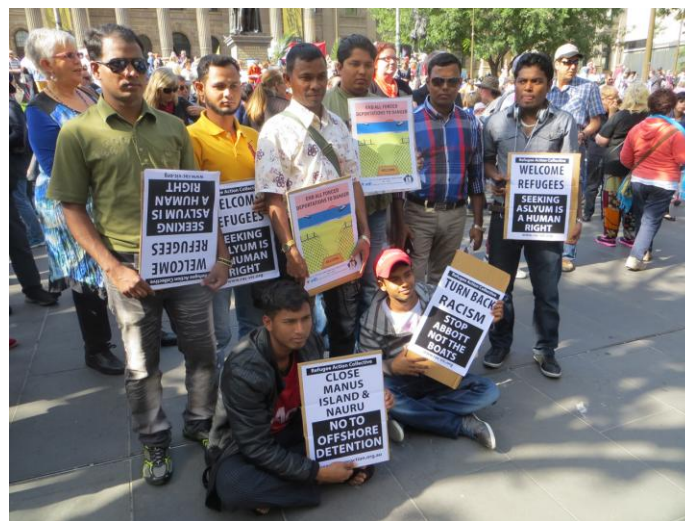
March for Refugees