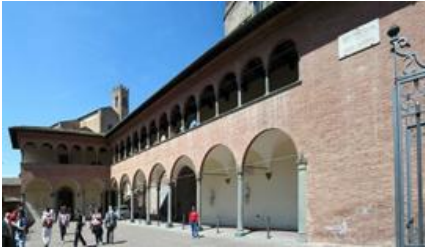
Benincasa Family Home – Siena

St Catherine of Siena was a Dominican mystic of the fourteenth century, who, by her charitable works, her gifts of discernment and prayer and her diplomatic skills, played a leading role in the history of Italy and the Church in a time of great social and religious ferment.