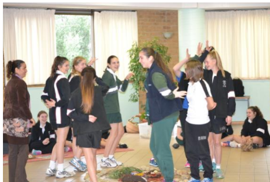
Year 9 Reflection Day

On this joyous feast, let us ask St Catherine to continue to intercede for us and may she lead us to Christ when we reflect on her life and service.