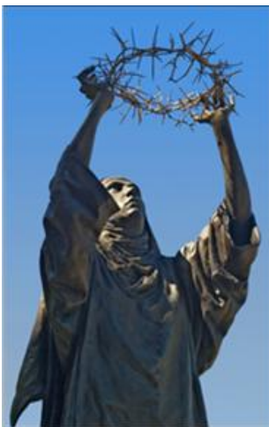
Statue of Catherine at St Patrick's Cathedral

Catherine was born on the 25 March 1347. She was the twenty-third of her parents' twenty-five children. At a young age, Catherine decided that she wanted to give her life completely to God. Her desire to belong to God expressed itself first in her taking a vow of virginity and later in her joining the "mantellate", a group of lay Dominican women, who lived in their homes and dedicated their lives to prayer and charitable activity. Catherine spent the first three years as "mantellata" in a secluded life of prayer at home. After this time, she plunged herself into active service of neighbour, showing sensitive care of the sick and the poor.