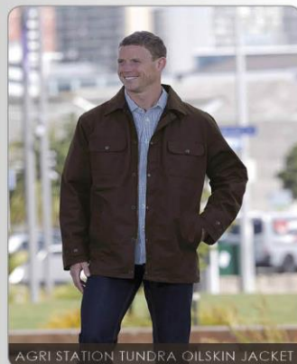
AGRI STATION TUNDRA OILSKIN JACKET