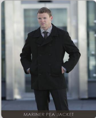
MARINER PEA JACKET