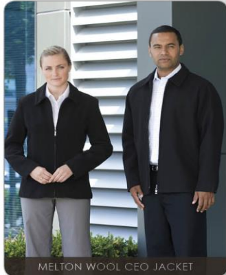
MELTON WOOL CEO JACKET