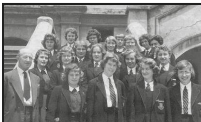
Leaving Commercial Class : 1959

If there are any class members out there who are interested in organising a reunion and require some assistance, please contact the Acting Secretary.