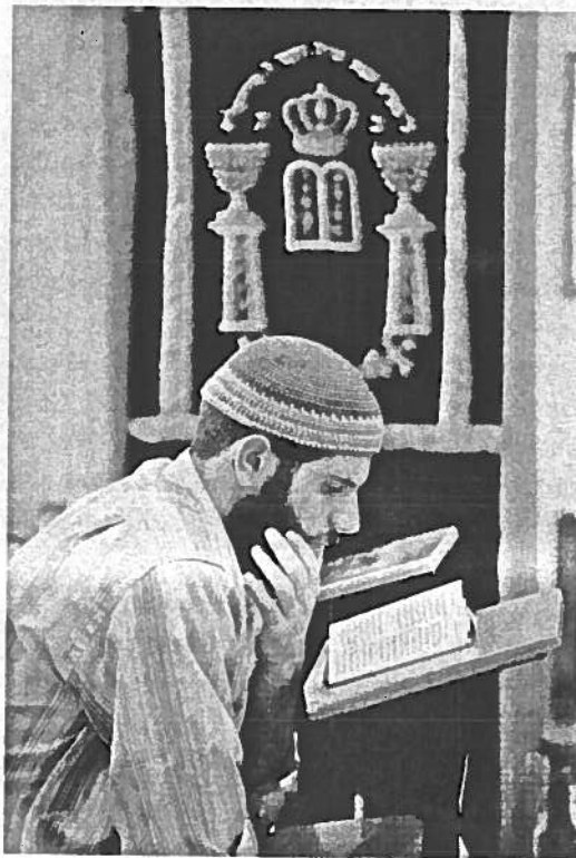
Reading from the Torah in a synagogue in Jerusalem.

The people used to fast on ‘Ashūrā’ (the tenth day of the month of Muḥarram) before the fasting of Ramaḍān was made obligatory. And on that day the Ka’ba used to be covered with a cover. When Allah made the fasting of the month of Ramaḍān compulsory, Allah’s Apostle said, “Whoever wishes to fast (on the day of ‘Ashūrā’) may do so; and whoever wishes to leave it can do so.” 16