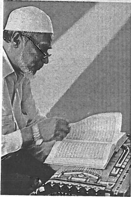
Reading from the Qur'an in Penang, Malaysia. Photograph by Fred de Noyelle, March 2006.

Numerous additional parallels and commonalities are found in dietary laws, 19 ritual purity, 20 ritual slaughter, 21 circumcision, 22 holy day rituals, and so forth. 23 Much could be noted about them. I limit my final comments here to one small aspect of an issue that is striking because of a curious Islamic custom treating purity. Muslims are required by religious law to ensure that they are in a state of ritual purity before engaging in prayer by engaging in some form of ritual washing (Q. 5:6). A parallel is found also in Judaism, especially after waking and beginning the morning prayers, 24 but the ritual washing in Judaism is customary rather than required. Required ritual purity presents a potential problem in the dry and arid desert environment of Arabia and much of the Middle East and North Africa, where water is scarce. The problem is resolved in Islam with the custom of tayammum , rubbing the hands and face with clean earth in the absence of water, and authorized by the same Qur'anic verse requiring ritual cleansing. Discussion of tayammum is then expanded in the canoni-