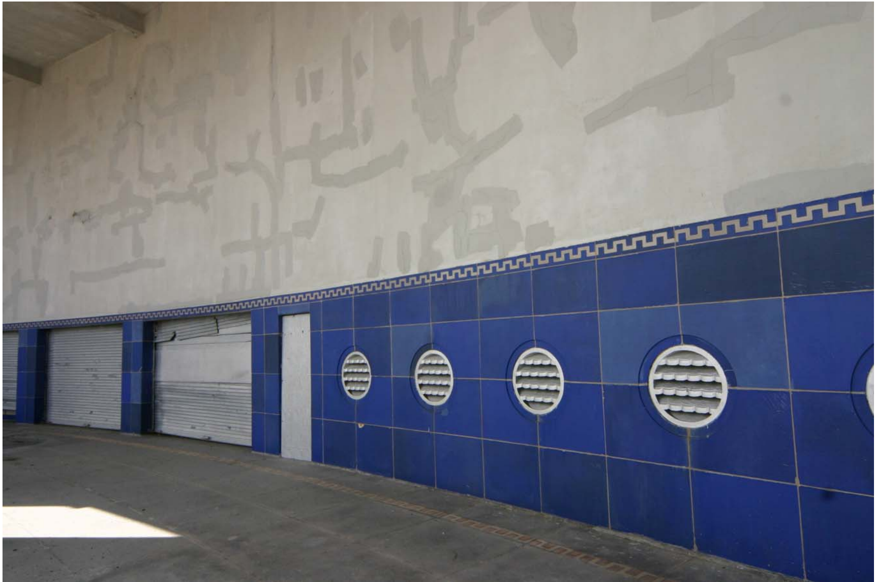
Orchard Beach Bath House and Promenade: South Loggia Wall