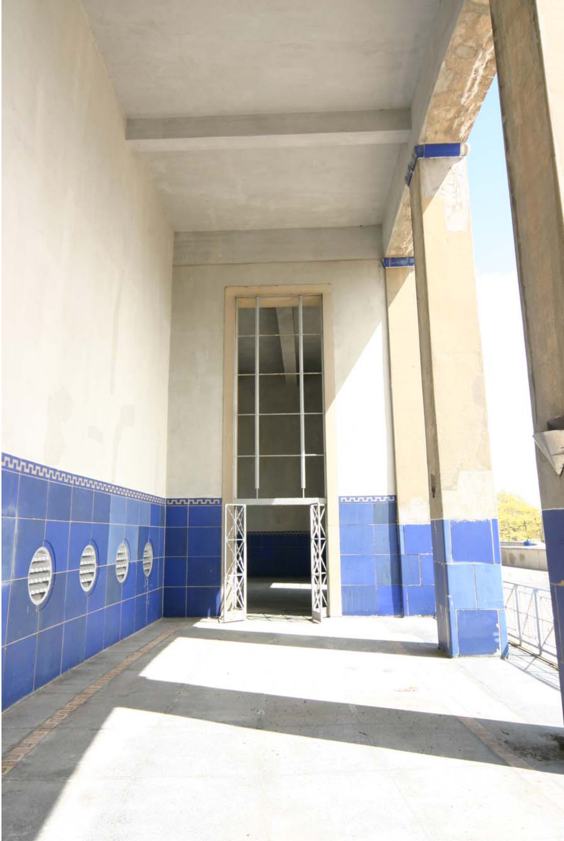
Orchard Beach Bath House and Promenade: South Loggia