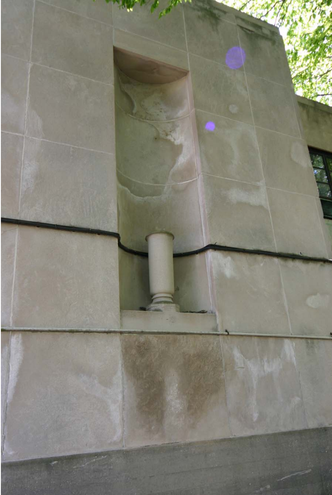
Orchard Beach Bath House and Promenade: Niche in West Facade Photo: Carl Forster, 2006