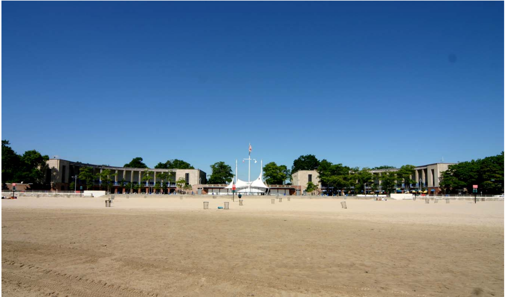
Orchard Beach Bath House and Promenade