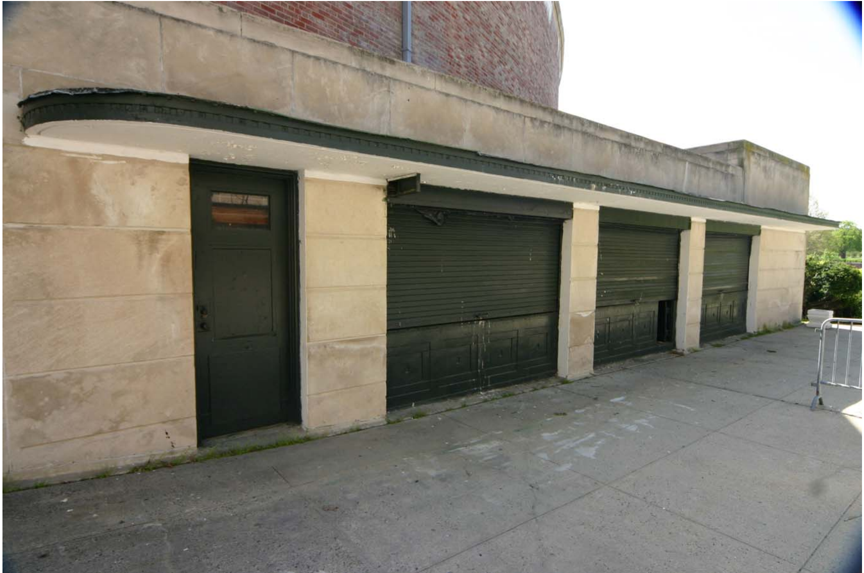
Orchard Beach Bath House and Promenade: South Ramp Concessions Windows