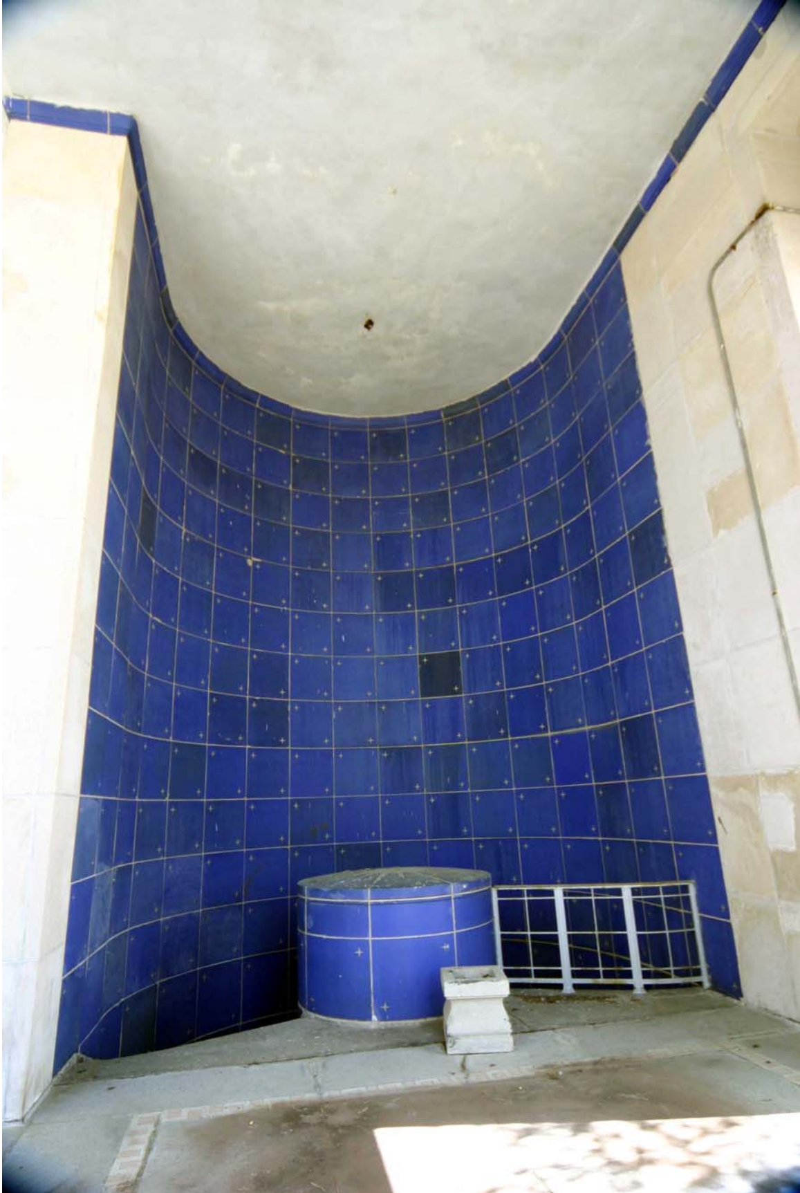
Orchard Beach Bath House and Promenade: Loggia Stair Well