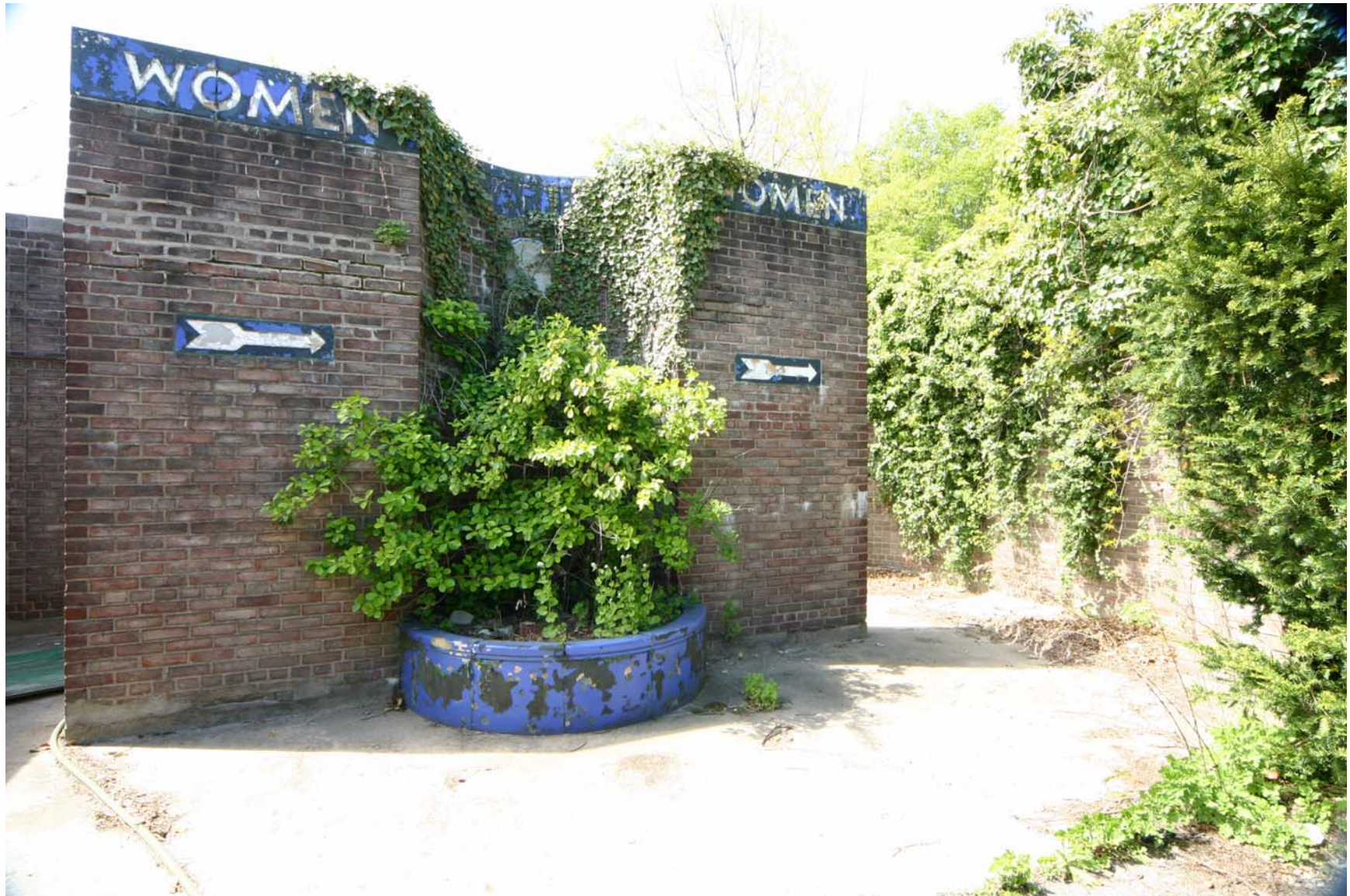
Orchard Beach Bath House and Promenade: South Locker Area Entrance