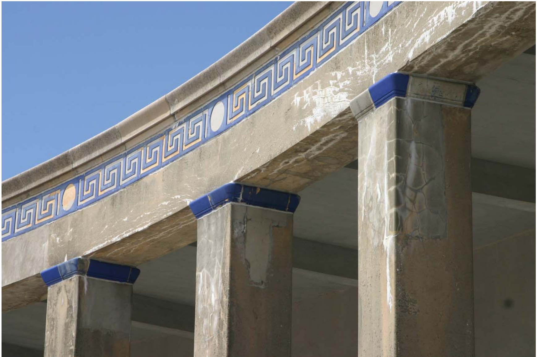
Orchard Beach Bath House and Promenade: Frieze Detail