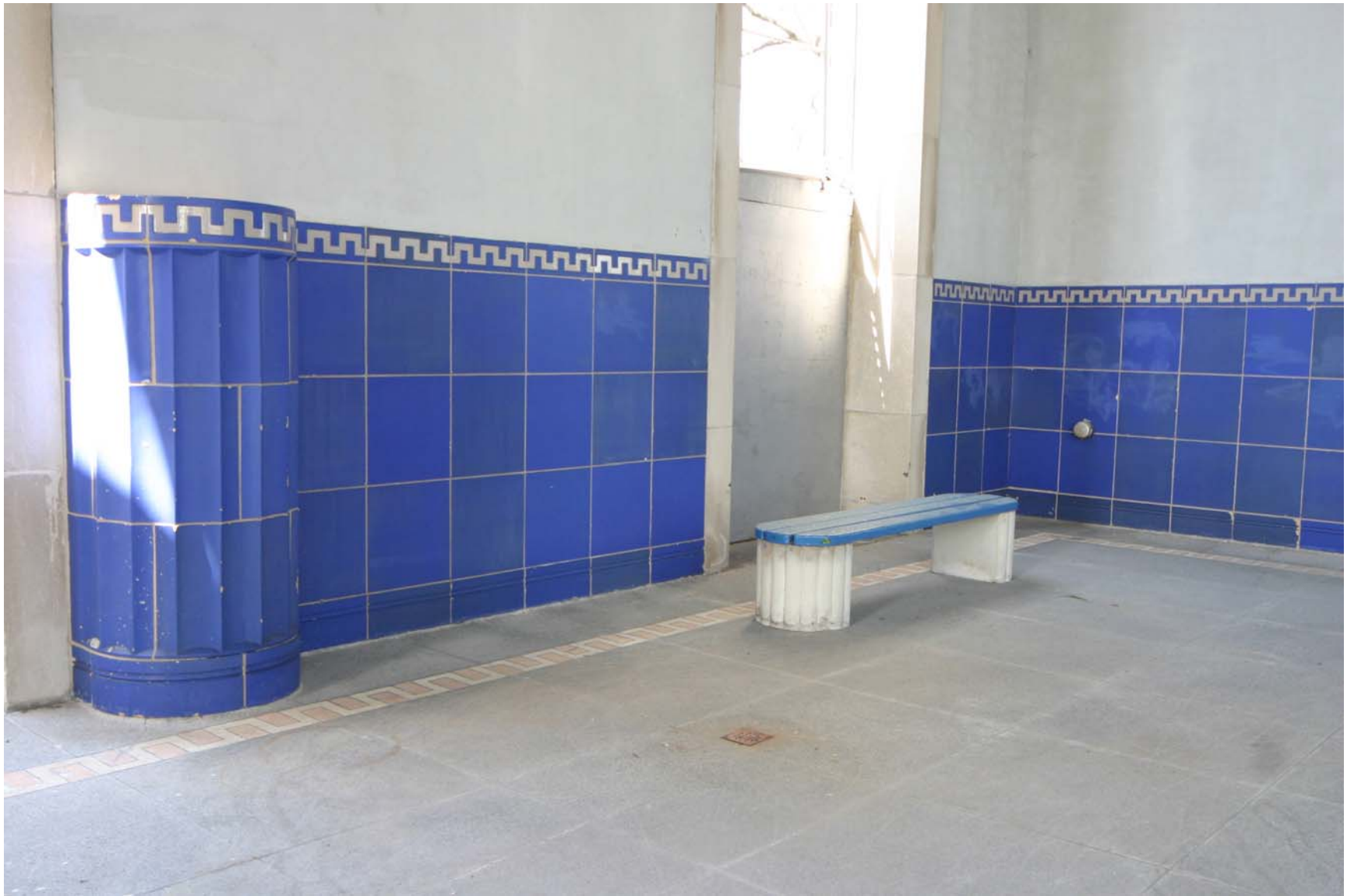
Orchard Beach Bath House and Promenade: North Lobby