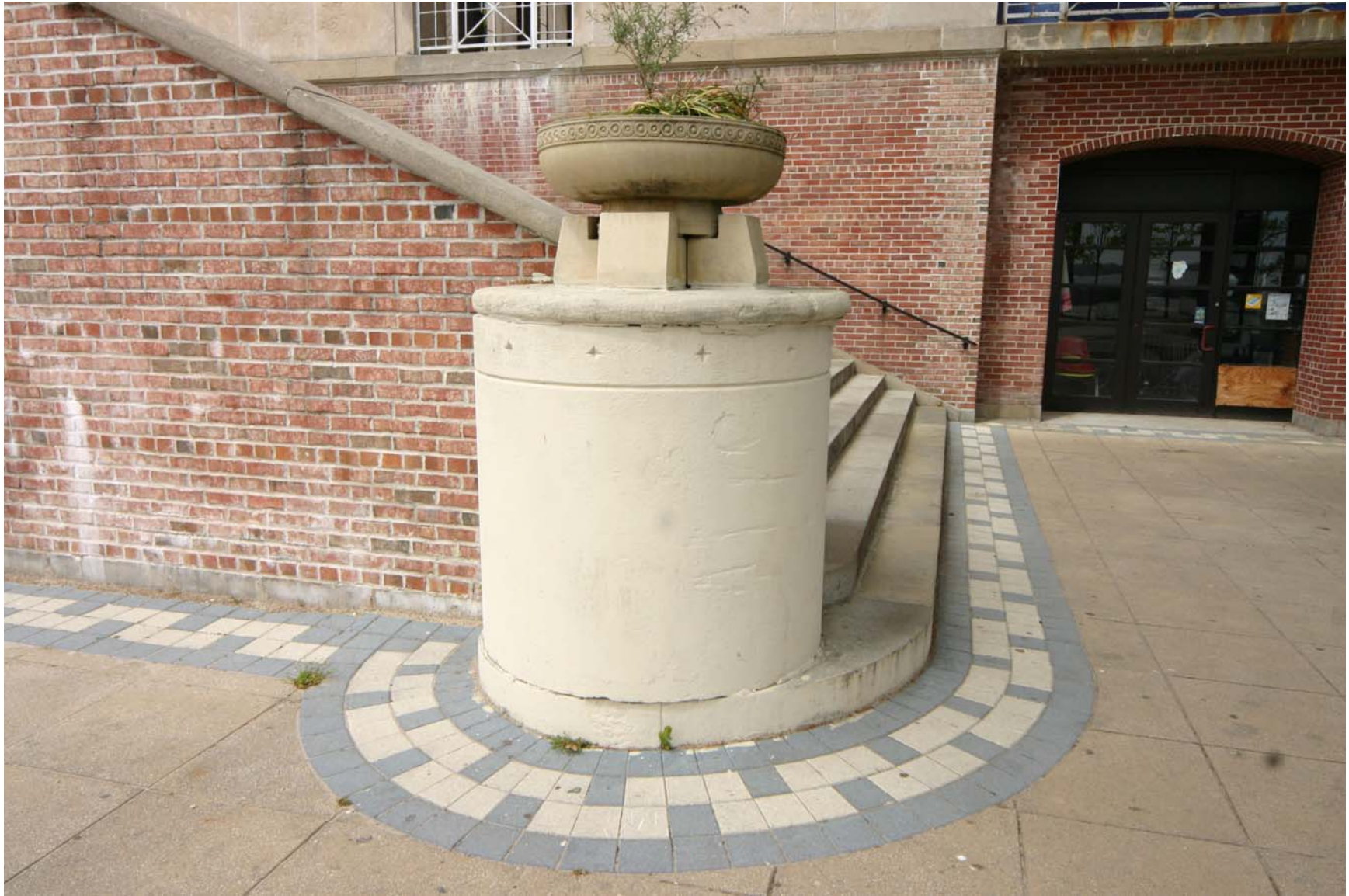
Orchard Beach Bath House and Promenade: Stair to Lower Terrace