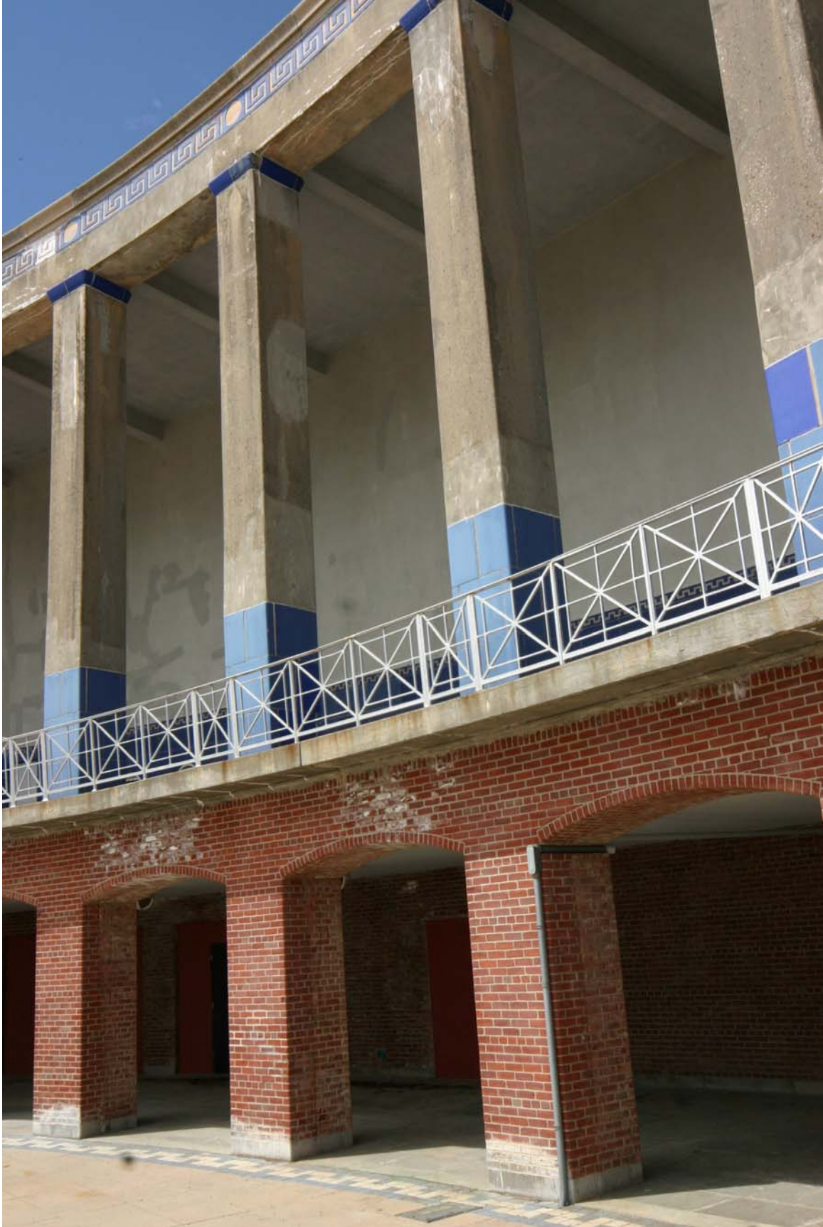
Orchard Beach Bath House and Promenade: East Facade