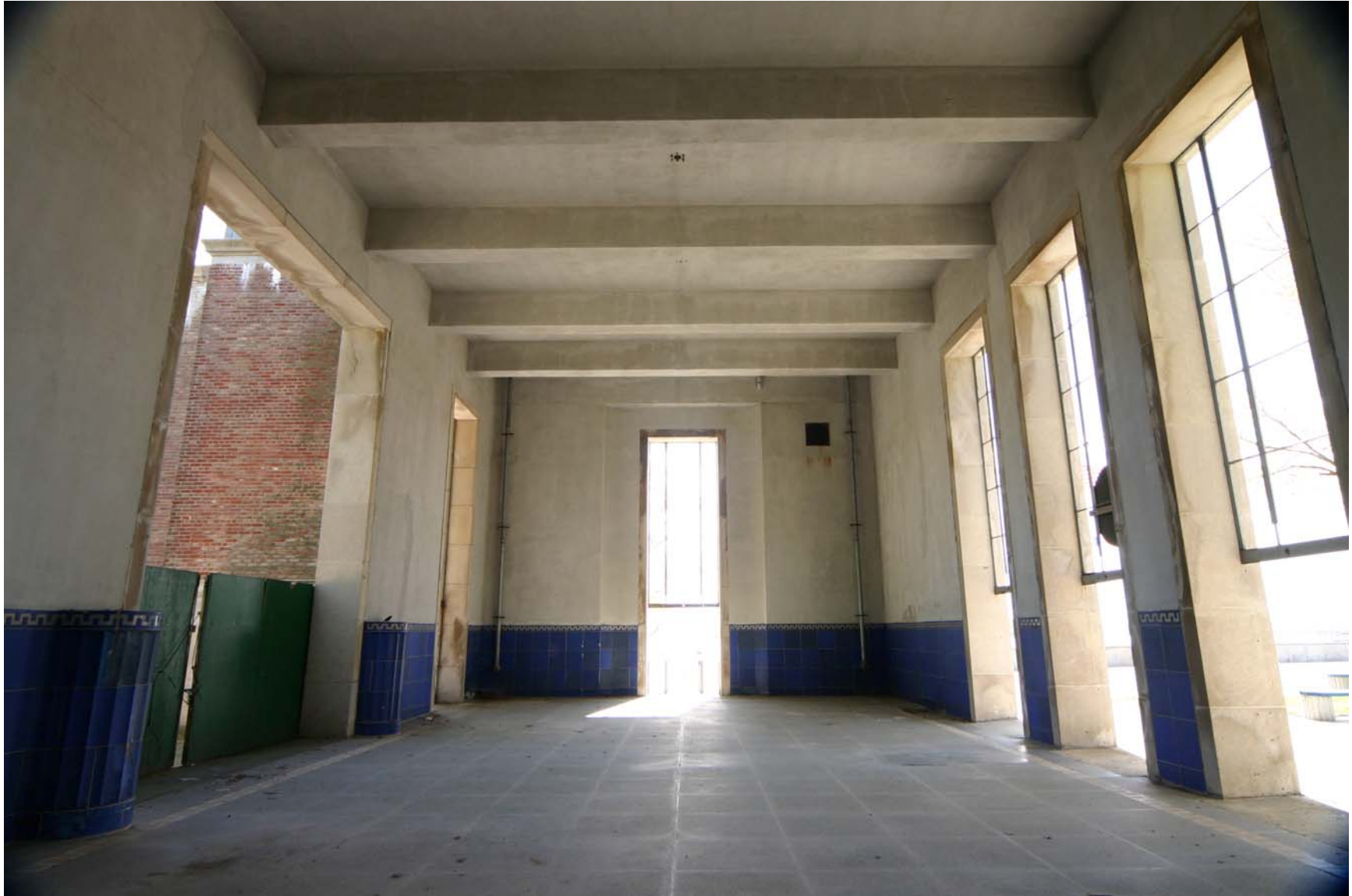
Orchard Beach Bath House and Promenade: North Lobby