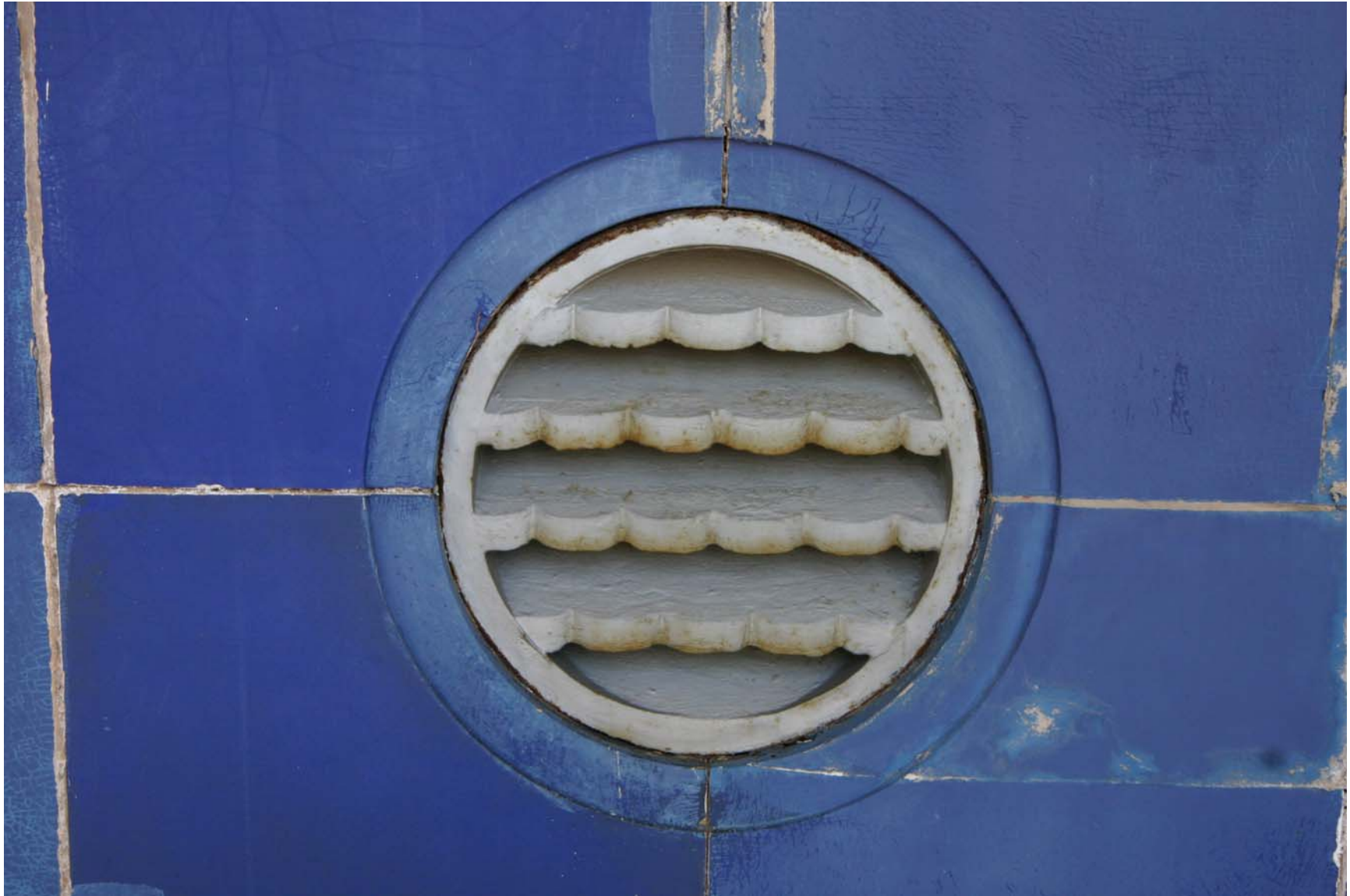
Orchard Beach Bath House and Promenade: Vent Port Hole