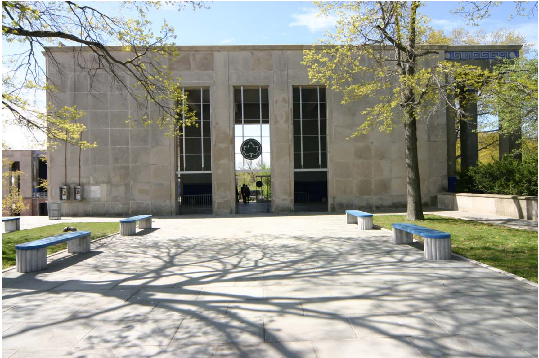
Orchard Beach Bath House and Promenade: Entry Plaza