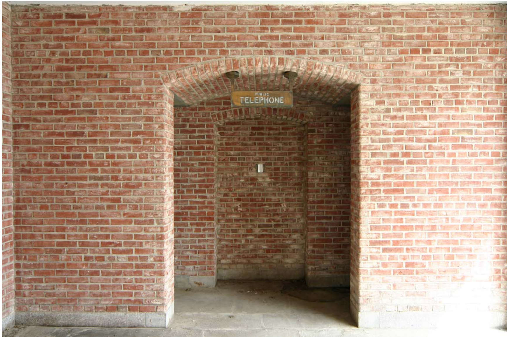
Orchard Beach Bath House and Promenade: South Arcade