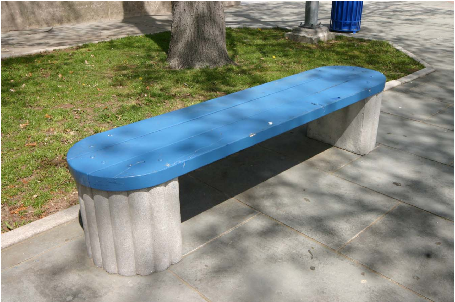
Orchard Beach Bath House and Promenade: Bench