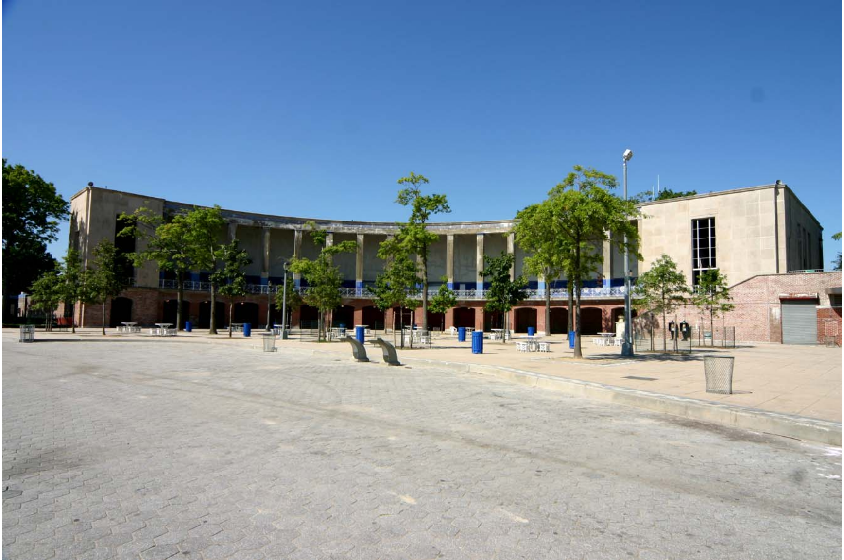
Orchard Beach Bath House and Promenade