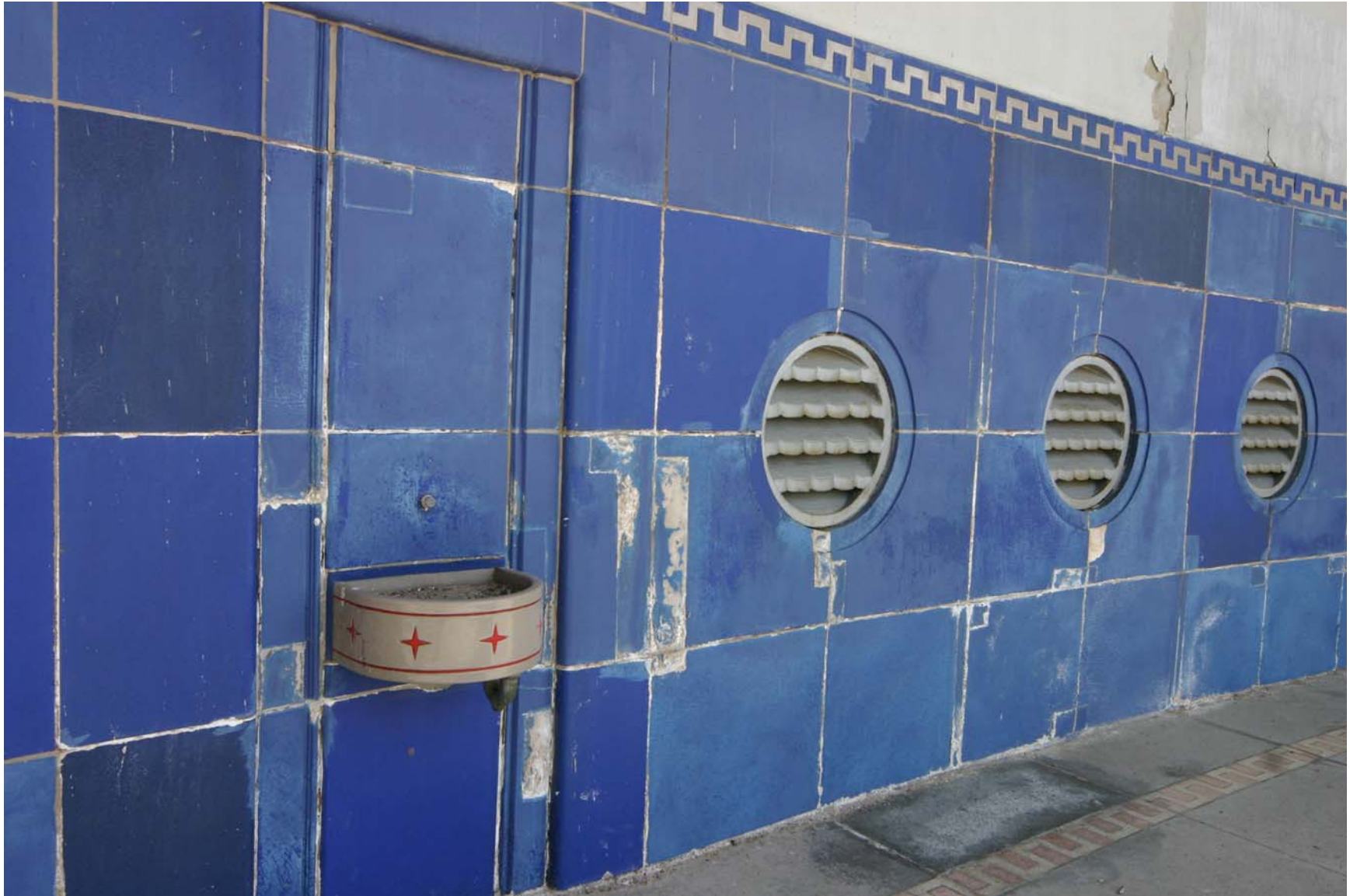
Orchard Beach Bath House and Promenade: North Loggia Wall