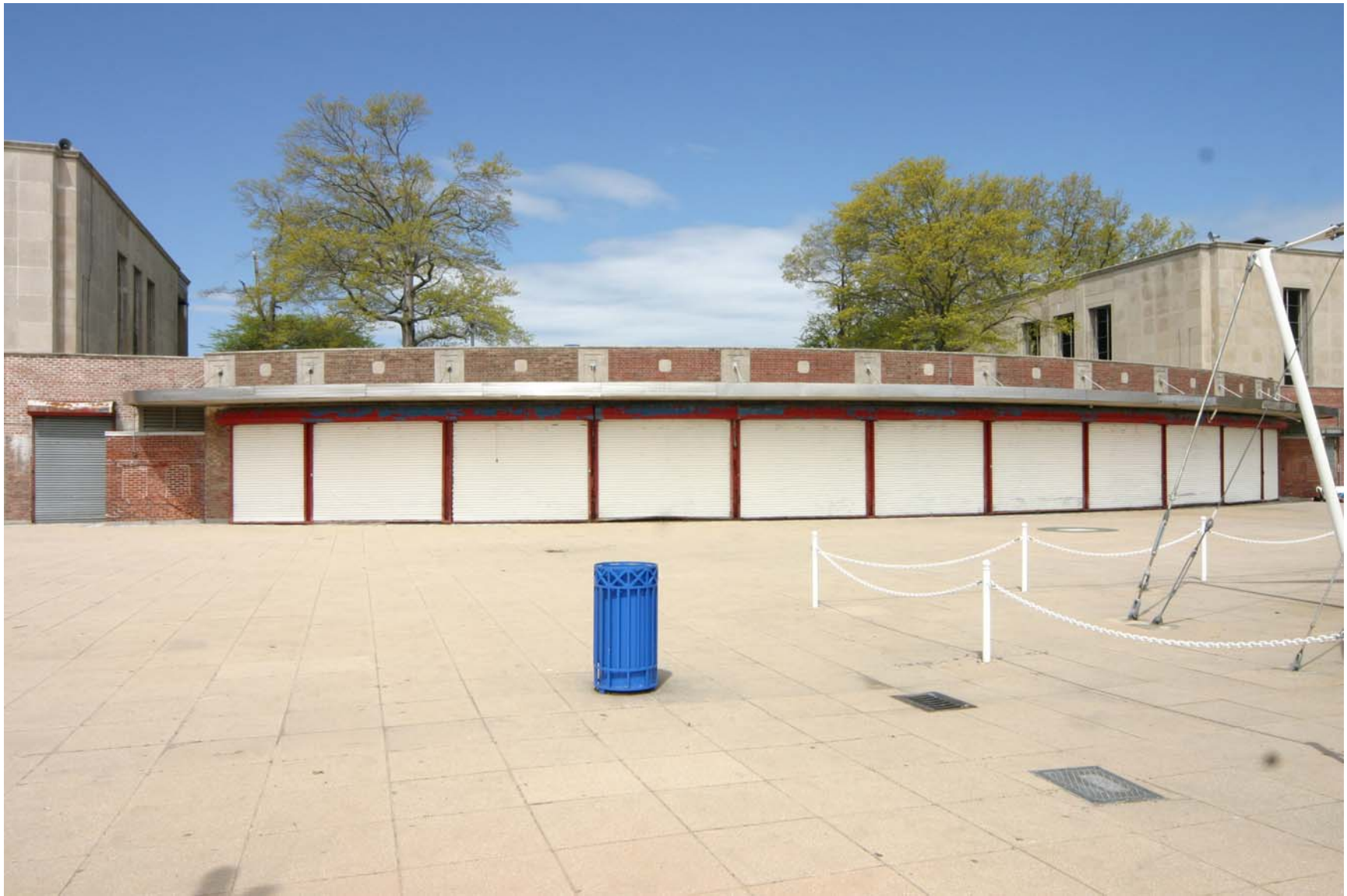
Orchard Beach Bath House and Promenade: Cafeteria Facade