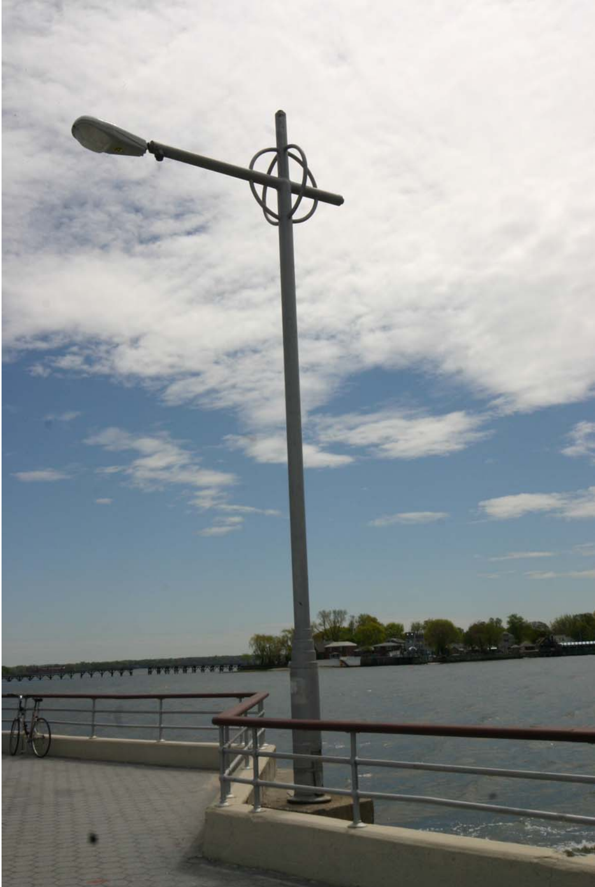
Orchard Beach Bath House and Promenade: Original Lamp Post