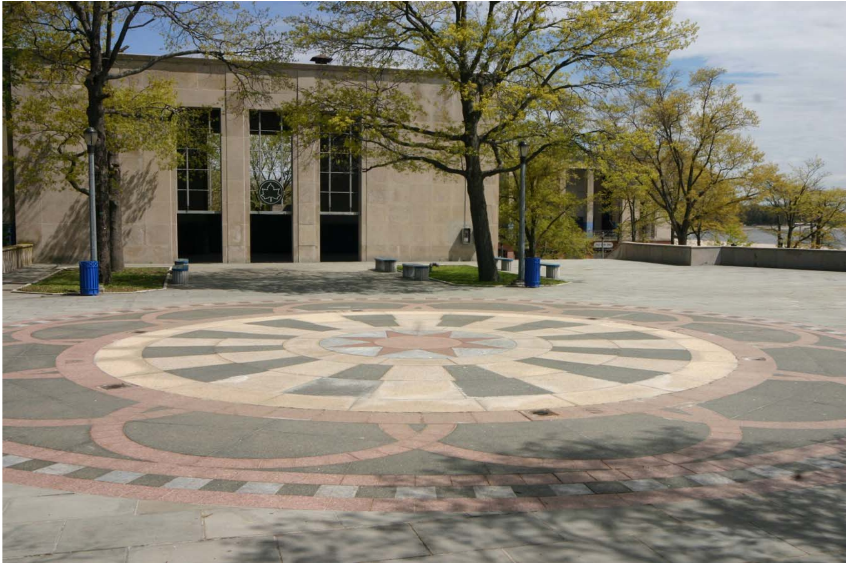
Orchard Beach Bath House and Promenade: Entry Plaza