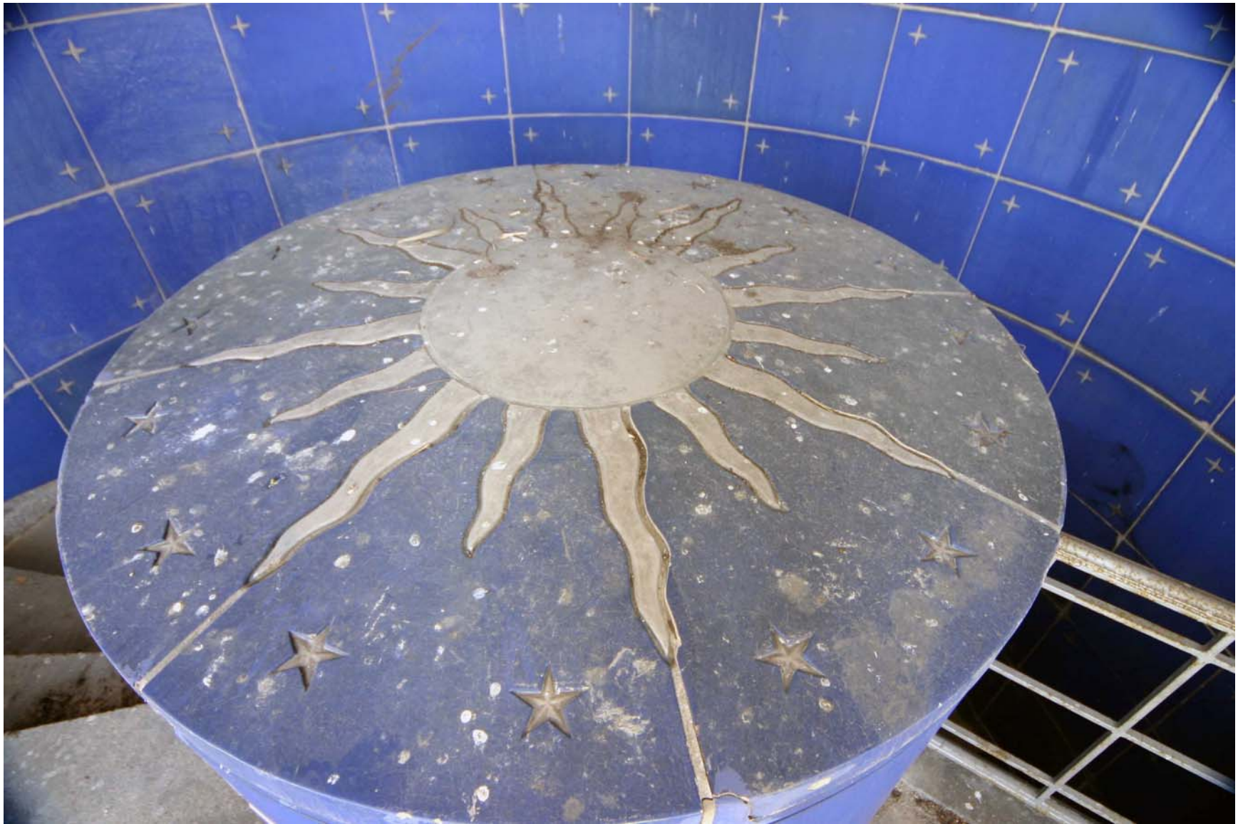
Orchard Beach Bath House and Promenade: Loggia Stair Well