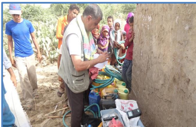
Water Quality Assessment