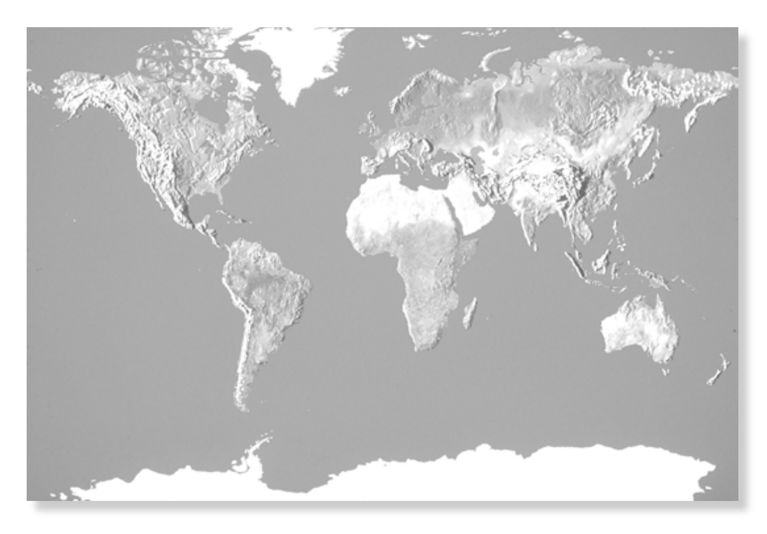
(Activity map key at the end of the book)