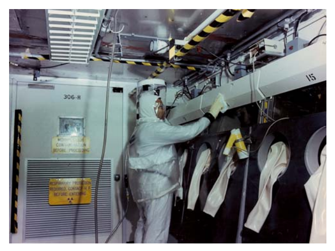
Site technician in the HB Line Glove Box Operations Area.