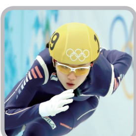
Figure Skating Short Track Speed Skating