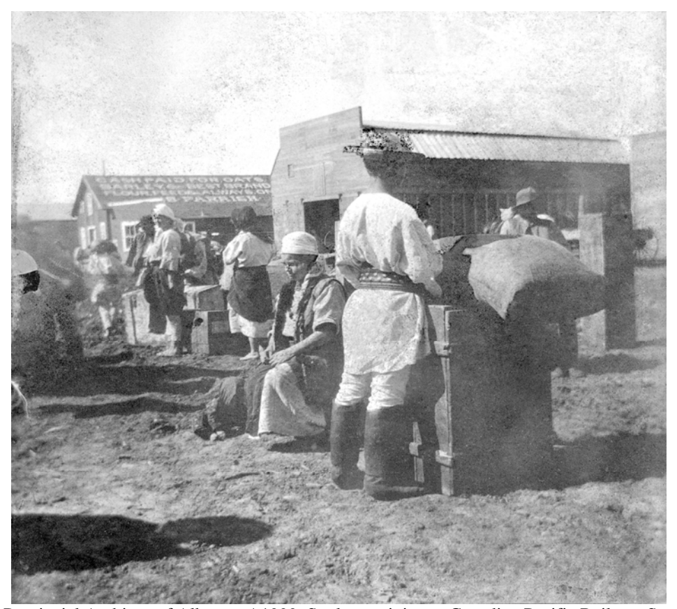
Settlers arriving at Canadian Pacific Railway Station, Edmonton, ca. 1900

Ukrainians have been a significant piece of the Alberta mosaic since the late 1800s. The mass immigration of Ukrainians to the west served as a catalyst for the formation of the province and its rapid development in the years to come.