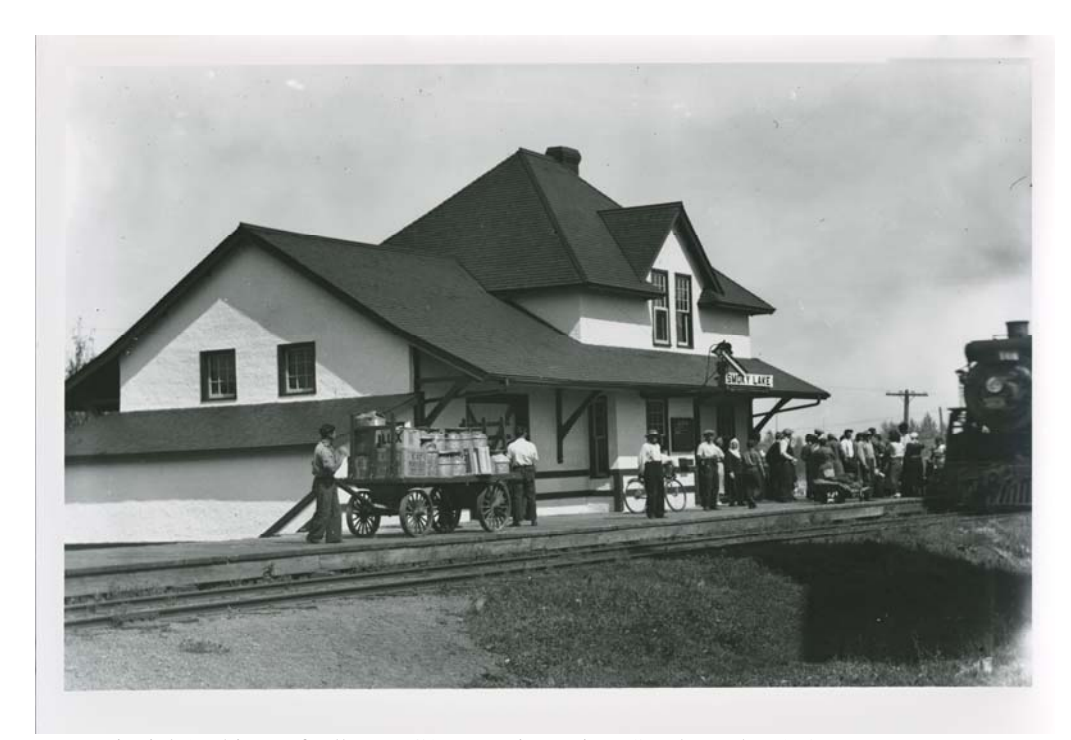
Train station, Smoky Lake, 1936.

Today about every fifth Albertan can claim Ukrainian ancestry, one of the largest Ukrainian communities outside of Ukraine. While the city of Edmonton remains the hub of the community life, there are sizable Ukrainian communities across the province – in Calgary, Lethbridge and other urban centres, throughout towns of the east central Alberta, Athabasca and the Peace River country in the north.