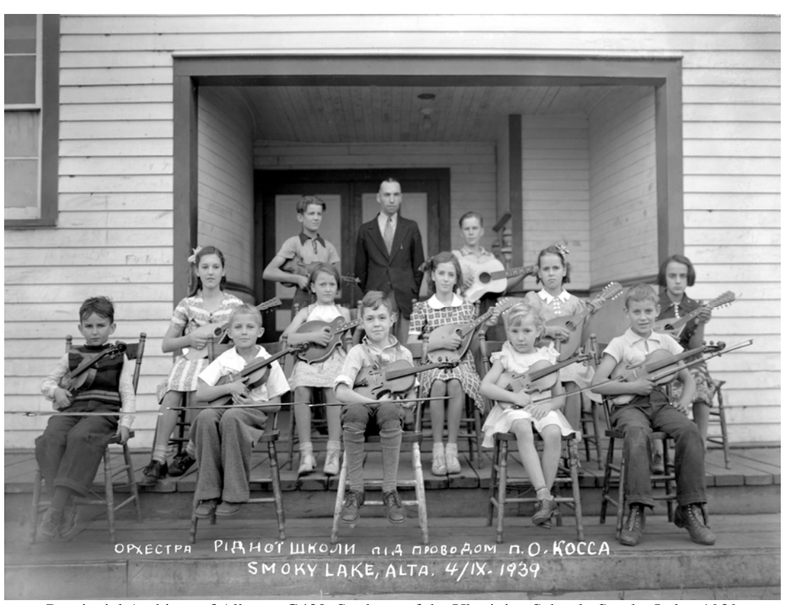
Provincial Archives of Alberta: G430, Students of the Ukrainian School, Smoky Lake, 1939