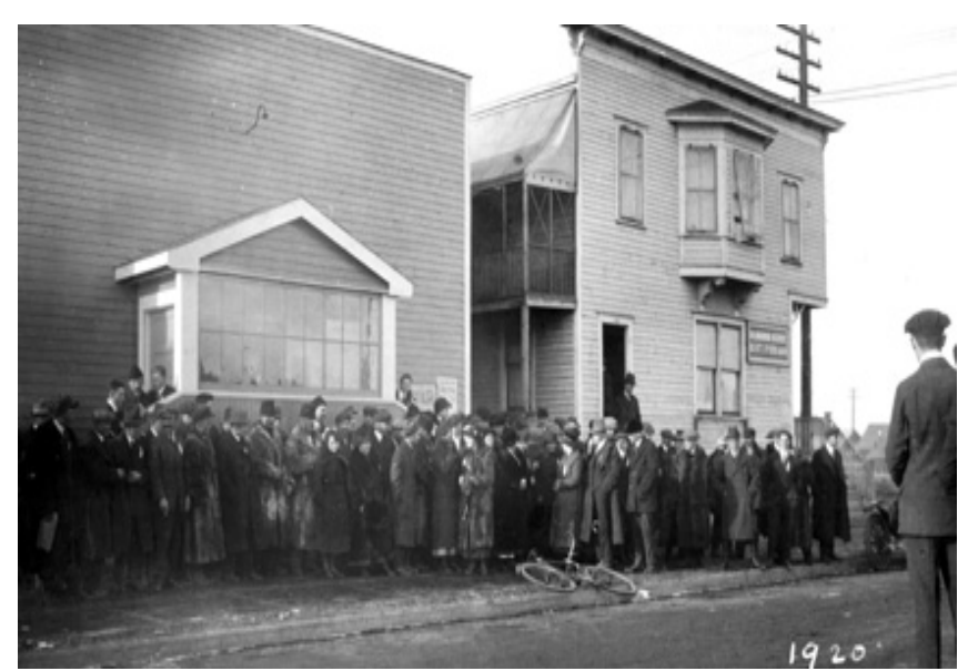
Provincial Archives of Alberta: G5, Ukrainian Institute (M.Hrushevsky), Edmonton, 1920