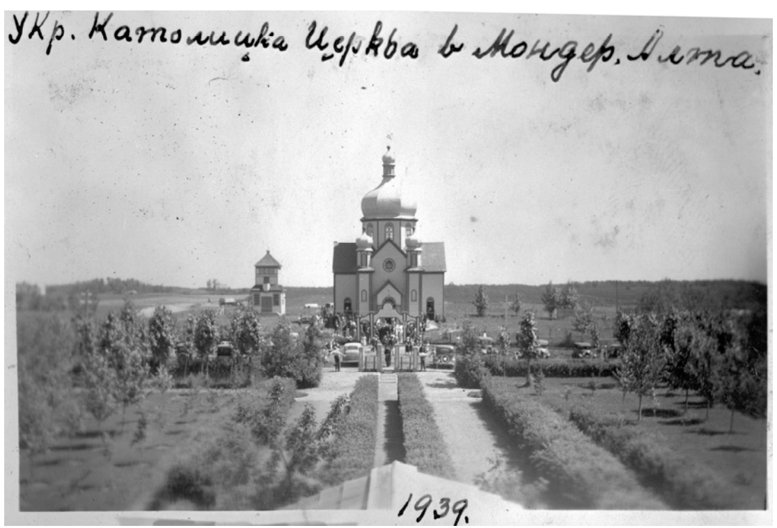
Provincial Archives of Alberta: A10061, Ukrainian Catholic Church, Mundare, 1939