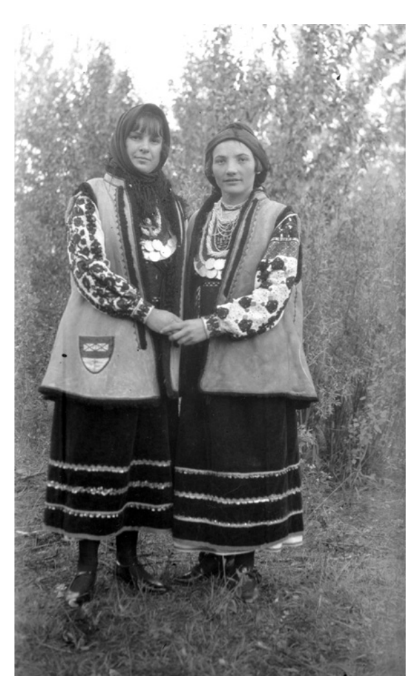
Provincial Archives of Alberta : G354, Women in Ukrainian Costume, Smoky Lake, [ca. 1935]