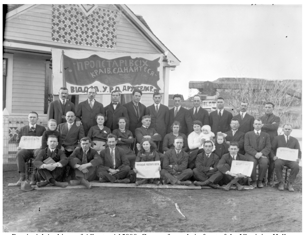
Group of people in front of the Ukrainian Hall, [Drumheller]