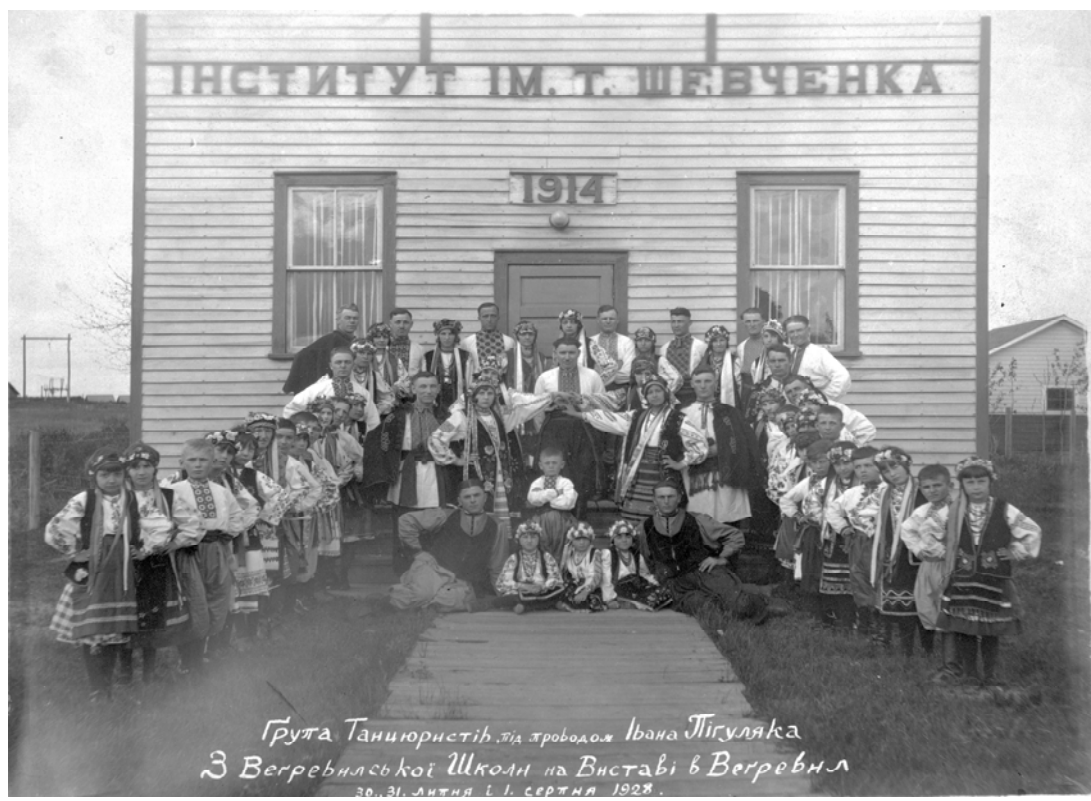
First Ukrainian School of Dance, Vegreville, 1928