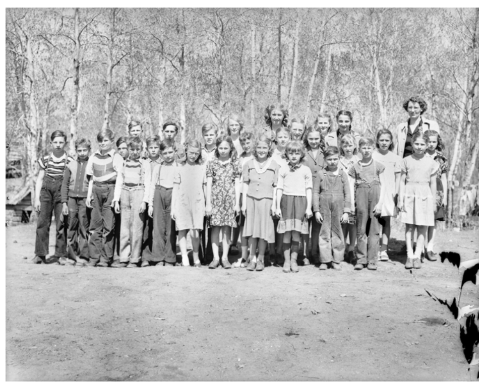
Junior Room Kotzman School, 1948