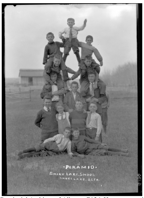
Human pyramid, Smoky Lake High School, [ca. 1927]