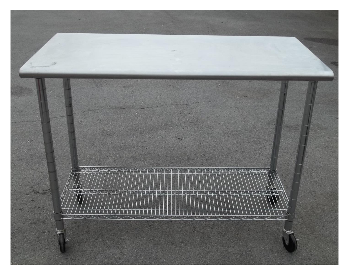
Stainless Steel Table