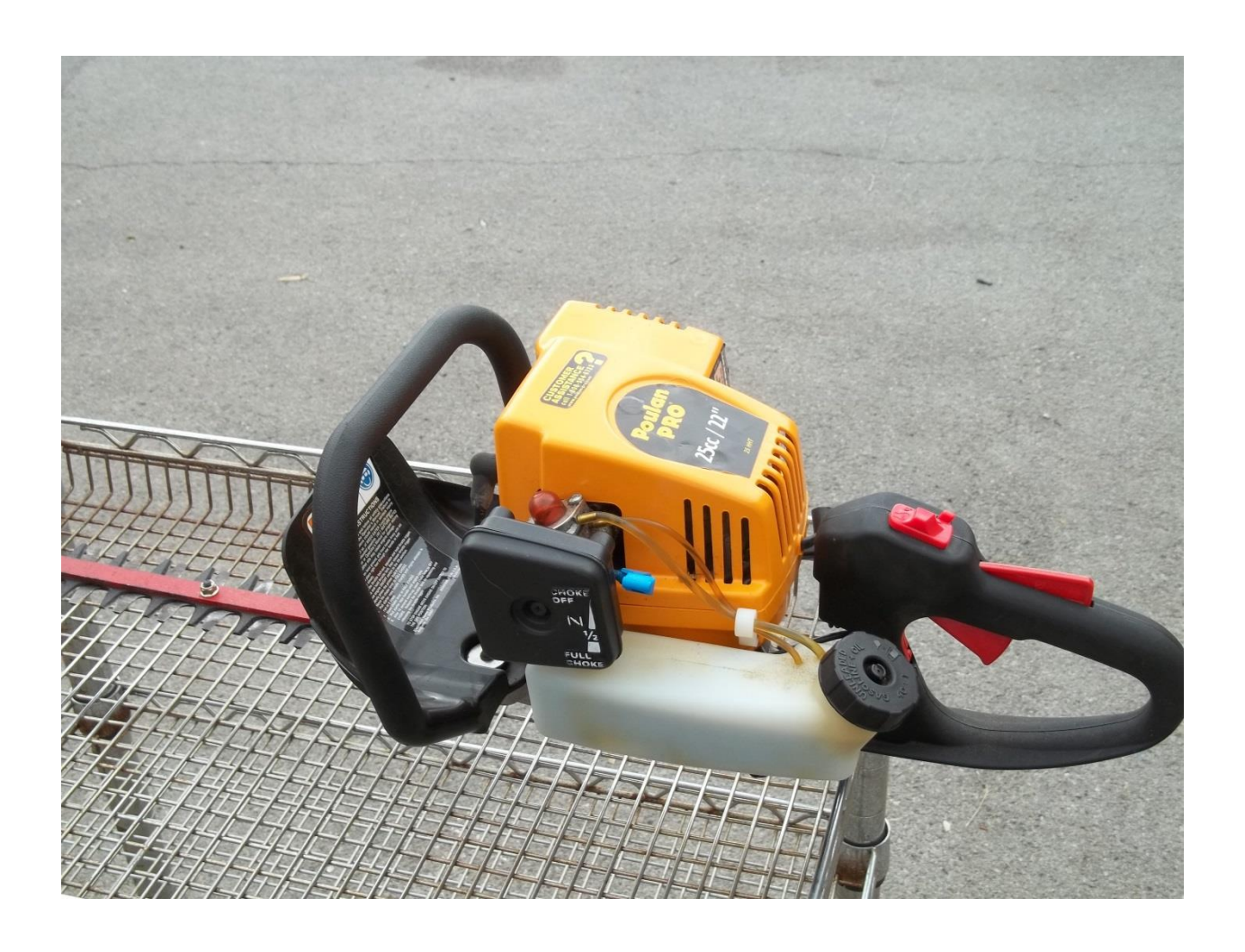
Poulan Pro 25cc Hedge Trimmer