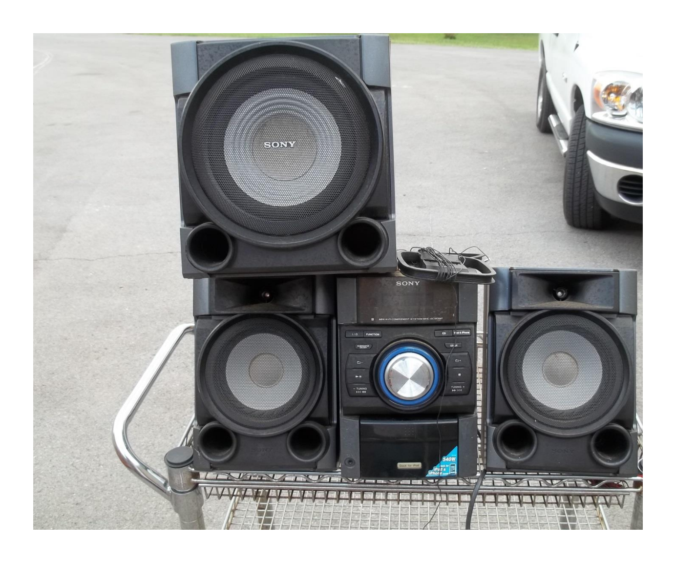
Sony Compact Disc Receiver, Sub-Woofer Speaker System, & Speakers