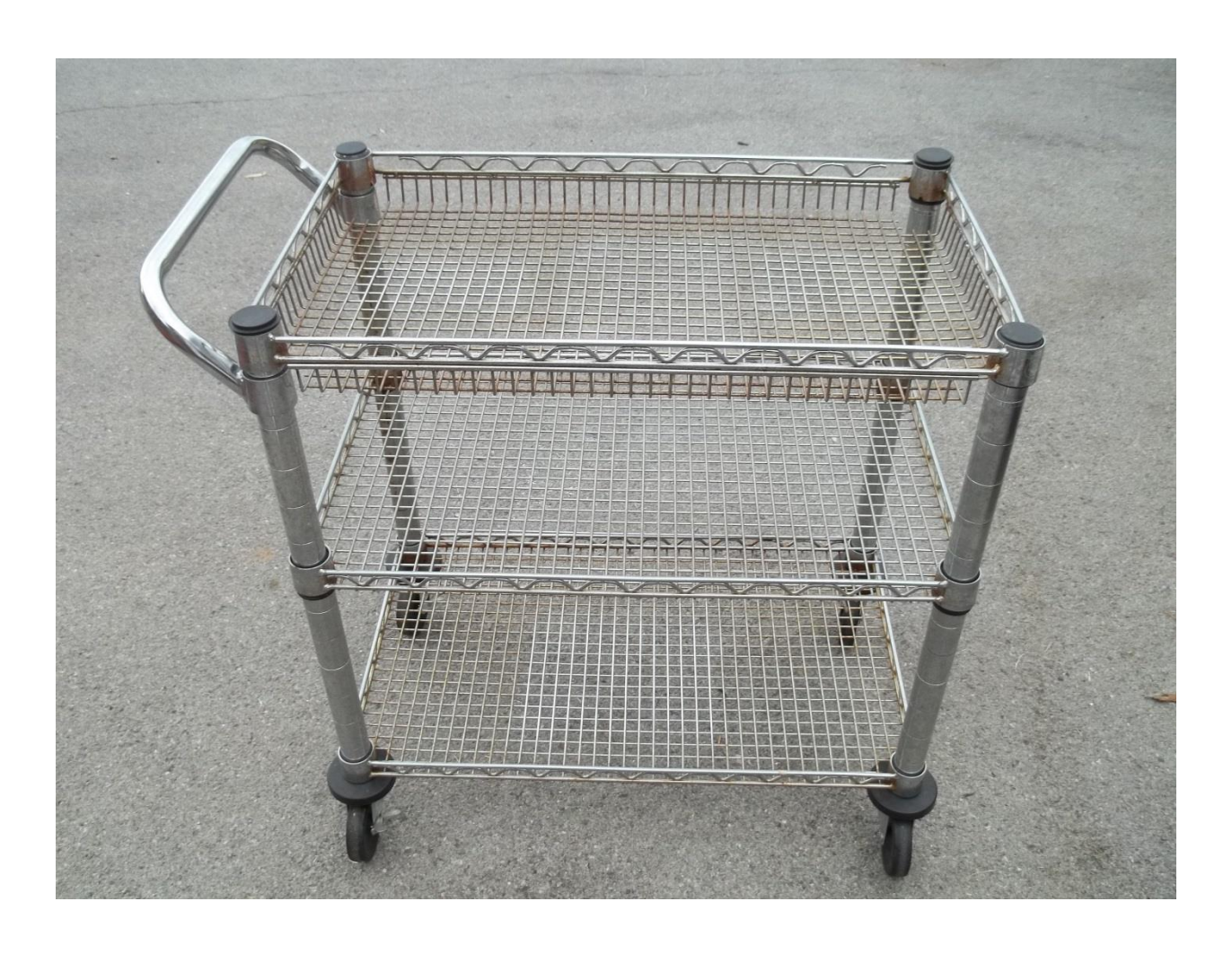
Stainless Steel Serving Cart