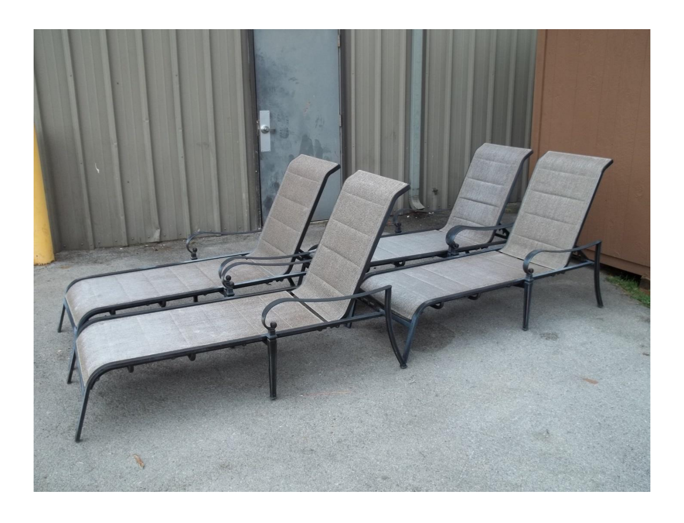
Pool Lounge Chairs