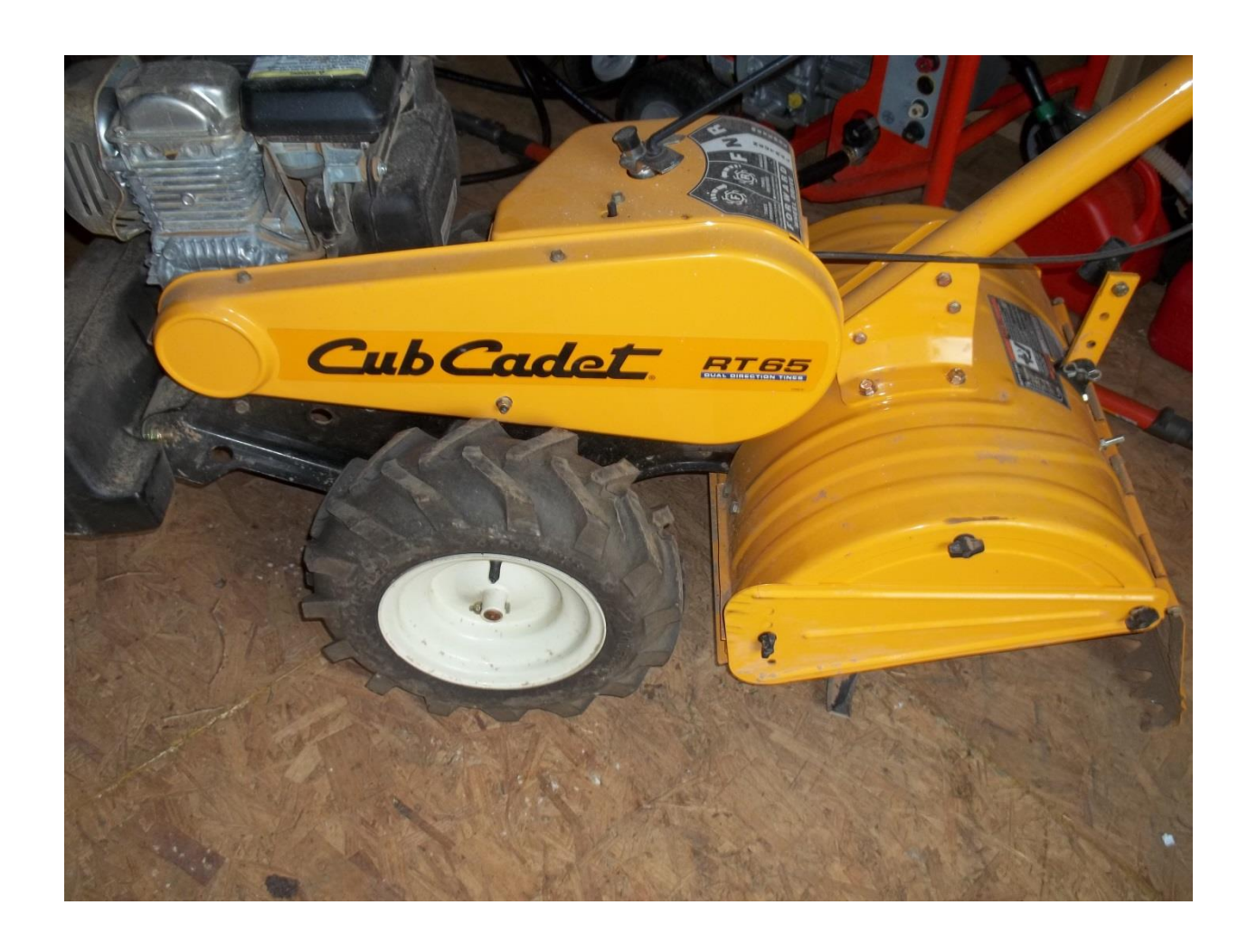
Cub Cadet RT65 Rotary Tiller