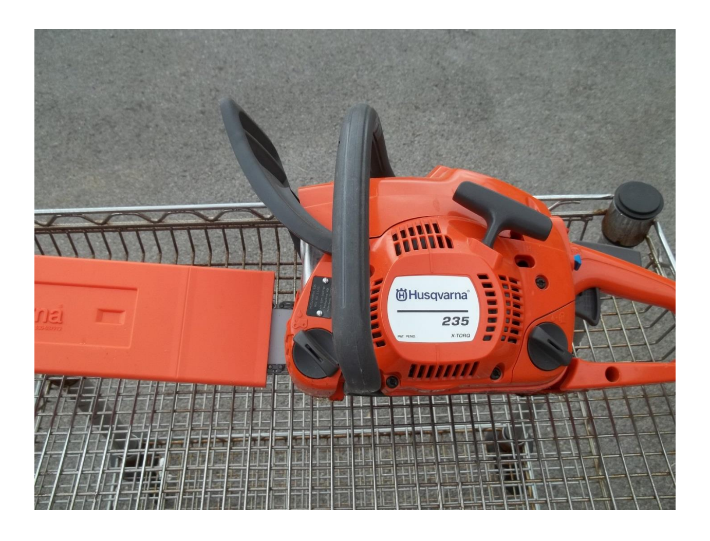
Husqvarna 34cc Chain Saw