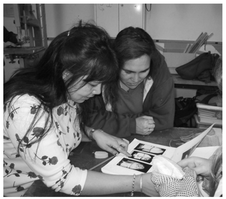
Ouzinkie students and teachers study photographs of Alutiiq masks.

Carving Traditions was one of a series of workshops in the museum's Traveling Traditions program, produced annually in partnership with the Kodiak Island Borough School District. Created with grants from Native corporations, private foundations, and public agencies, the Traveling Traditions program meets multiple goals. At the general level, the program preserves and shares Alutiiq heritage by spreading knowledge of time-honored arts—carving, weaving, and skin sewing. At a deeper level, it promotes respect. In collaboration with the school district, Traveling Traditions reaches underserved audiences outside the museum gallery. This partnership also provides an opportunity for educators—who are not always sympathetic to the need for cultural education—to explore Alutiiq