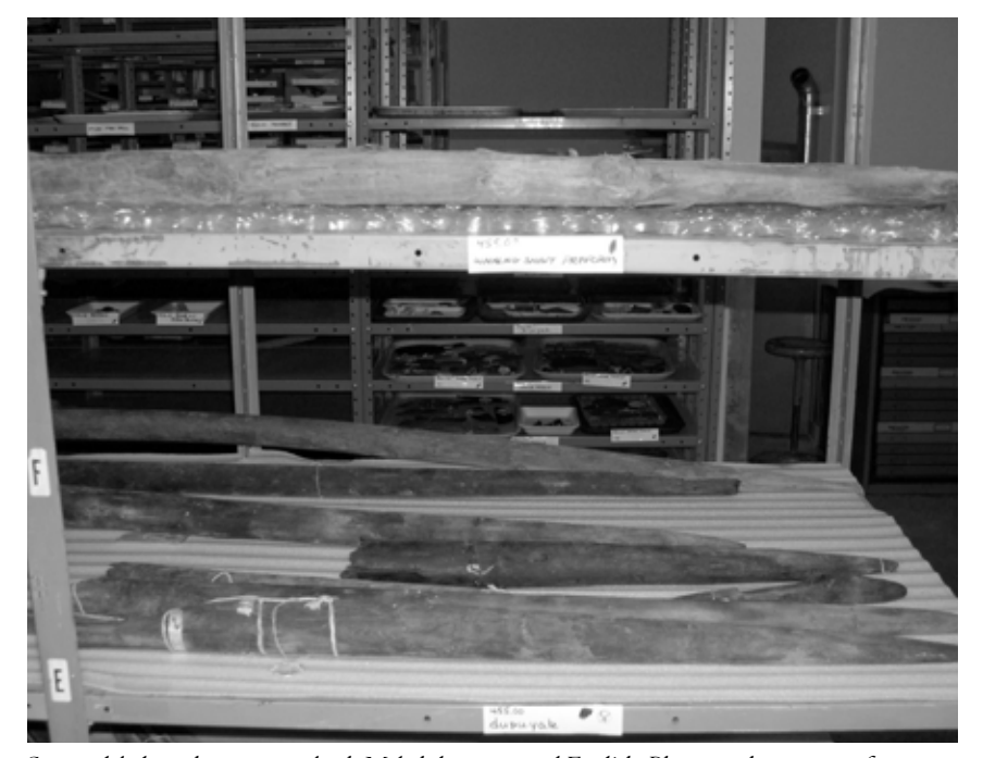
Storage labels at the MCRC use both Makah language and English.