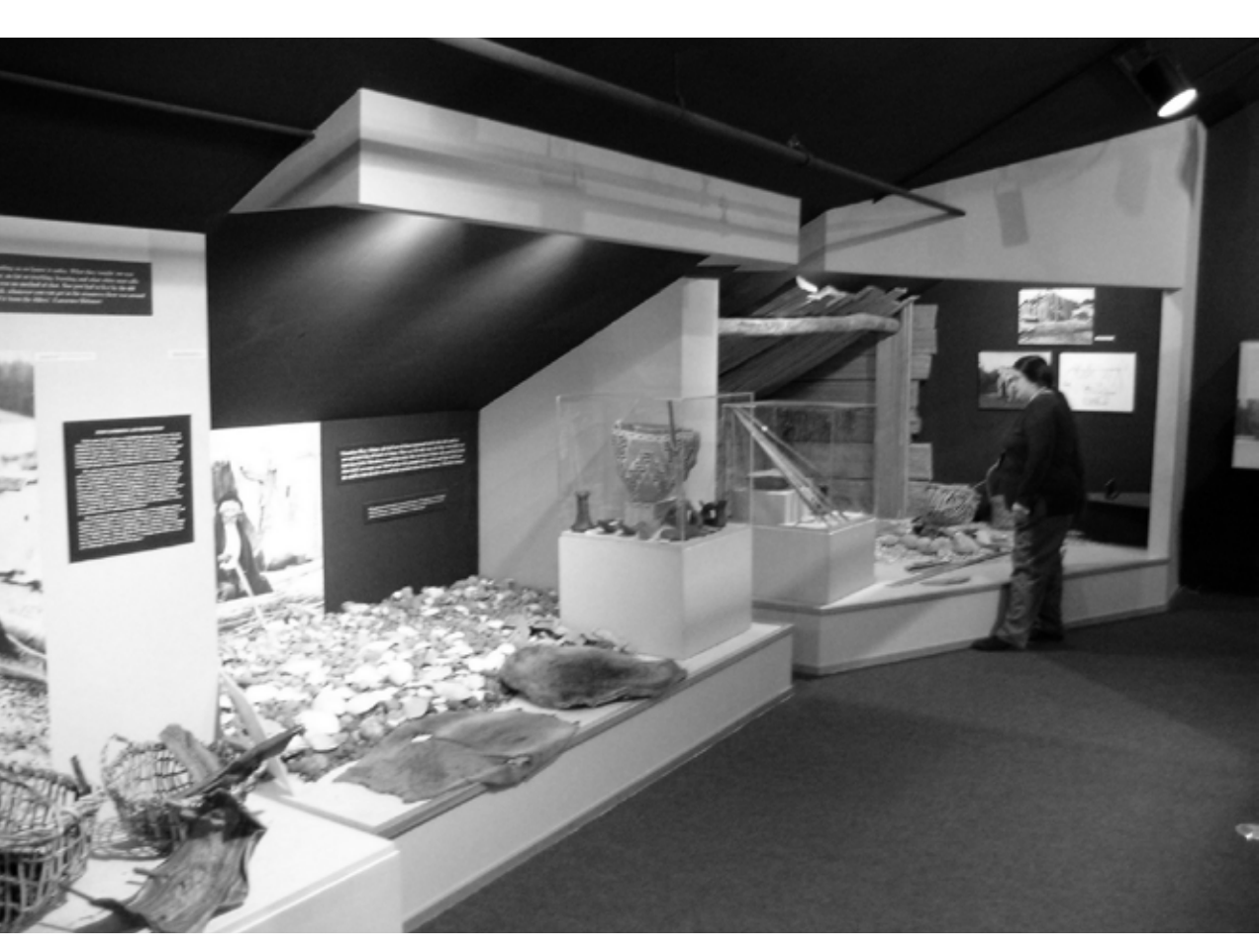
Interior of the Suquamish Museum.