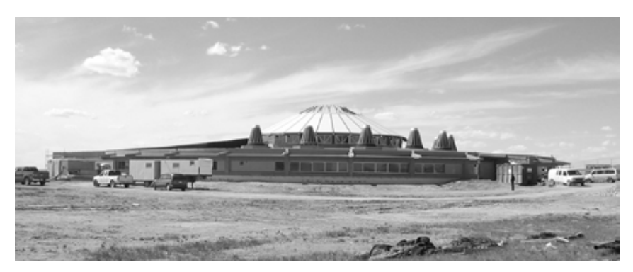
The design of the Blackfoot Crossing interpretive center resembles a painted tipi laid out on the ground, forming a half-circle. The seven cones on the roof represent the seven warrior societies of the Siksika.

Nations people who are interested in pursuing museum-related professions and invaluable to the museum community whose mission is to serve First Peoples.