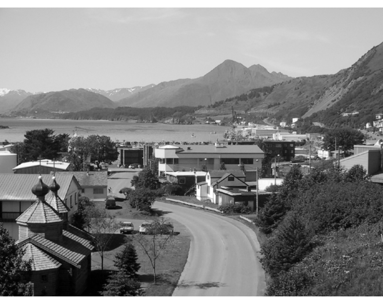
The Alutiiq Center in downtown Kodiak. The Alutiiq Museum occupies the first floor of the two-story building in the center of the photograph.