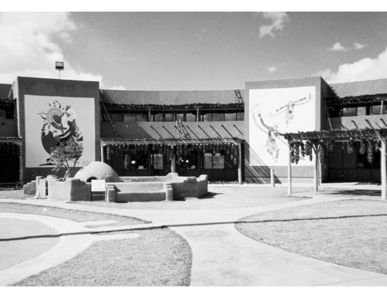
Albuquerque's Indian Pueblo Cultural Center represents nineteen Pueblo tribes of New Mexico with museum, performance, and meeting spaces; sales outlets; and a restaurant.