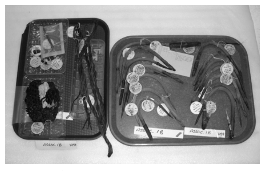
Artifacts in storage.