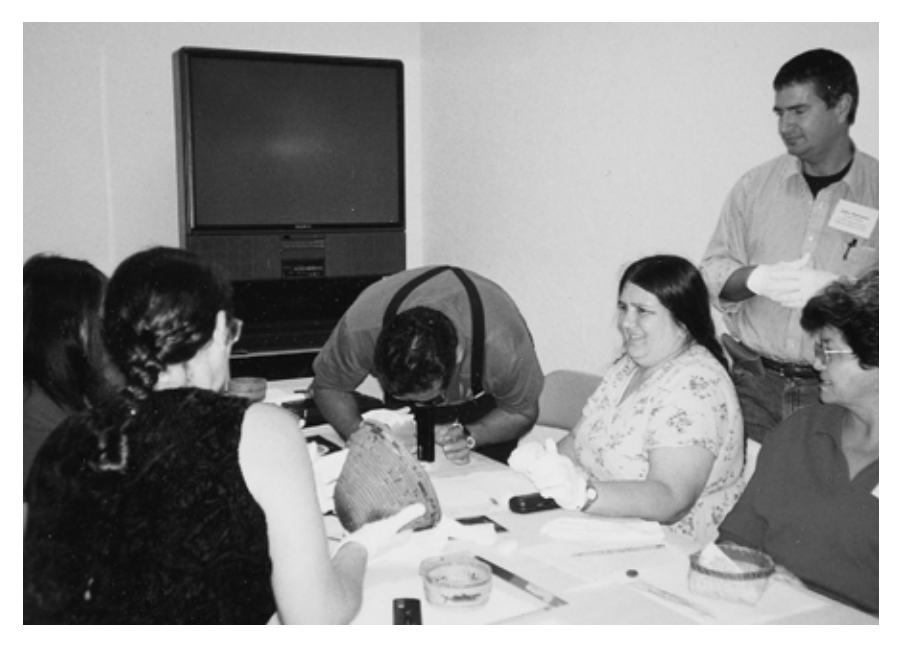
Participants in a training workshop at the Tunica-Biloxi Museum in Marksville, Louisiana, examine insect damage to baskets from their respective museum collections. The Tunica-Biloxi Museum was established when the tribe gained possession of artifacts that had been pillaged from an ancestral site.