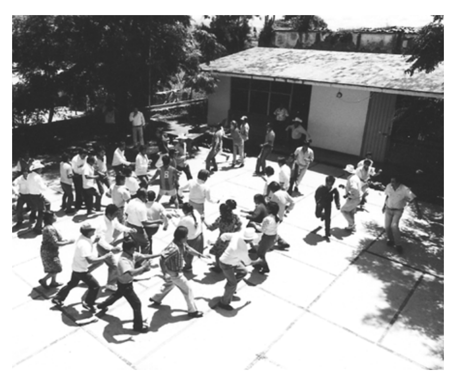
Group activity during a meeting of the Union of Community Museums of Oaxaca, San José el Mogote, 1993.

assembly, the community meeting, or the tribal council, the next step is to present the proposal of the museum project for community approval. The requirements the initiators must fulfill in order to gain this approval vary greatly from case to case. This step could entail clarifying the idea of the museum, convincing local authorities to present the proposal for consideration, and disseminating the proposal widely among the local population. When such decision-making processes are clearly in place, the task of generating consensus community approval is made much easier.