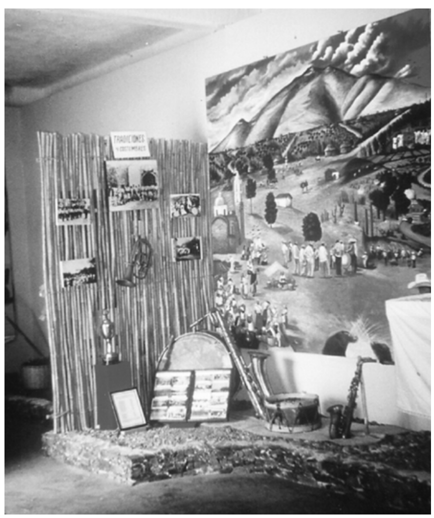
Exhibition on local religious customs at Yukuni'i, a community museum in San José Chichihualtepec, 2003.