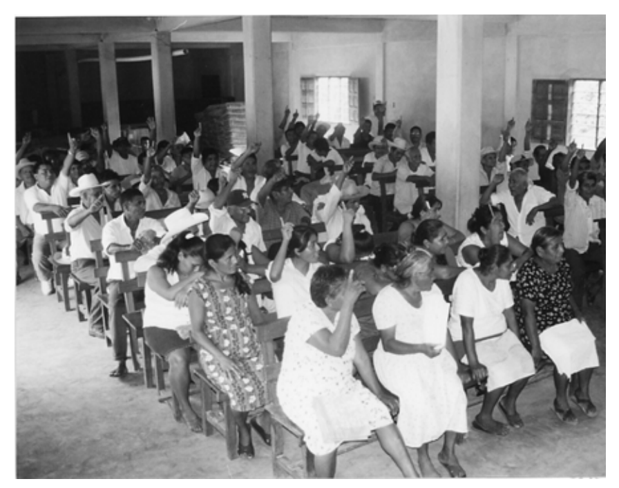
Community assembly electing a new museum committee, Cerro Marín, April 2004.

The first steps taken to create a museum with these characteristics can vary greatly from case to case, but a common thread is the initial establishment of community ownership of the project. The beginning of the museum is rooted within the community to develop an inclusive decision-making process and build the vision and organization that will allow the community to be in charge of the project. The first actions carried out in this direction will be vital if local involvement is to continue growing.