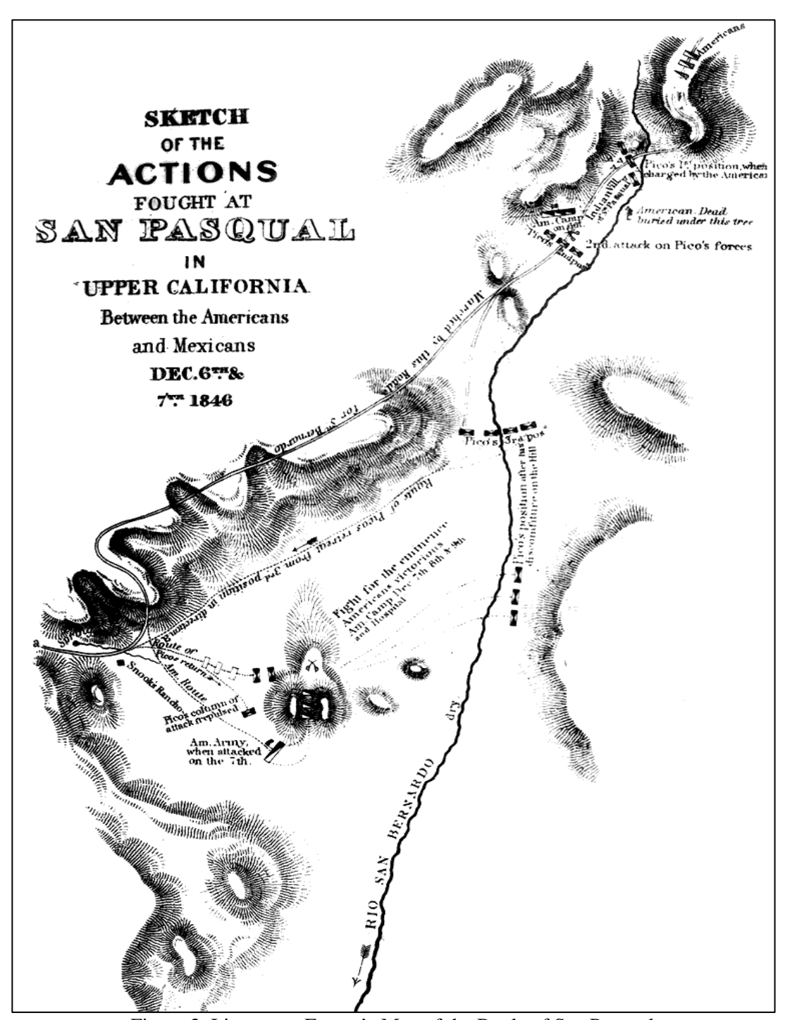
Figure 3: Lieutenant Emory's Map of the Battle of San Pasqual