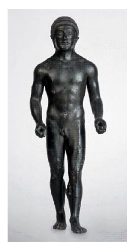
Statuette of an Athlete. ca. 550 B.C. Bronze. Attic workshop. Found on Acropolis of Athens, 1888. National Archaeological Museum, Athens, 6445