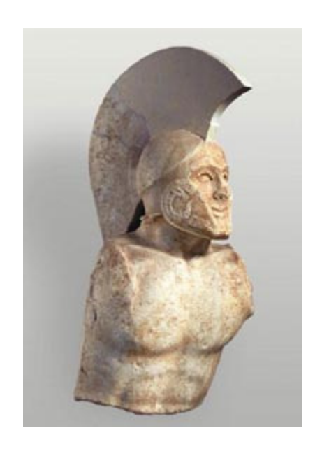
Statue of a Hoplite known as "Leonidas." 480-470 B.C. Parian marble. Found southwest of peribolos of the sanctuary of Athena Chalkioikos on the Acropolis of Sparta. Archaeological Museum, Sparta, 3365

New York, NY, November 8, 2006—Athens-Sparta, an exhibition of rare archaeological artifacts and works of art from Athens and Sparta, Greece, will open at the Onassis Cultural Center in New York City on December 6, 2006. Highlights of the exhibition include treasures such as a marble statue of a hoplite, known as "Leonidas", from the end of the 5th century B.C.; a marble statue of an Athenian Kore from the Acropolis Museum, from the 5th century B.C.; bronze figurines of hoplites from Sparta, from the 8th to the 6th centuries B.C.; a ceramic kylix by the Arkesilas Painter from the 6thcentury B.C.; a marble statuette of Athena from the mid-4th century B.C.; Attic marble reliefs and grave stele from the late 5th century B.C.; and arrowheads and spearheads from Thermopylae, the famous 5th century battlefield. The 289 exquisite artifacts in the exhibition, many of which are traveling abroad for the first time, will be on view at the Onassis Cultural Center in New York through May 12, 2007.