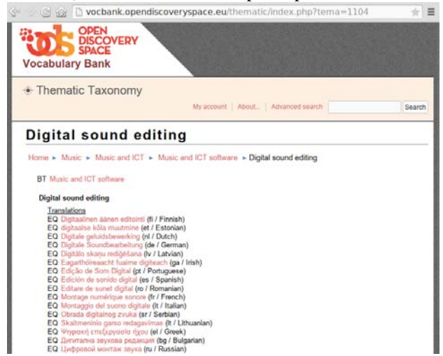
Fig. 2. The page of the term "Digital sound editing" TemaTres has been adapted and extended, including:

ODS infrastructure. Meeting the requirements set in section 3, it facilitates authorized users for editing and organizing the terms, their descriptions, translations and relations. Additionally, it assists in linking terms between associated vocabularies and supports Semantic Web technologies for exporting the ODS terms in Linked Data formats. Through the ODS Vocabulary Bank, all terms of relevant vocabularies are publicly available to every interested party, readily accessible with any modern web browser, as well as via well-documented web services. Furthermore, the ODS Vocabulary Bank enables a complete export of the vocabularies and taxonomies using well-established specifications and file formats (SKOS-Core, Zthes, TopicMaps, Dublin Core, etc.).