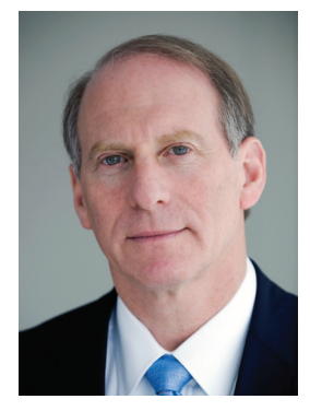
Richard N. Haass

Founded in 1921, the Council on Foreign Relations' ranks include many of the most prominent leaders in the foreign policy arena. With over 4,900 members, CFR's roster includes government officials, renowned scholars, business leaders, acclaimed journalists, prominent lawyers, and distinguished nonprofit professionals. The membership is divided almost equally among those living in New York, Washington, DC, and across the country and abroad, and it is a group unmatched in accomplishment and diversity in the field of international affairs.