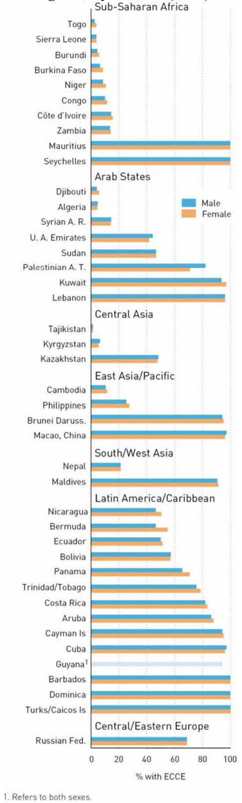
Figure 8b: New Entrants in Primary Grade 1 Who Have Experienced Some Form of ECCE Program, by Gender (2000)