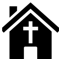
St Andrew's Church