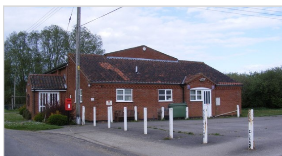
Village Hall in Ilketshall St Andrew