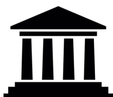
St Andrew's Village Hall Community Facility