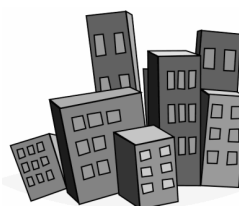
Becks Green Business Centre Economy