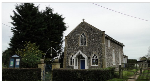
Methodist Chapel in Ilketshall St Andrew