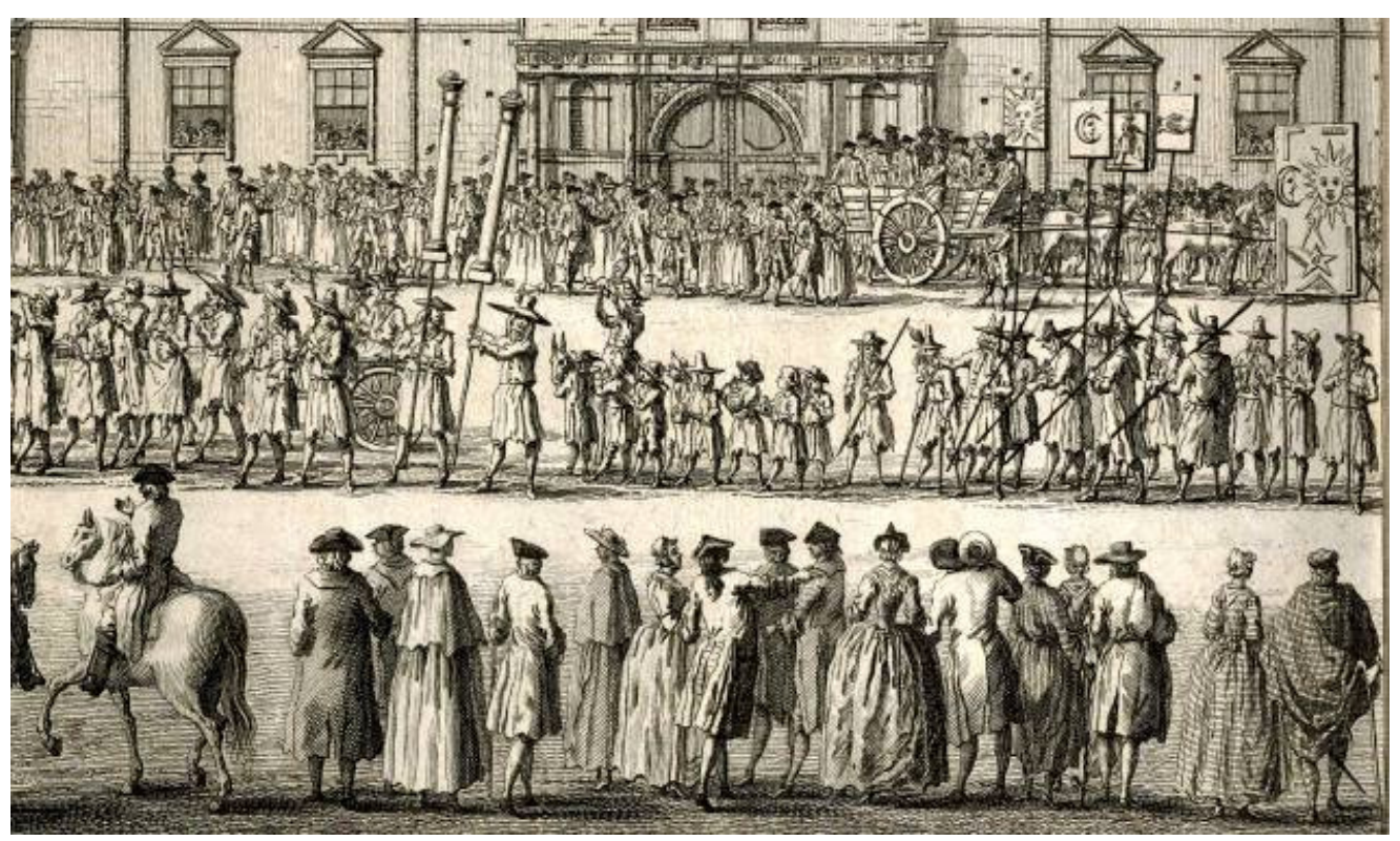
Here we see a procession of the "Scald Miserable Masons" in London in 1741, actually organised to mock and ridicule real Freemasons but nevertheless carrying banners marked with Masonic symbols.

Other organisations have used banners to proclaim their identity. Trade Unions have used banners since at least the 1840s, carried in processions and May Day parades. Political organisations, temperance movements and the City Guilds have all used them. Today ad hoc banners are often carried in demonstrations.