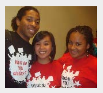
Alumni in Action

Connect with YP4 and watch videos, see pictures, and more! We're on Twitter, Facebook, YouTube, you name it.