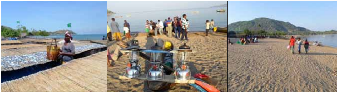
Figure 3.9: A photo showing a small catch derived from dug-out fishing canoes, also showing Women in Fish Business

Thus, in the past fishing was very beneficial not only to people who had capital to invest in it, that is, owners of the fishing gear, but also to the poor, the vulnerable and those who were single (divorced) women. Today, things have changed completely. Fishing is a very difficult business. The catch is very poor. The tradition of kuvambalila is rarely practiced and even people with money find it difficult to buy fish. In addition, shortage of fish has made it extremely expensive thus, making fish out of the reach of most poor households. Reasons for current poor catch and performance of the fishing industry in Lake Nyasa include the collapse of shallow water fishing, the government ban of beach seine ( kokolo ), over-fishing and lack of modern fishing equipment.