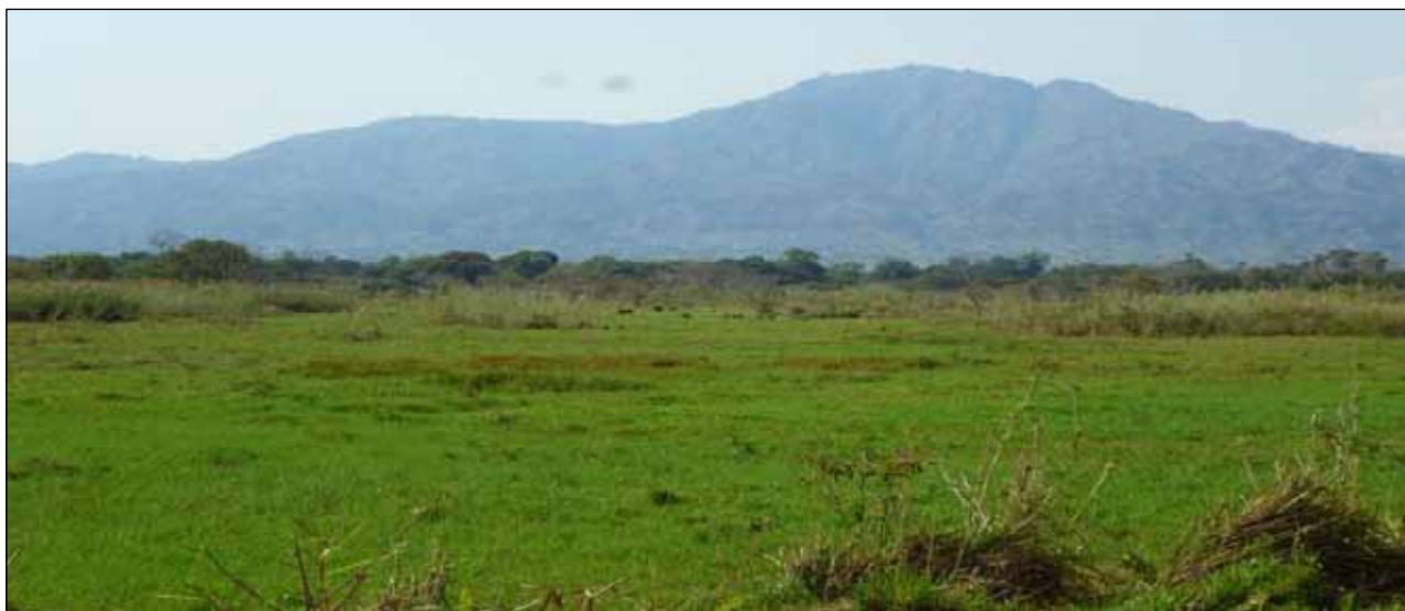
Figure 3.14: The Lowland Belt (Stretch) in Nyasa District to the West of Mountain Livingstone

Looking at the geographical coverage and Nyasa District population growth rate, one notices that very soon the district will face a serious land shortage. This problem has started already where people and settlements in many villages of Ruhuhu and Ruhekei divisions such as Lundo, Ngindo, Mbaha, Lundu, Liweta, Mkali, Liuli, Puulu, Tumbi, Mango, Kihagara, Tawi, Nindahi and Lituhi are crowded and the population densities have more than doubled in the past 15 years. About 80 percent of the communities along Lake Nyasa therefore lie in the lowland belt between the eastern side of Lake Nyasa and the western side of Livingstone Mountains, making a narrow parallel lowland belt or stretch of about 0.2 to 15 km (See Figure 1.1 – A Map of Nyasa District Council). This is a very narrow stretch which with exception of Mpepo Division, has forced many people from the lake shore to expand to the neck of Livingstone Mountains (protected areas). Likewise, since in Matengo area of Mbinga District population has also been growing necessitating people to move towards the Lake shore and occupy land in Nyasa District.