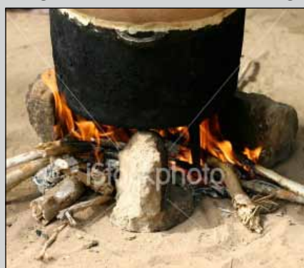
Figure 3.8: Food Processing

Nevertheless, although men and women do collaborate, there are men and women's crops. Both men and women cultivate cassava, which is the most important food crop. Men, both as adults and youth, are primarily responsible for cross border trade, transportation, lumbering, and masonry. Making of local brew are traditionally women's activities.