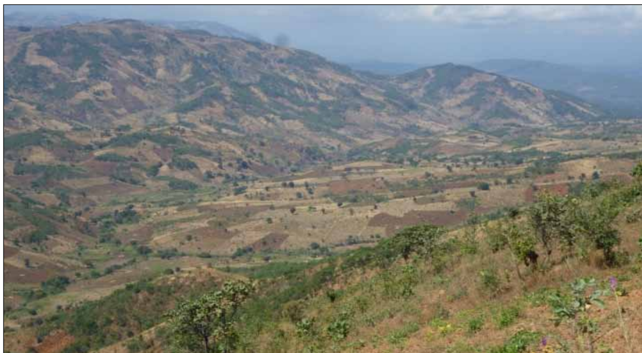
Figure 3.6: Bare mountainous land and disruption of water sources due to deforestation and encroachment of agriculture

About 80 percent of the communities along Lake Nyasa lie in the lowland belt between the eastern side of Lake Nyasa and the western side of Livingstone Mountains, making a parallel lowland belt stretch of about 0.2 to 15 km width covering an attitude of approximately 475 to 700 m above sea level with