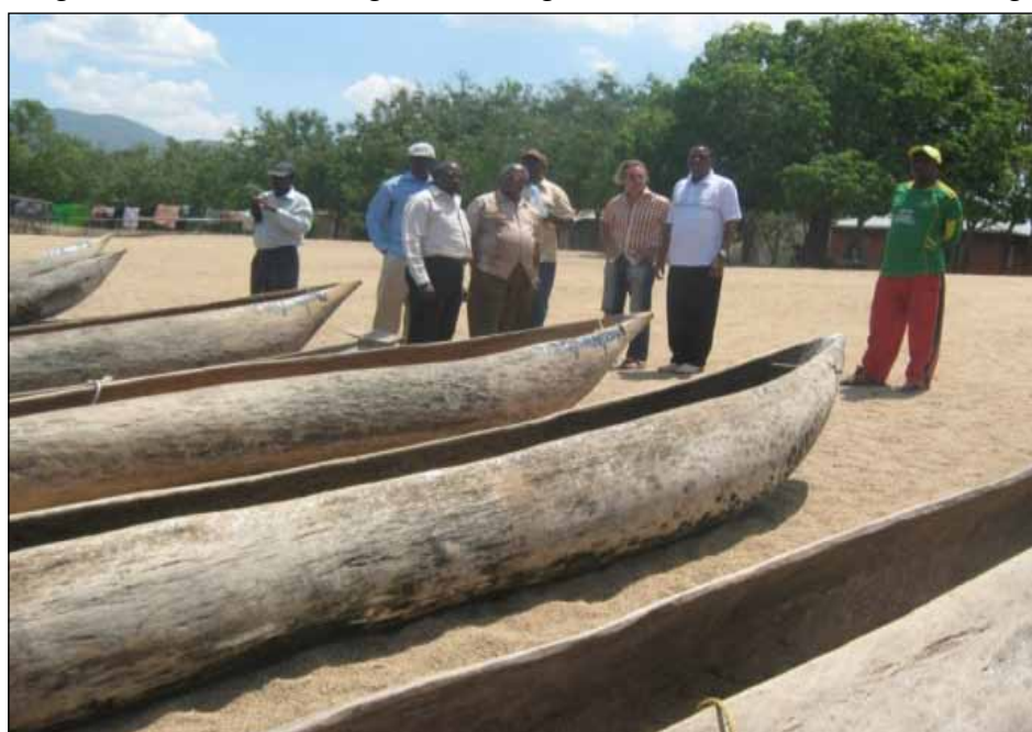
Figure 1.2: Front - Fishing Gears - dug-out canoes used for local fishing

Nyasa district is endowed with 297,900 ha of Lake Nyasa waters with about 165,000 tonnes of over 500 different fish species including copadichromis spp ( ntaka/mbalule ); diplotaxodon spp ( vitwi ); ramphochromis spp ( hangu ), bathyclarias ( kambale ) synodontis njassae ( ngolokolo ), engraulicypris sardella ( usipa/dagaa ), opsaridium-microlepis ( mbasa ), labeo ( ningu ), bagrus ( mbufu ).