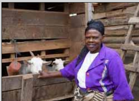
Figure 3.7: Livestock keeping for income generation

Agricultural activities are therefore performed by men, women, and youth, though men generally are more active in the production of cash crops while women focus more on food crops such as vegetables.