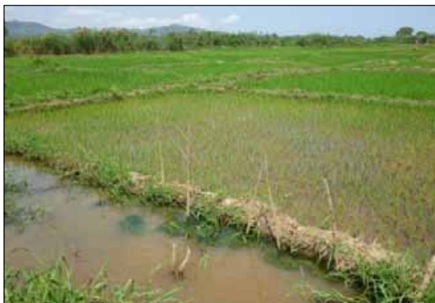
Figure 3.1: Irrigation Scheme at Lundo Village