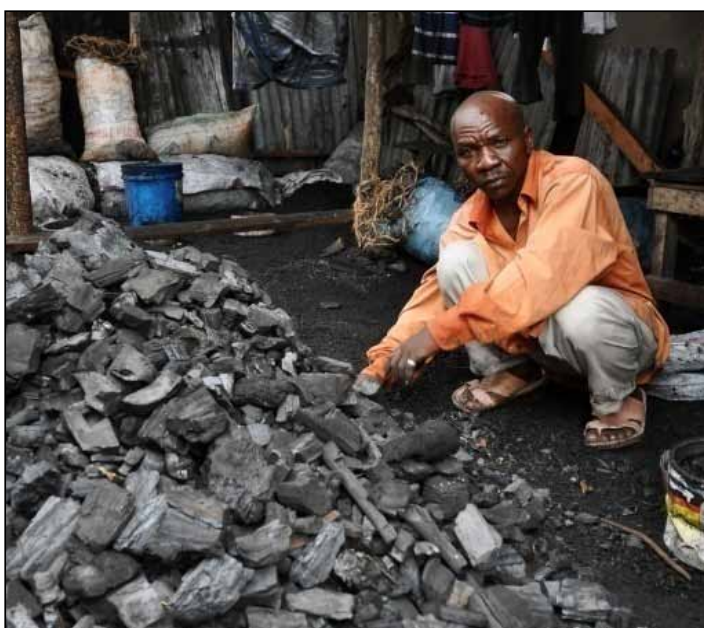
Figure 3.11: Charcoal Trader at Mbamba-bay Township

Very small size sardines and fish have continued to be harvested without taking any precautions and serious interventions to discourage and stop such unsustainable fishing practices. Likewise, many species are caught during rainy season on their way towards the deltas of rivers for breeding. This is the time when rivers are full of rain brown waters. This type of fishing has been practiced for many years and has also led to reduction of fish population in Lake Nyasa.