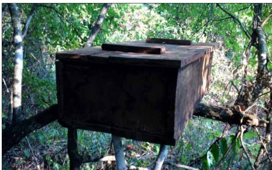
Figure 3.5: A Beehive owned by members Jitegemee Group

Farming has been extended to river banks and valuable water resource areas, thus causing heavy soil erosion.