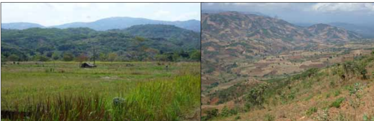
Figure 3.13: Loss of Forest cover along Livingstone Mountains

It is reported that, some government actions were taken in 2003 to investigate the problem, call for the meeting of members of both sides and the decision was made. However, to date nothing has been implemented. There is therefore a serious problem of not only enforcement but also implementation and monitoring of the decisions made by the authorities. This is a gap which needs to be addressed if Nyasa District is to attain its plans and objectives of environmental conservation and mitigation of the impacts of climate change. Forest conservation projects such as tree nurseries, seedling distribution and tree planting are therefore inevitable.