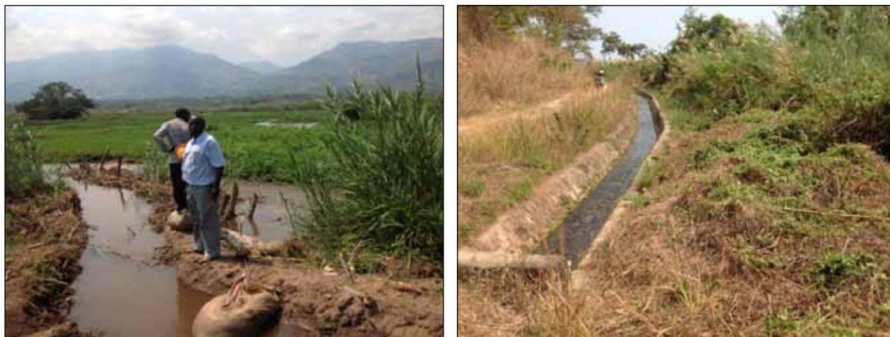
Figure 3.3: Traditional Irrigation Scheme at Lundo Village and the Main Canal at Mkali Village

Another potential irrigation area is Mkalachi irrigation scheme. This scheme also started in 2006 as a farmers' group and has 96 members, 40 of them women, who are engaged in cultivation. A total of 200 households are benefiting from the scheme. Part of the main canal was constructed in 2009. However, construction was not complete as part of the main canal, tertiary and division boxes has not been constructed. This scheme is poorly managed because very little efforts are made by the beneficiaries to clean the canals. Intensive training, sensitization and construction of the main canal, tertiary, division boxes and headwork ( Banio ) are therefore required.