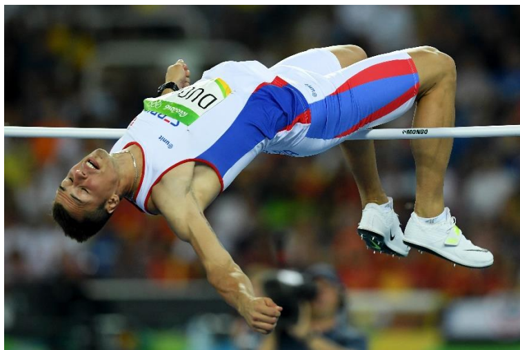
Mihail Dudaš won the silver medal at European Athletics Indoor Championships in 2013.