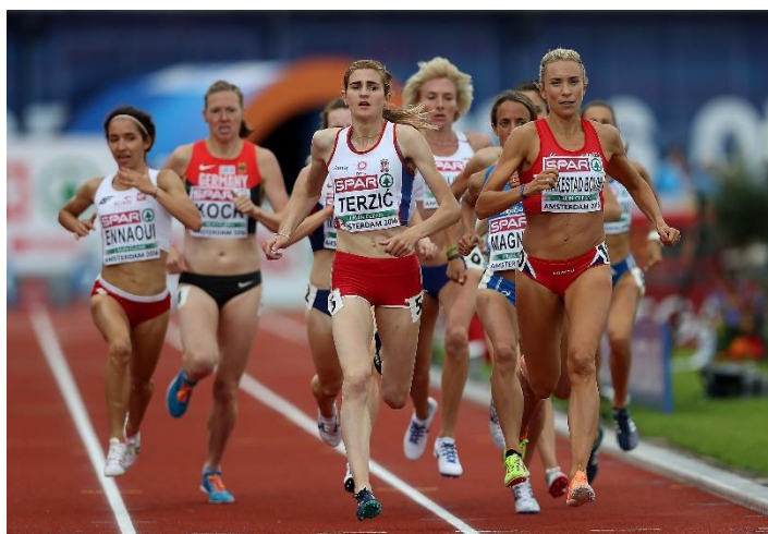
Amela Terzić owns Serbian indoor records for 800 and 3000 metres.