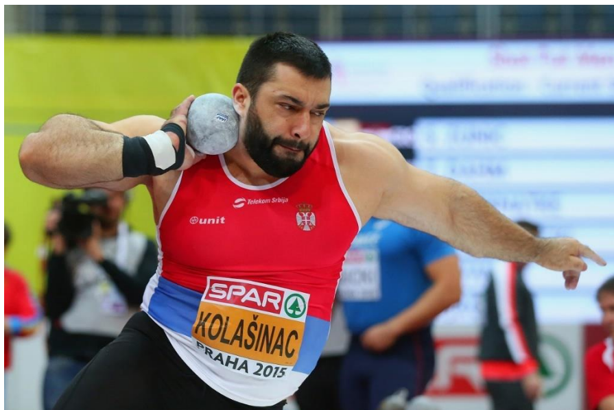
Asmir Kolašinac is the 2015 European Athletics Indoor Championships silver medallist.