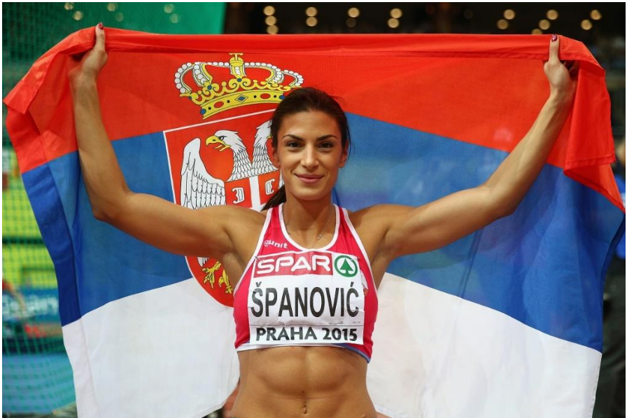
Ivana Španović is the reigning European indoor champion in long jump from Prague 2015.