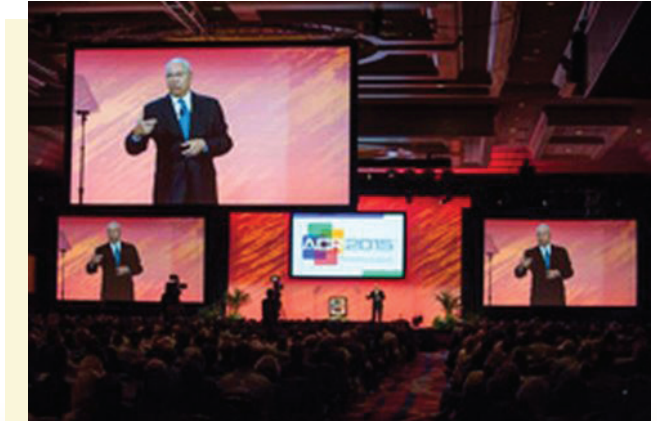
General Colin L. Powell, USA (Ret.) giving the opening keynote speech entitled, “Leadership: Taking Charge.”