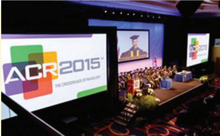
ACR 2015 Convocation