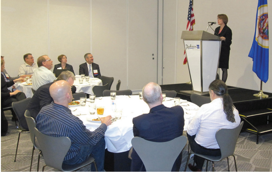
United States Senator Amy Klobuchar speaking to the MRS Executive Committee