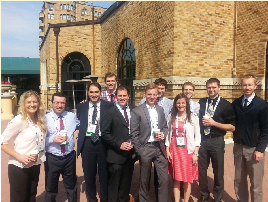
University of Minnesota first year radiology residents at ACR 2015