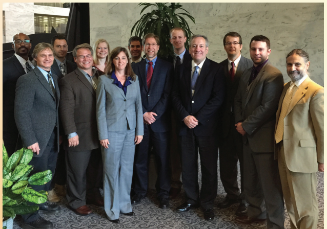
MRS Group at Capitol Hill Day