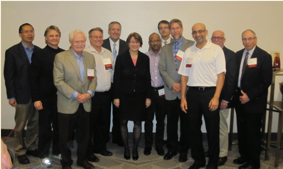
MRS Members with US Senator Amy Klobuchar