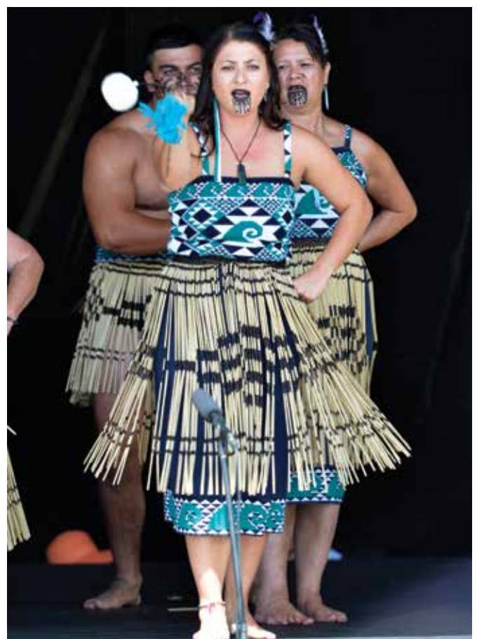
Above, from top: Beat Retreat and Ceremonial Sunset, Treaty Grounds, 5 February; The Navy Kapa Haka group perform on the main stage at the Treaty Grounds

Next day, Thursday 5 February, ROTOITI held an open day at the wharf at Opuia. At 11am a rehearsal for the Beat Retreat ceremony was held on the Treaty Grounds. The full Beat Retreat