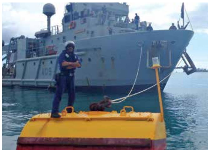
Top: MANAWANUI Secured to Browns Island Buoy

Overall MANAWANUI has had a productive start to 2015. Ship's Company continue to engage in their roles and responsibilities with a high level of enthusiasm, and are very much looking forward to what the rest of 2015 has to offer. ■