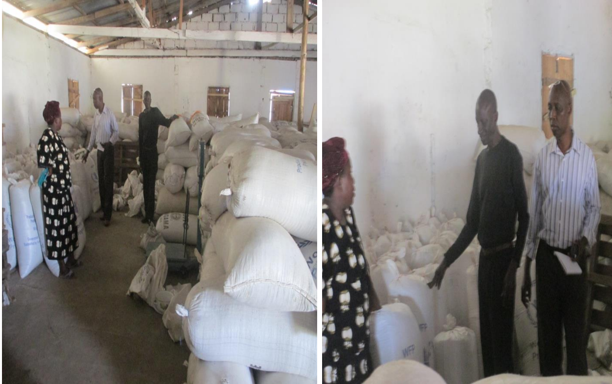
VODWOPEDÉ Rice Warehouse in Voinjama. Director of CSIO Visit warehouse of VODWOPEDÉ in Voinjama.

MoA - Ministry of Agriculture is to start buying paddy rice by next month January 2014. The purchase will be done at every farmer’s selling point. Transportation of paddy rice will be done by the Ministry.