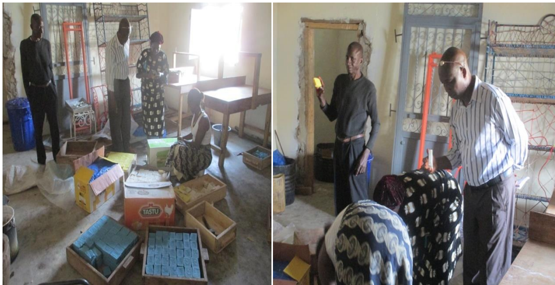
Some Activities of VODWOPED (Soap making).