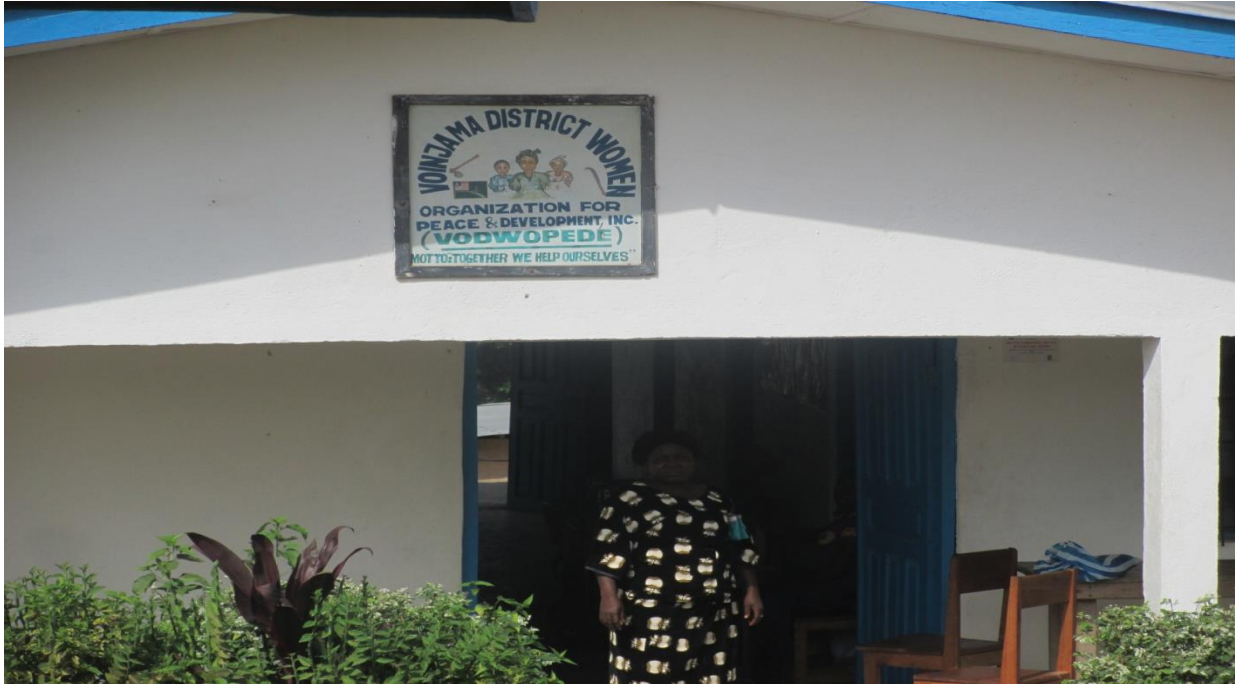
VODWOPEDE Head Office in Voinjama, Lofa County