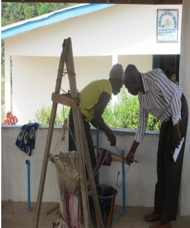
The weaving center of VODWOPED