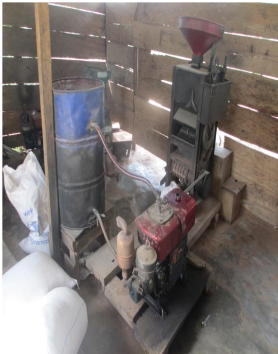
Soap making & Rice milling process ongoing at the VODWOPEDÉ processing site.