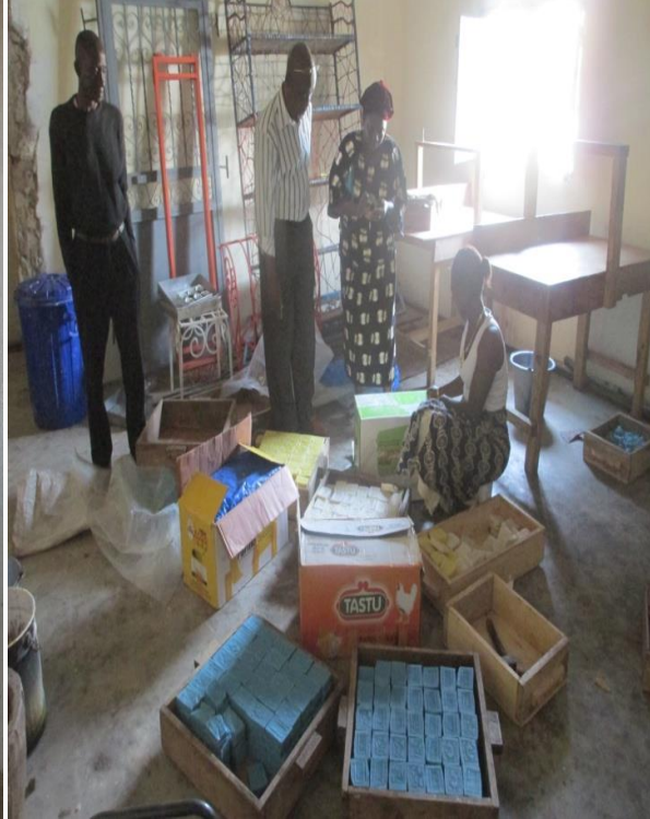
Soap Making Center of VODWOPED

This organization ( VODWOPED ) is implementing for USAID, WFP, ORT, IRC and Plan Liberia USAID and ORT - Donated the canal crushing machine and are involved in contracting Training Packages for (VODWOPED) Who carried out training for young people across the county,