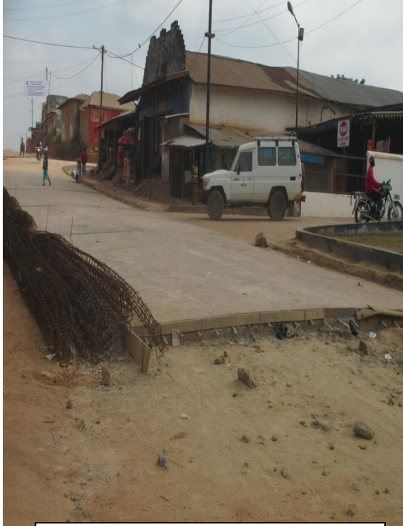
Main road leading to Monrovia Parking