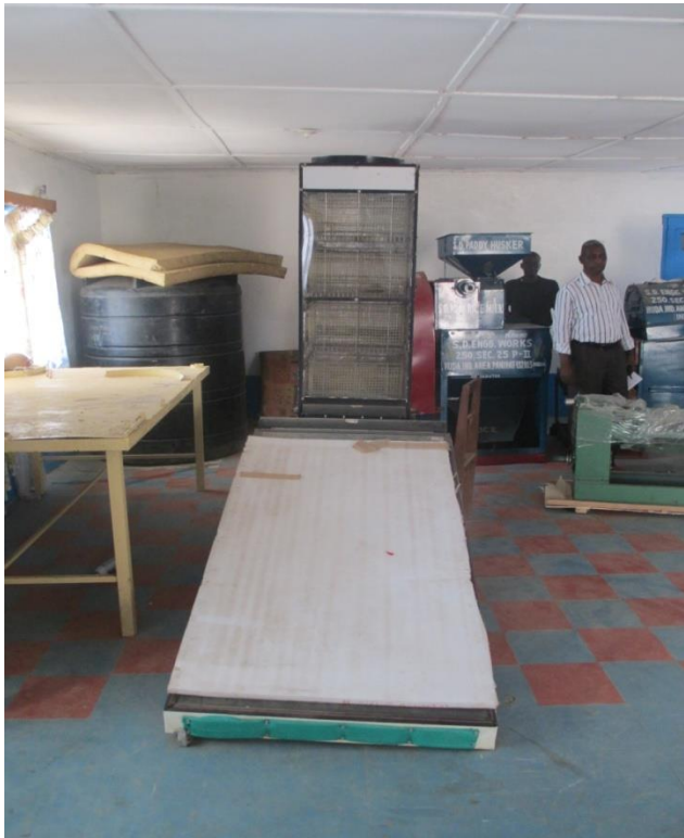
Equipment Donated to VODWOPEDE by Donors