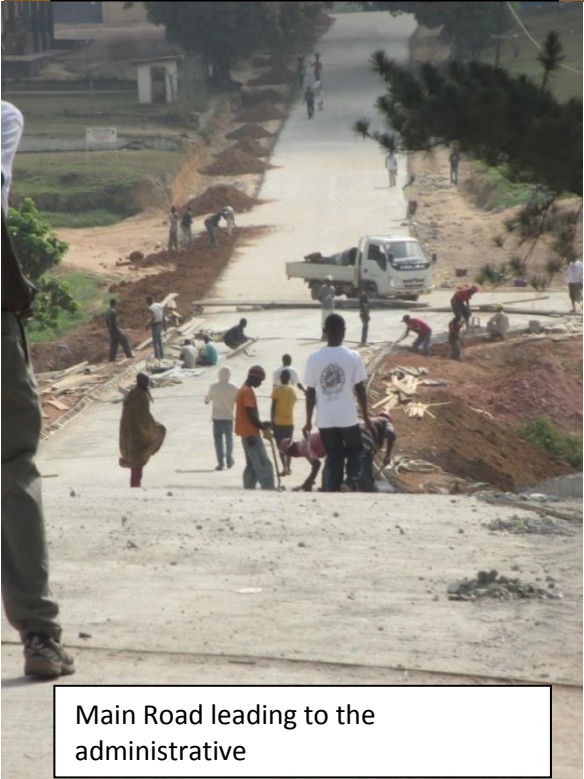
Main Road leading to the administrative

The Photos above shows the Pavement work ongoing of Voinjama city major streets.