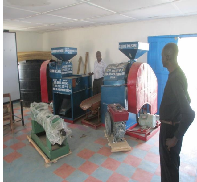
Equipment donated to VODWOPED by USAID