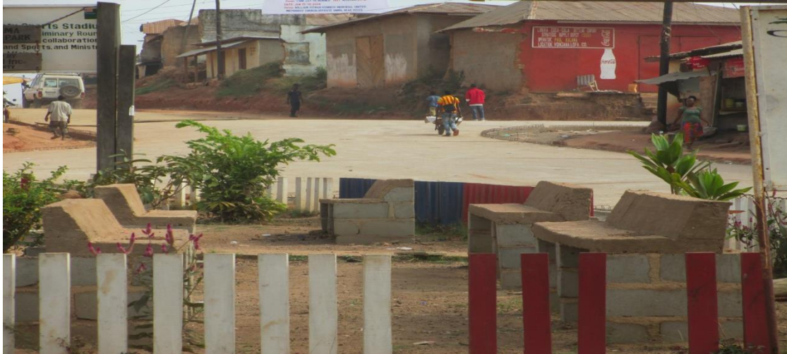
Pavement of Voinjama City major streets.