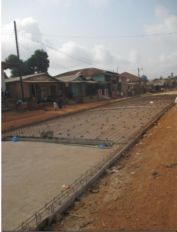
Main Road leading to Mandingo Quarter