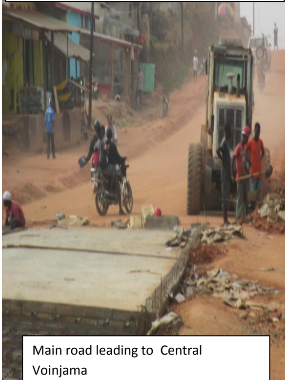
Main road leading to Central Voinjama