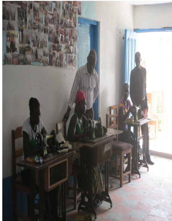
The Tailoring Training Center