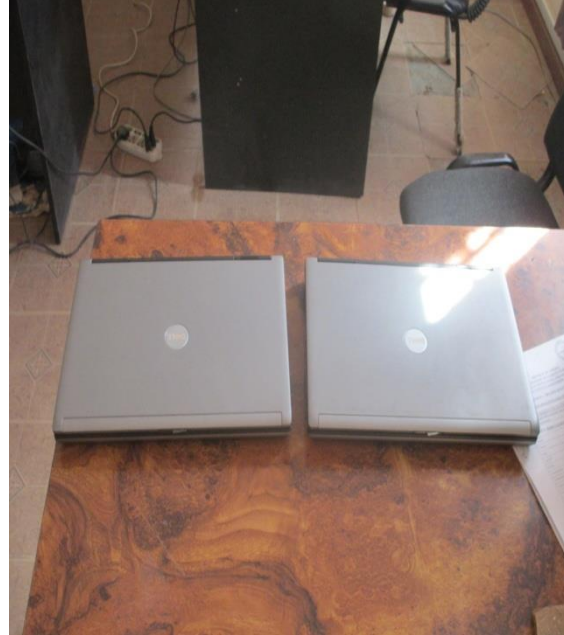
Laptops Donated by SDC to CSIO