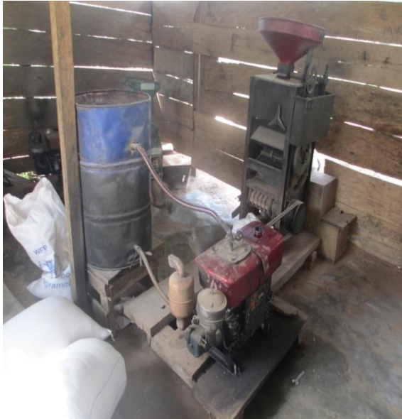
Rice Milling Center