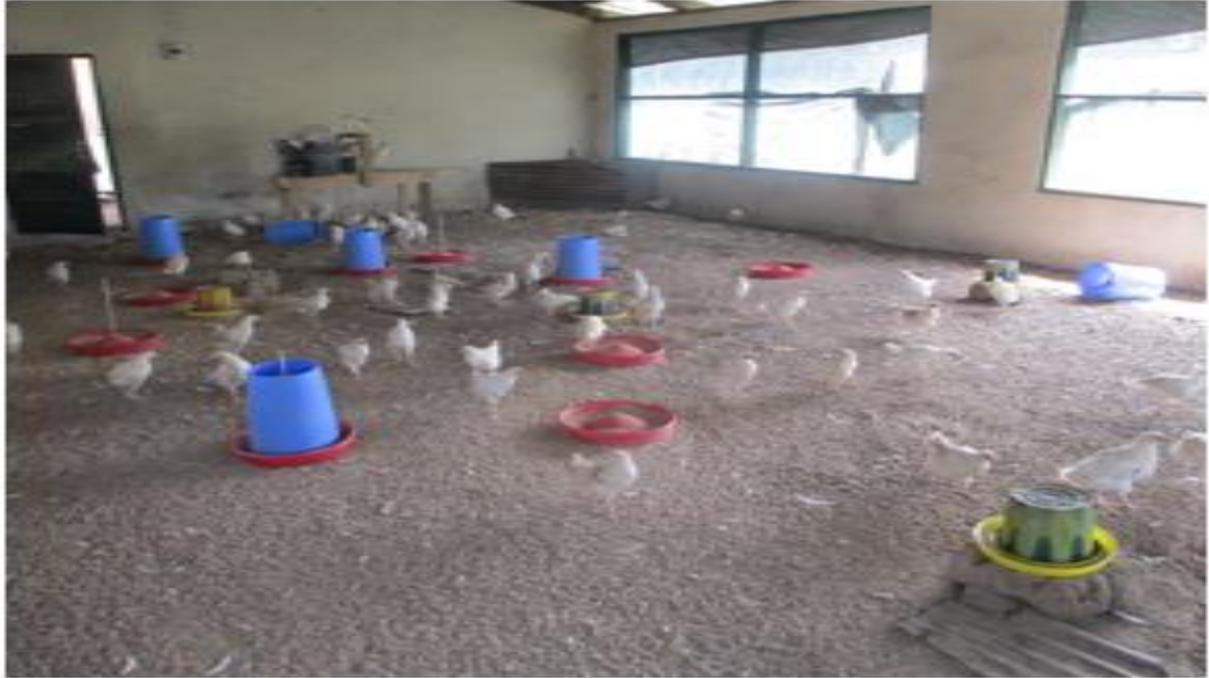
VODWOPEDE poultry Site in Voinjama City.