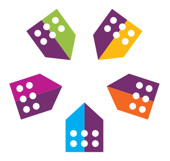
The co-ops transfer ownership of part of their property to the cluster.