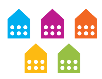
They find a few other housing co-ops that want to work together.

A group of people get together, form a housing co-operative, and buy a house.