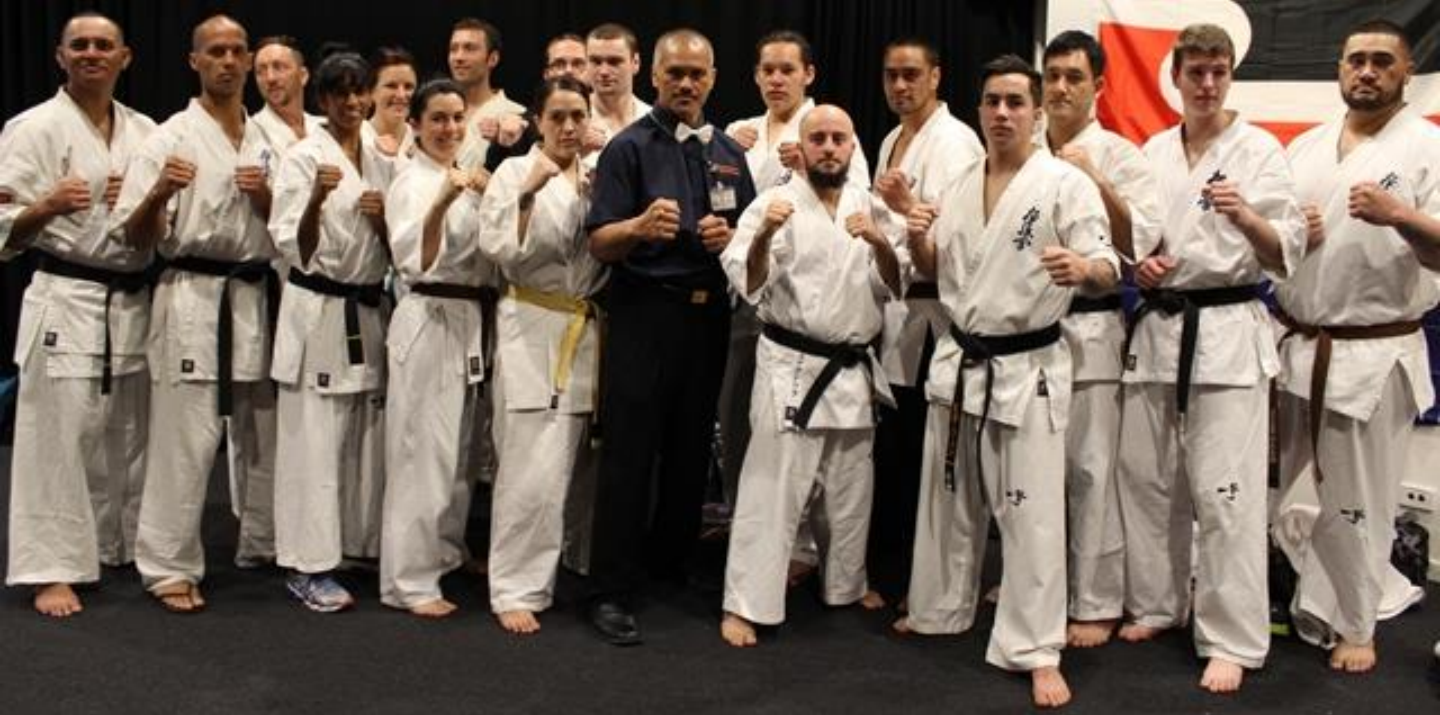
Above: All the Kiwis out the back getting ready before the battle begins