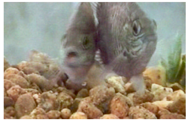
Figure 11. Courtship behaviour.