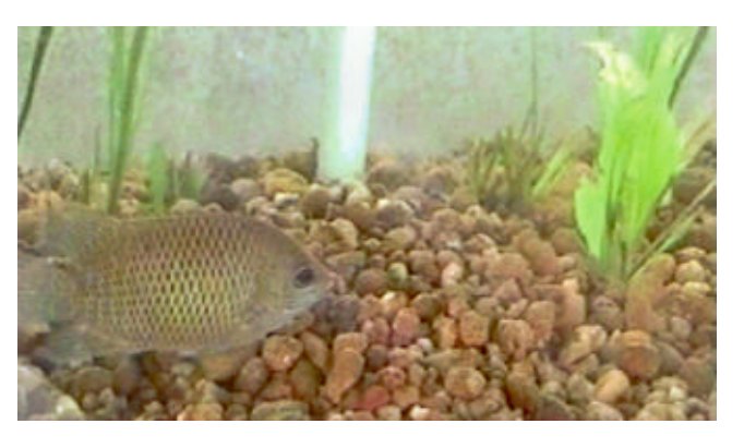
Figure 2. Male Pristolepis selecting a site in the tank.

CURRENT SCIENCE, VOL. 84, NO. 11, 10 JUNE 2003