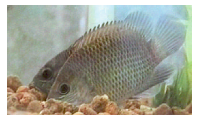
Figure 10. Male and female breeding together in the constructed nest.