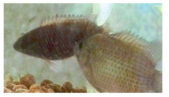
Figure 7. Male chasing the female. CURRENT SCIENCE, VOL. 84, NO. 11, 10 JUNE 2003