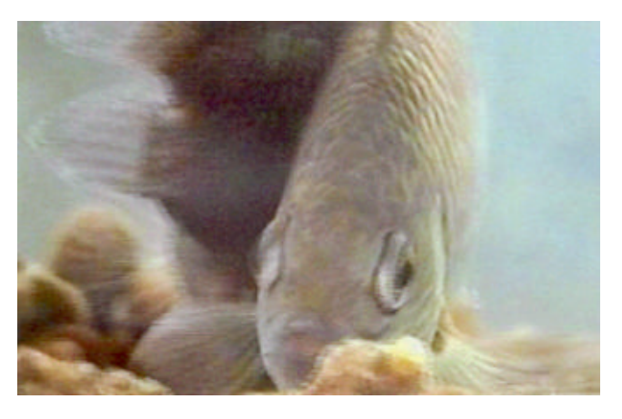
Figure 12. Breeding behaviour.

Physical parameters like water quality, flow rate, nature of substratum, and rain, have great importance in the spawning of the fish<sup>15</sup>. As a tropical fish, the common catopra was little influenced by slight changes in temperature since the fish was found to breed throughout the year. However, the nature of substrata is of great importance in the captive breeding of the fish. The fishes that