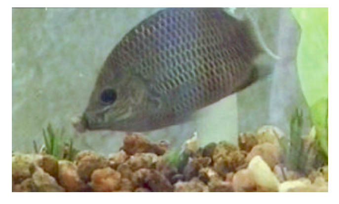
Figure 4. Male Pristolepis picking pebble.

The observations made on the breeding behaviour of Pristolepis marginata indicated that it exhibited parental care and the male took care of the eggs and young ones till they became free-swimming. The phenomenon of male