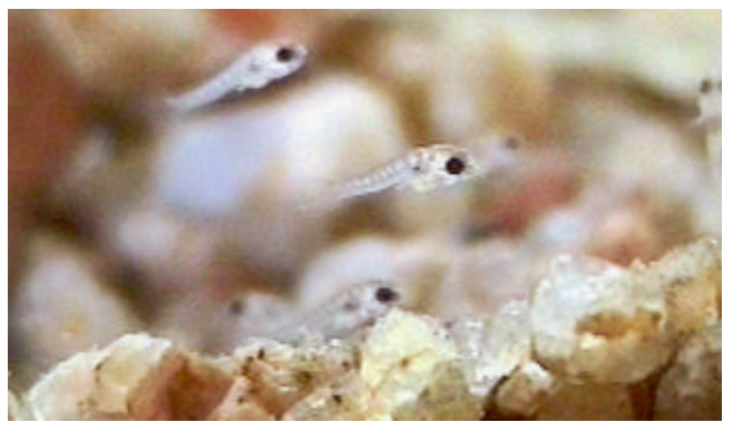
Figure 15. Hatched out larva when they became free-swimming. CURRENT SCIENCE, VOL. 84, NO. 11, 10 JUNE 2003