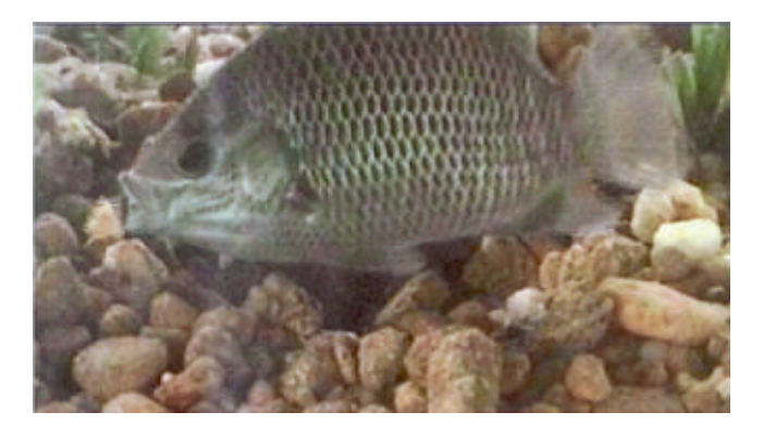
Figure 5. Pristolepis spitting out unwanted pebbles from the pit.