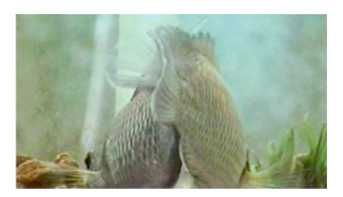
Figure 9. Male and female together in the breeding site. CURRENT SCIENCE, VOL. 84, NO. 11, 10 JUNE 2003