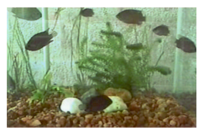
Figure 1. Pristolepis marginata in captive conditions.

After 1–2 days of pre-spawning activities, the female was invited to the nest. Male and female stood sidewise to each other. Male slightly beat and pushed the female