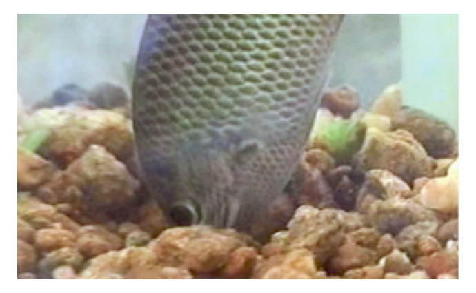
Figure 6. Arranging pebbles in the pit.