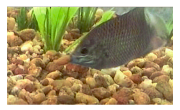
Figure 3. Male Pristolepis collecting pebbles from the bottom.

with its caudal region (Figure 9). The courtship rituals also included the sidewise lying inside the pit, along with shivering of the fins and body. They both slowly circled inside the pit, and keeping the same position, vigorously shook the body and fins (Figures 10–12). They inclined slightly to one side, keeping the anal regions close to each other, the female with a more enlarged genital papilla released a few eggs and the milt from the male simultaneously fertilized the eggs (Figures 13, 14). Release of the eggs could be observed at times but release of the milt could not be observed. Soon after this, the female