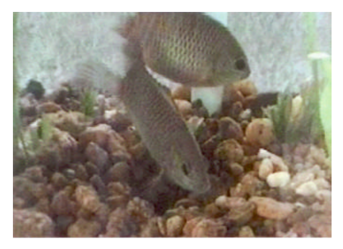
Figure 8. Female occasionally visits the site for breeding.

Pristolepis marginata exhibited strong territorial behaviour during breeding time. According to Keenleyside<sup>7</sup> territoriality stabilizes the evolutionarily stable strategy of parental care. In 1972, the importance of territoriality in the evolution of parental investment was pointed out by Trivers<sup>5</sup>. The present study indicated that as the male remained with the eggs until the hatchlings became freeswimming, territoriality is to improve the probability of an individual offspring's survival to ensure reproductive success. This has also been suggested by Perrone et al.<sup>8</sup>. The presence of a ripe female apparently induces the male brooder to intensify its nest building and prespawning activities. This may be due to the influence of the pheromones the females possess. According to Chen and Martinich<sup>9</sup>, the presence of the opposite sex has a potential role in the reproductive activities. Spawning occurred when a sexually mature female entered the male's territory and the two fish circled slowly in the nest with the male on the outside. The female periodically tilted sideways about 90° with her vent near that of the male and released eggs, which he fertilized. These eggs were