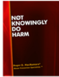
Not Knowingly Do Harm $29.00