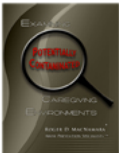
Examining Potentially Contaminated Caregiving Environments $35.00