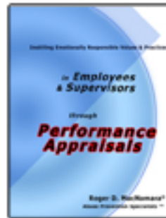
Instilling Emotionally Responsible Caregiving Values in Employees & Supervisors through Performance Appraisals $30.00