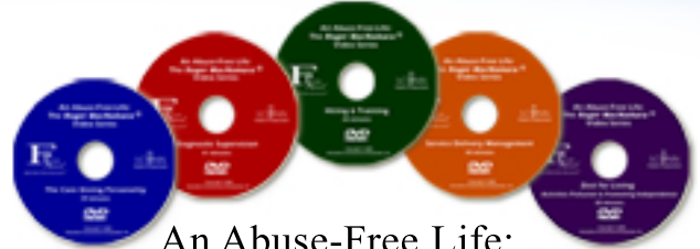
An Abuse-Free Life: The Roger MacNamara® Video Series ($895.00 per set) (CALL TO ORDER)