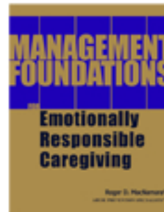
Management Foundations for Emotionally Responsible Caregiving $10.00