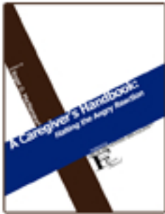
A Caregiver's Handbook: Halting the Angry Reaction $50.00