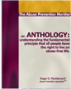
The Abuse Prevention Monitor®: The Anthology $60.00