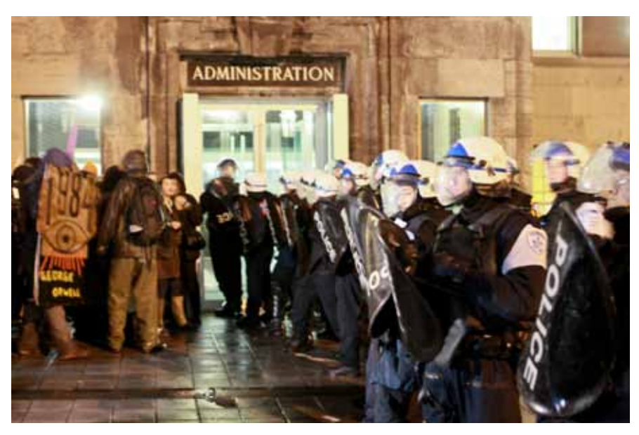
Riot police confront protesters outside the occupied administration building on November 10, 2011.

by other labour organizations over the coming years for their effectiveness not