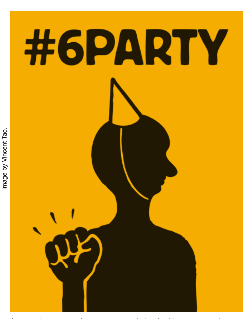
A poster that appeared across campus during the #6party occupation.

results of two referendum votes on the existence of the Quebec Public Interest Research Group (QPIRG) and Radio CKUT - both of which votes administrators had nullified the previous month – and that the Deputy Provost resign.<sup>18</sup> As on November 10, the planned #6party occupation prompted a spontaneous occupation of a lower level of the building: upon hearing that students were on the sixth floor, a group of students, myself included, entered the building's lobby around 11:30am, but were blocked from staircases and elevators by security. Over the course of the evening, sixty to one hundred students and professors came and went freely in the lobby, teaching courses, holding informal discussions, and serving food, even after an eviction notice was served at 3:30pm. Around 8:45pm, a member of McGill's Security Services announced to those occupying the lobby that they were free to leave, but would no longer be allowed to reenter. 19 Roughly twenty students spent the night sleeping on the lobby floor. forced to use bottles and eventually a cooler as toilets in the absence of accessible lobby-level washrooms. At 11:30 next morning, the remaining students chose to leave the lobby of their own accord en masse, and were greeted by a support rally and reporters. The sixthfloor occupation, meanwhile,