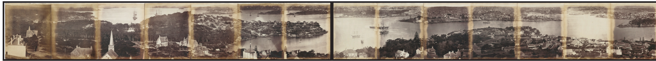
Charles BAYLISS Panorama of Sydney Harbour and suburbs from the north shore 1875 (detail, 14 panels) Sydney, New South Wales, Australia albumen silver photographs (23 panel panorama) commissioned by Bernardt O. Holtermann