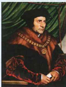
St. Thomas More, patron of lawyers

Phone: 973-377-1004 insidethewalls.org E-mail: awright@patersondiocese.org