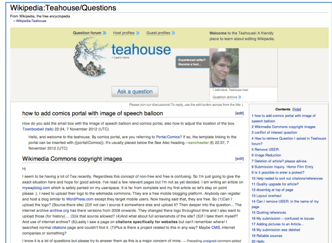
Figure 3b: The Teahouse Q&A board.

As SubSubPop23’s story illustrates, the new editor experience of Wikipedia can be an unsettling combination of anonymous and hostile. This, too, has increased over time. The proportion of new editors whose first interaction with Wikipedia is via a generic message left by an automated script or tool has increased to over 80%, from less than 40% in 2006. The proportion of first contact messages that are warnings rather than welcomes was 65% in 2010 and has increased year by year [13].