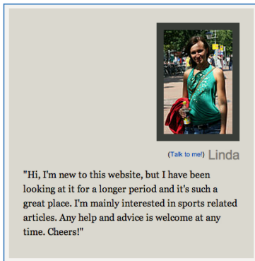
Figure 3a: Host (top) and Guest (bottom) profiles.

cles for Creation committee received a different invitation than newcomers who were identified as candidates for invitation on the daily invitee report (Figure 2).