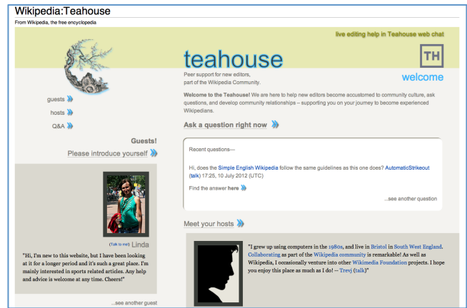
Figure 1: The Wikipedia Teahouse main page

The gender gap has had a quantifiable impact on the quality and coverage of the encyclopedia: articles on topics of interest to female editors received less coverage than those of interest to male editors, and articles within those topic areas were shorter on average [19]. The persistent gender gap represents a significant missed opportunity for increasing the pool of dedicated Wikipedians.