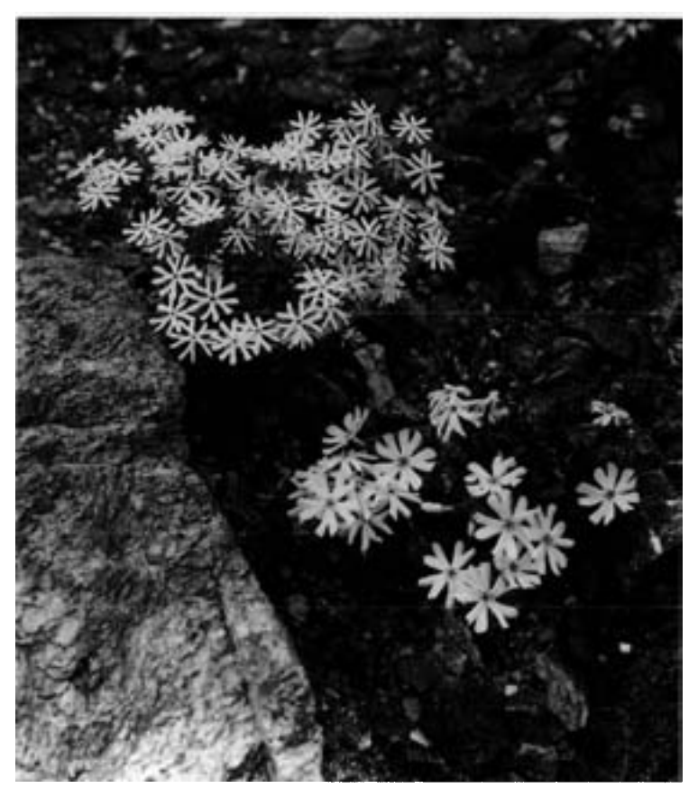
Phlox x henryae, a cross of P. nivalis and P. bifida, originated at Gladwyne, "a chance seedling in my trial garden." P x henryae, a pale pink with deeply notched lobes, is in the foreground with P. bifida in the rear.

than ever aware of the tremendous potentialities of the native American flora for supplying plants worthy of cultivation."