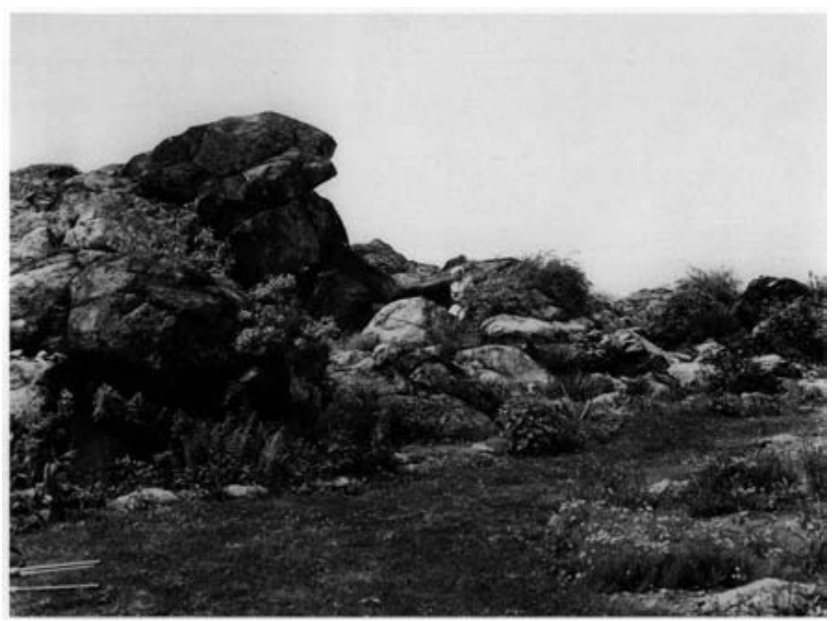
"As for my rock garden, the largest of the existing pile of rocks were too big to move and all I did was to rearrange the smaller ones and to make paths and steps that are scarcely distinguishable. Soils were changed into suitable mixtures" (1943) Mrs. Henry gives scale.

possible to its original growing conditions; the change in latitude often resulted in plants remaining desirably small and compact.