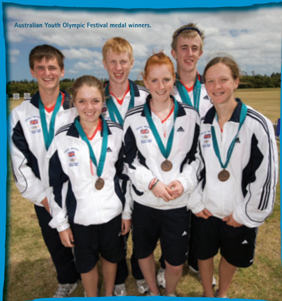
Australian Youth Olympic Festival medal winners.