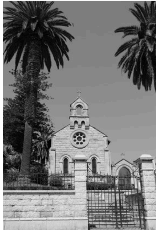
Protestant church in Hafsiya, Tunis, 2011. Courtesy of the artist.