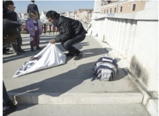
Study for Flying Carpets, 2011, Venice.

NK: Yes and no. Yes, because I am an immigrant myself, in Europe, coming from Africa; no, because I am fortunate enough not to have legal problems with my documents. But in general, and this is one of my convictions, I think that one should have the right to be able to move freely all over the world. If we think back to the origins of humanity, and how we evolved as a human species, there were Neanderthals, Homo sapiens and other species and the Homo sapiens survived. We know from the theories of Darwin and others that we survived because we were able to adapt and move from one place to another when the environment was too harsh. The official theory is that humans, Homo sapiens, came from Africa and that as they ventured and travelled, they settled in different regions, and that is how we also became physically different because we adapted to different conditions but we are all Homo sapiens. So this process of moving from one place to another continued, it's in all history, during antiquity and then in the Middle Ages, there were never