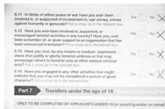
Study for No, 2011.