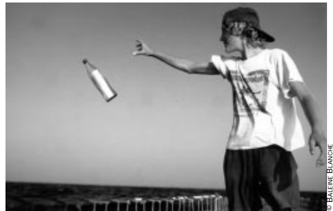
Offering a message of hope

Apart from revealing the reality of the Slave Route, the experience also led the adolescents to reflect on