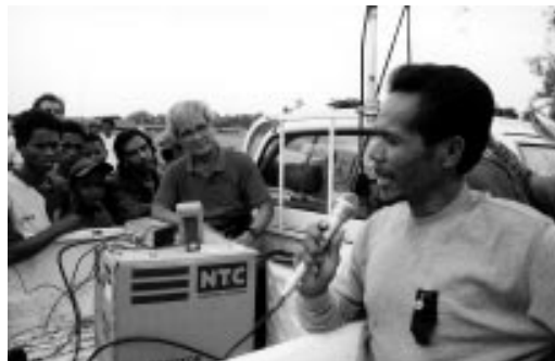
A microphone, tape recorder 20 watt FM transmitter and antenna were all it took to get people on the air in the village of Lospalos (East Timor)

UNESCO and the British-based ngo Article 19 (a reference to Article 19 in the Universal Declaration of Human