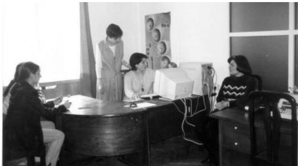
"We couldn't wait for the government or some kind "uncle" to do something"

The Armenian Information Technology Community Center (AITCC) is a project of the Youth Initiatives Supporting Center (YISC), one of the departments of the Armenian Federation of