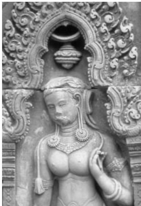
One of Angkor's Apsaras, intact

Putting an end to the looting is one thing. Finding and retrieving the stolen objects is another //