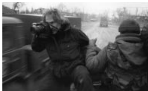
Grozny, Chechnya, February 2000