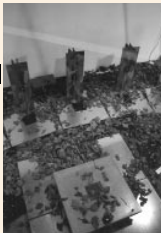
Pulsar , a work by Gustavo Nieto

workshops to encourage people to read. The Books for All programme will soon be extended to Africa and Asia.