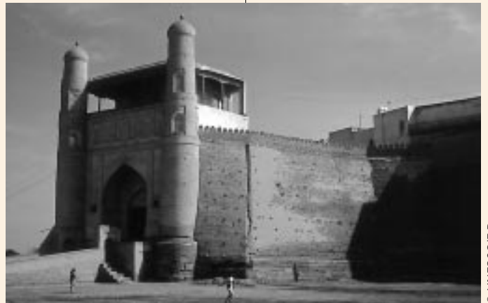
The citadel - Bukhara (Uzbekistan)

tion was started in 1946, when UNESCO was founded and contains more than 10,000 digitised images. More will become available as the rest of the collection is digitised. This service will soon be developed to allow professionals and other users to obtain reproduction rights online. At the moment the photobank is available for consultation and acquisition.