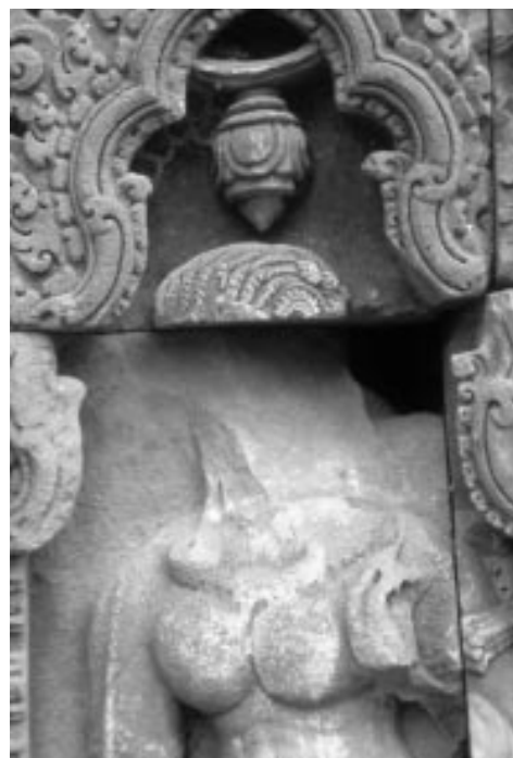
Her lookalike, decapitated by looters