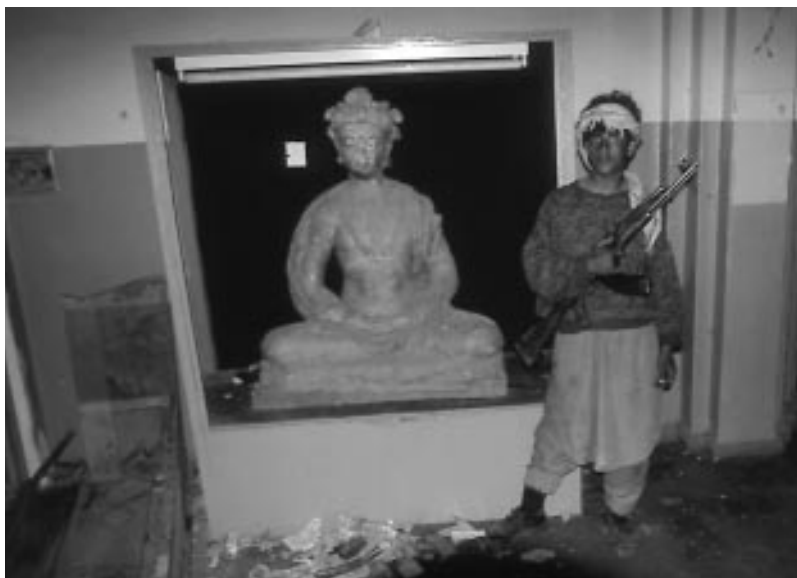
A mujaheddin on guard duty in the ruins of the Kabul museum in 1995

The Buddhist monastic complex of Hadda has been entirely denuded of its statues and sculptures by both war damage and theft; and at Ay Khanoum, the site of the easternmost Alexandrian city ever discovered, bulldozers and tunnels have been used to pillage the site. At Balkh, once a trans-continental caravanserai and one of the oldest conti-