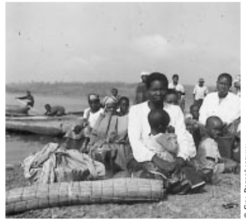
ARFEM has helped put the plight of Rwanda's women on the political agenda

When these programmes started, we were faced with considerable opposition. People at the radio said: "ARFEM has taken over the radio. These women are making too much noise." They considered we were merely agitators. But now people are beginning to understand better. When it comes to rape, everyone knows a little girl or a young sister who has been a victim. Now everybody knows the signature tune of our programme. A year ago, TVR, Rwanda's only television channel, started a weekly programme for women. The weekly magazine Imvaho also publishes a women's page and