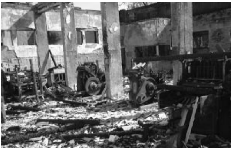
The burnt out presses of the Suara Timor Timur newspaper, Dili