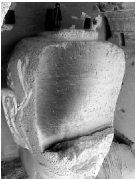
At Bamiyan, the world's biggest buddha (54 metres) has also been claimed by the conflict