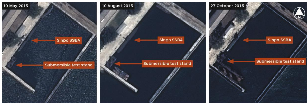
Airbus Defence and Space Imagery shows the secured boat basin at Sinpo South Shipyard. Between May and August 2015 the Sinpo SSBA relocated, indicating activity. Additionally, the submersible test stand relocated between August and October 2015, suggesting test activity occurred.