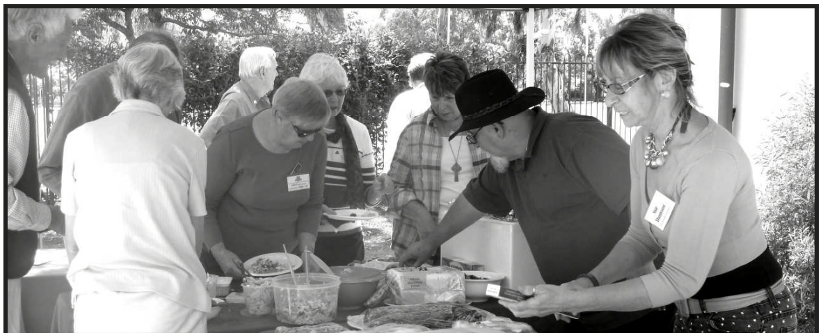
Lunch is Served!