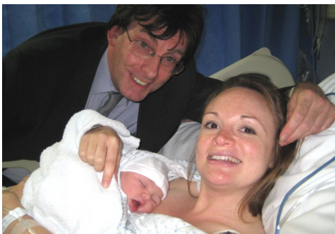
The mother has a balanced translocation, inherited from her father (behind). After two miscarriages and two pregnancies terminated

Some people wonder if having a balanced translocation makes other genetic disorders more likely in their children. There is no evidence at all of this.