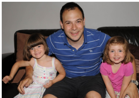
The father has a balanced translocation. This family had three miscarriages before having two daughters: one with the balanced translocation (left) and one with ordinary chromosomes (right).

“ There is a balanced translocation in all generations of my family which doesn't have health implications for any of us.