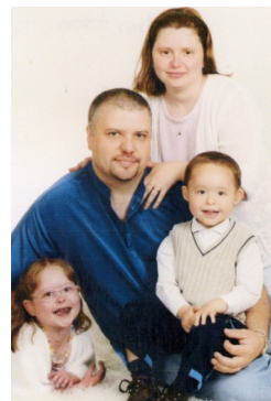
The mother has a balanced translocation. Both children were born with unbalanced chromosomes

Out of three pregnancies, we have had a miscarriage of a baby with an unbalanced translocation, a child with a balanced translocation and a child with an unbalanced translocation who has special needs.