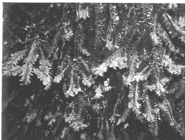
Fig. 7. Plagiochila arbuscula , 13 June 2013, Mike Wilcox.