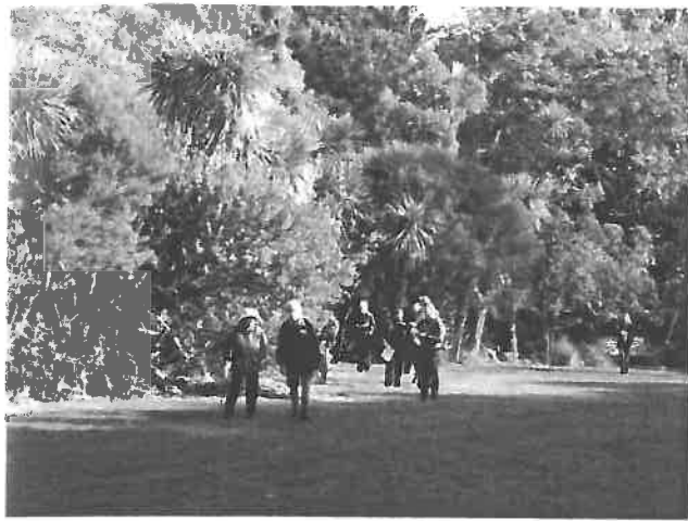
Fig. 3. Bot Soc members exploring the fringes of the grassed area, 20 July 2013, Mike Wilcox.