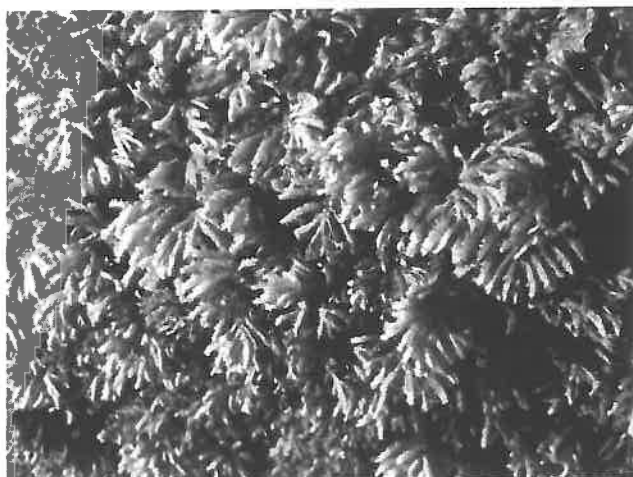
Fig. 9. Hypopterygium tamarisci , Dingle Dell, 13 June 2013, Mike Wilcox.