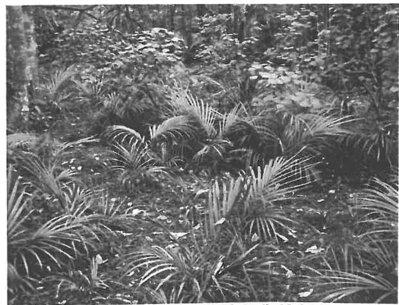
Fig. 14. Regeneration of nikau, Dingle Dell, 19 August 2013, Mike Wilcox.