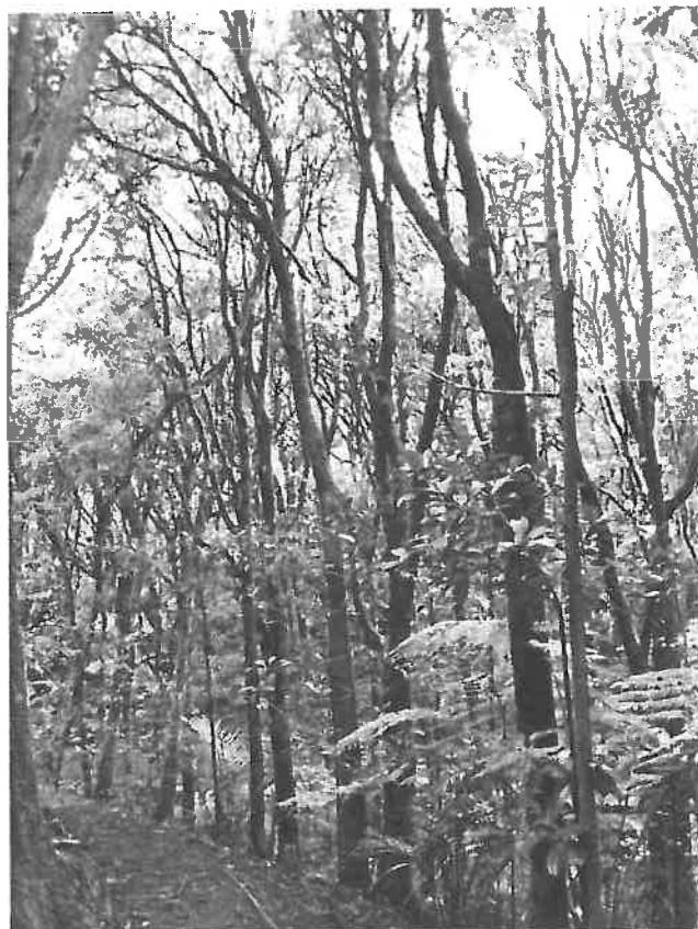
Fig. 2. Gully forest of kohekohe, karaka and mahoe, 23 Feb 2012, Mike Wilcox.