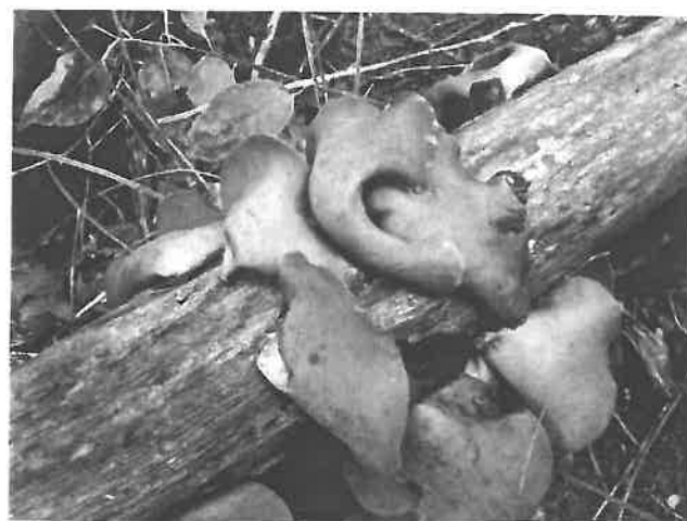
Fig. 4. Wood ear fungus ( Auricularia cornea ) on decaying mahoe, 15 June 2013, Mike Wilcox.