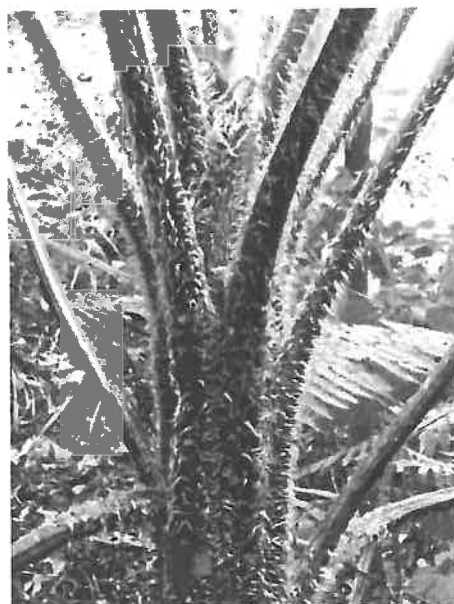
Fig. 13. Cyathea cooperi , Dingle Dell, 19 Aug 2013, Mike Wilcox.