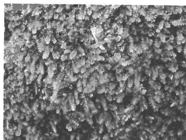
Fig. 8. Racopilum robustum , Dingle Dell, 19 August 2013, Mike Wilcox.