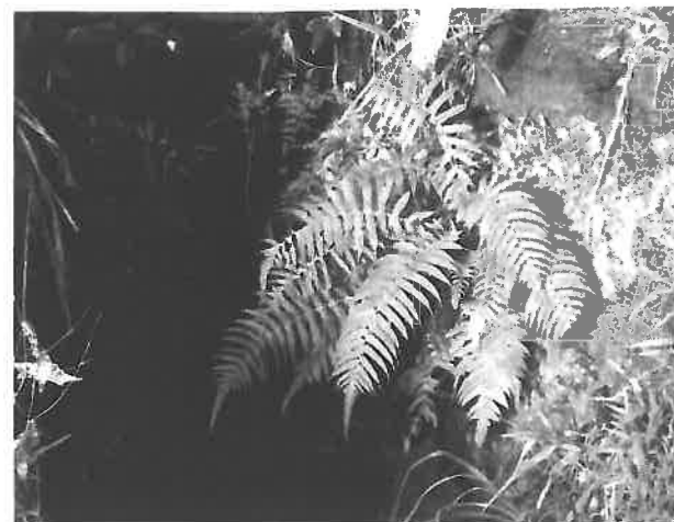
Fig. 10. Christella dentata , Dingle Dell, 20 July 2013, Mike Wilcox.