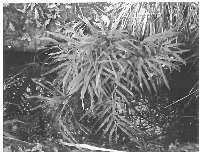
Fig. 12. Pteris cretica , Dingle Dell, 20 July 2013, Mike Wilcox.