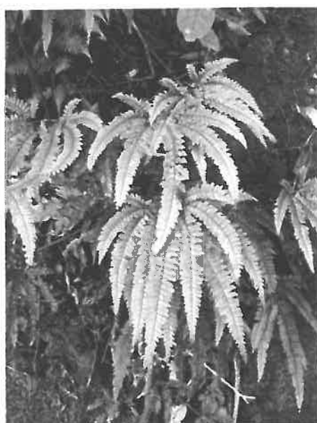
Fig. 11. Adiantum hispidulum , 19 Aug 2013, Mike Wilcox.