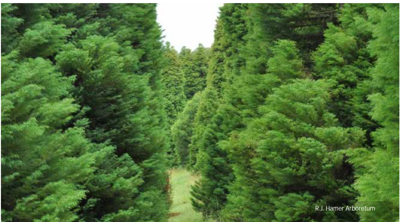
R.J. Hamer Arboretum

An impressive broad landscape with bold plantings of exotic trees and distant views of the Yarra Valley and the Great Dividing Range. The forest arboretum is popular with local community and tourists alike for passive recreation.