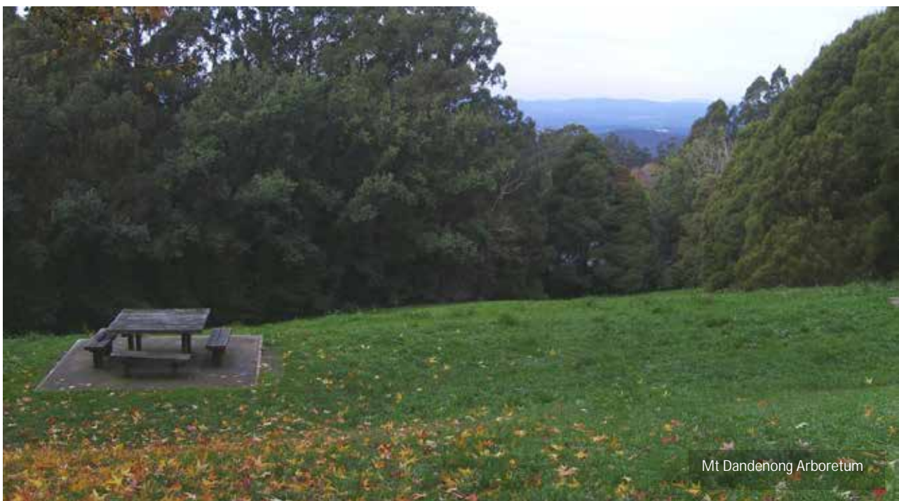
Mt Dandenong Arboretum