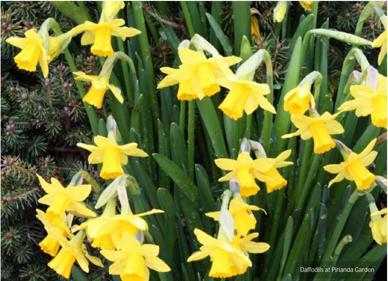
Daffodils at Pirianda Garden

The Draft Strategic Management Plan was released for public comment on 3 April 2013. Community organisations, interest groups, agencies and individuals were invited to make written submissions by 10 June 2013. A total of 14 written submissions were received (Appendix 1), and these were carefully considered and taken into account in the preparation of this final Plan.