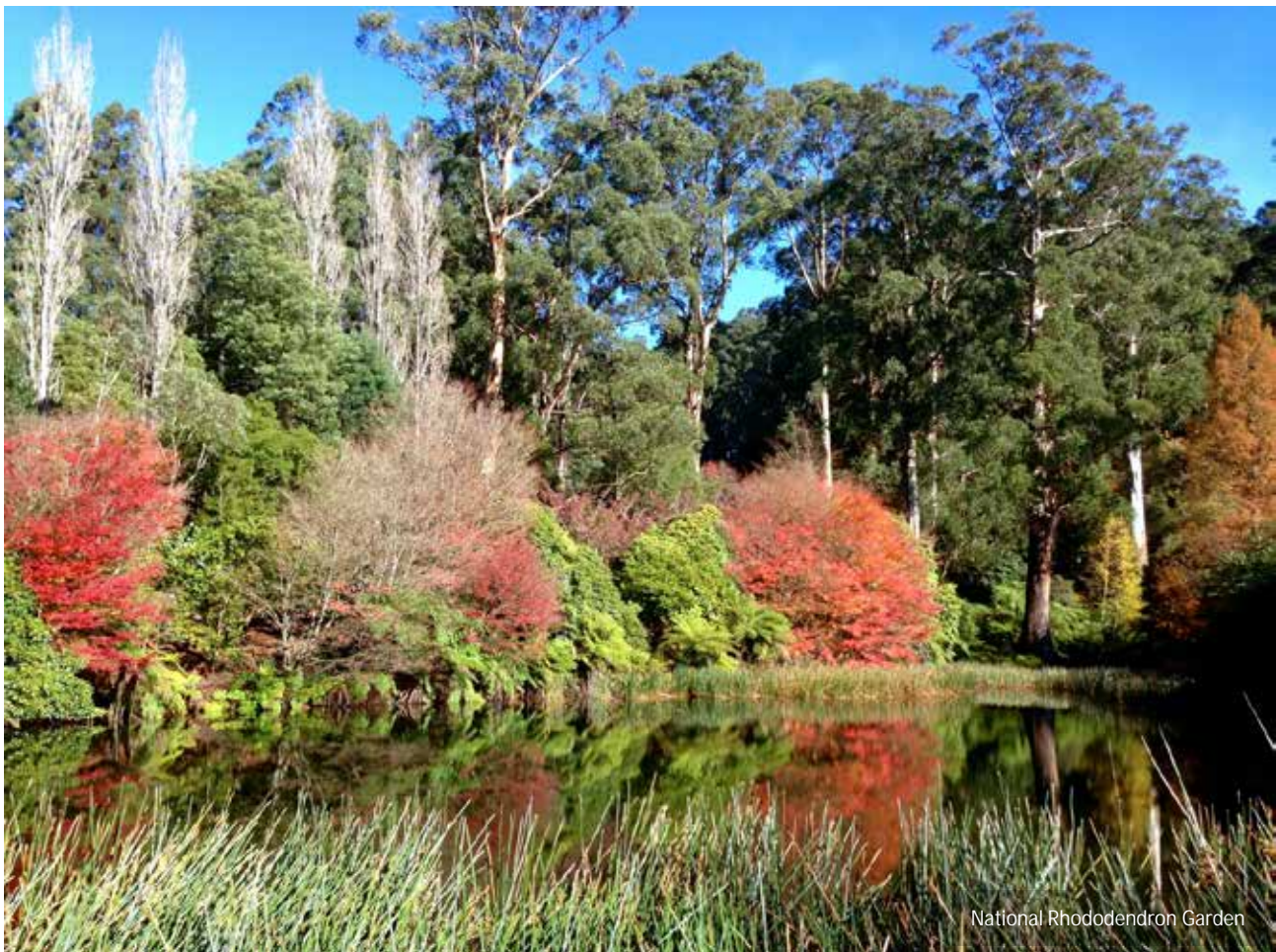
National Rhododendron Garden