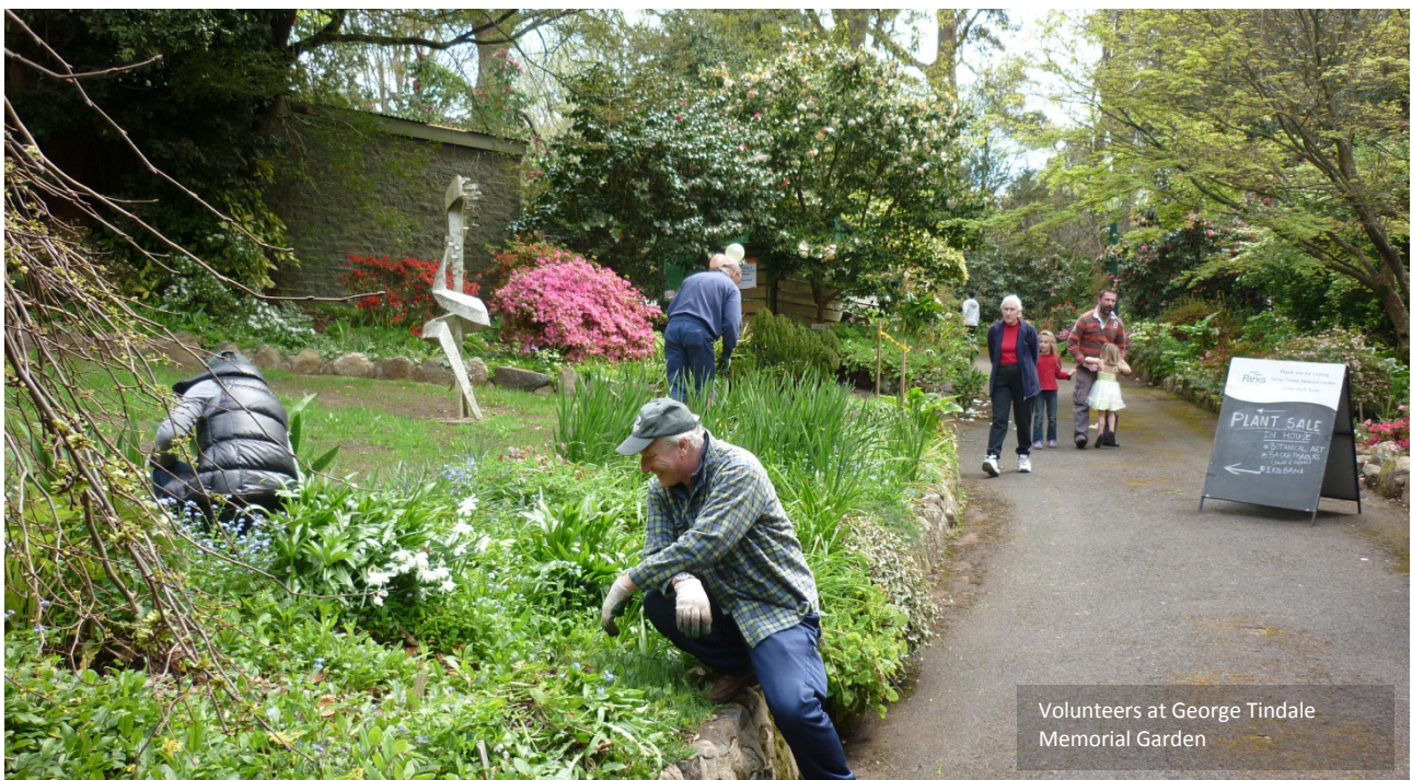
Volunteers at George Tindale Memorial Garden

Continue to use the house as a venue for a range of community and Parks Victoria activities.