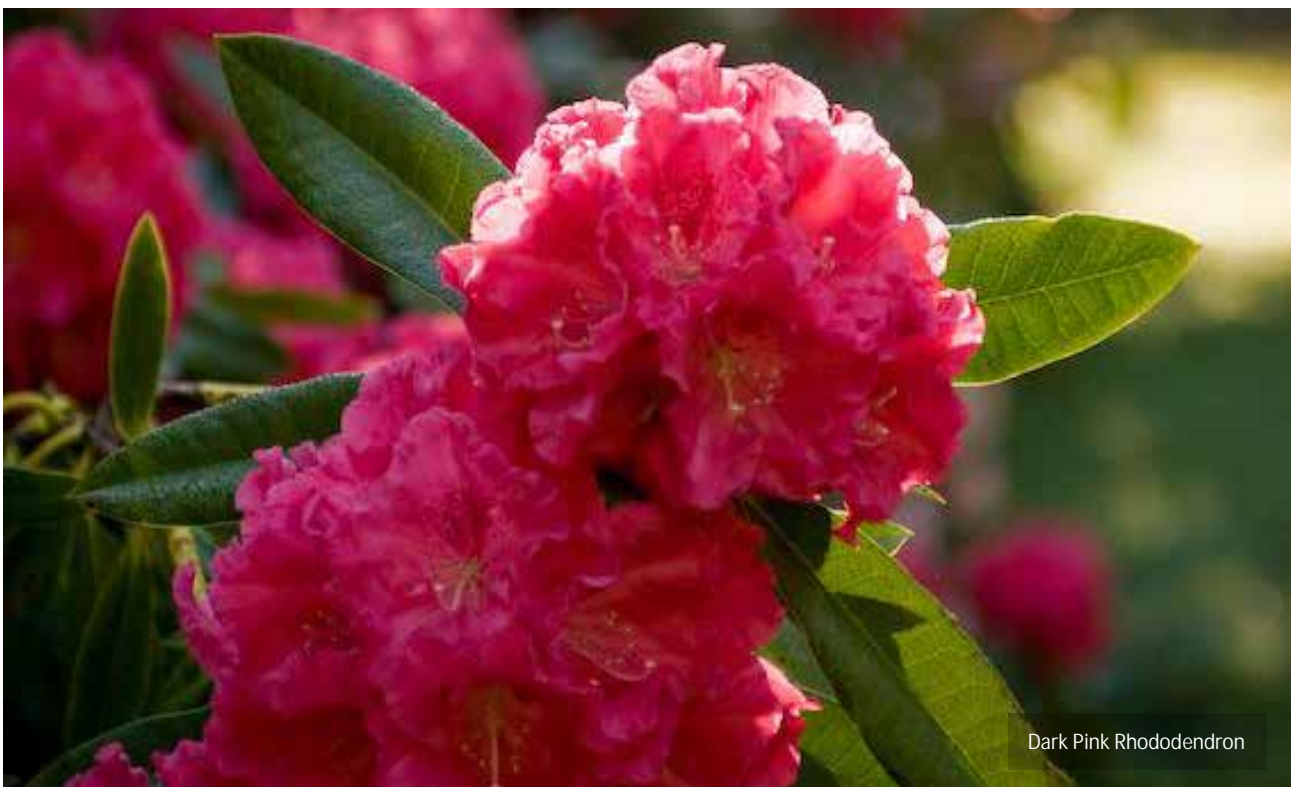
Dark Pink Rhododendron

Extreme climate and weather events that have occurred in Victoria over the past decade such as drought, bushfire, storms and floods indicate the trend for long term change. Possible extreme weather events in the Dandenong Ranges reinforce the need for emergency management preparation and adaptation measures in the Gardens.