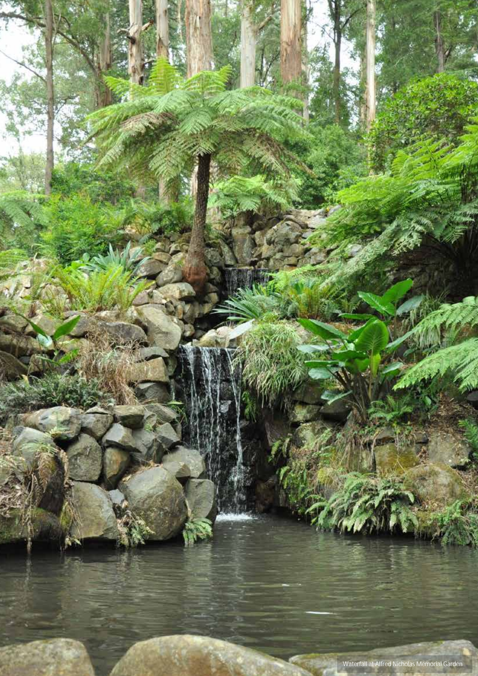
Waterfall at Alfred Nicholas Memorial Garden