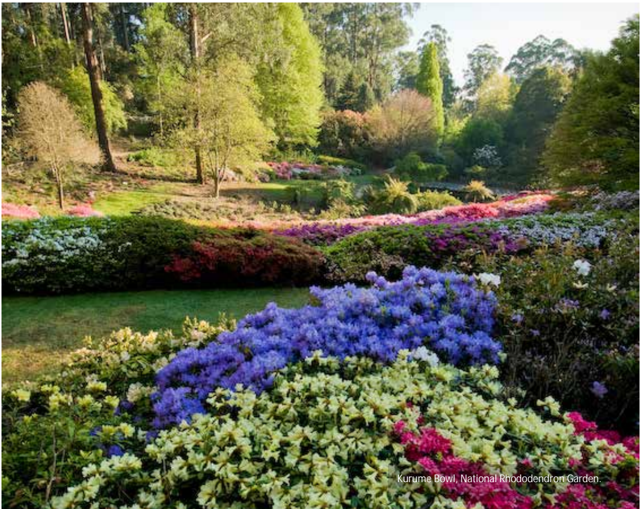
Kurume Bowl, National Rhododendron Garden.

The National Rhododendron Garden and William Ricketts Sanctuary will be the principal tourism attractions of the Gardens, and that interest will be harnessed to augment and improve the horticultural and visitor values across the other properties. Monitoring of visitor use will provide information to determine longer term recreational and infrastructure needs of the Gardens, and improvement projects will be investigated as necessary.