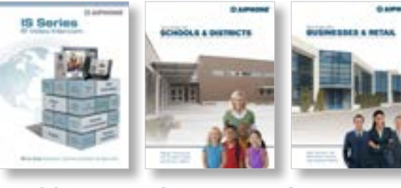
IS Series End User Brochure #95221