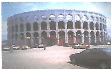
External view of the « Palais des Sports » -Treichville

The matches will be played at the « Palais des Sports » of Abidjan.