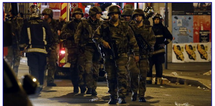
Paris the night of the attacks: the army takes the streets.

and members of organisations. Furthermore, the police administration sent a message to all their employees at a national level asking them not to take vacations during the COP 21 in case they need to mobilise everyone against activists and “black blocks” (French media and politicians still misunderstand black blocs to be a distinct organisation, not a reproducible tactic). In other words, the authorities fear that this international meeting will occasion fierce resistance.