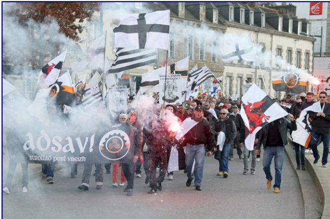
Adsav demonstrating in Pontivy on Saturday, November 14.

some Halal butcheries have also been targeted. In Marseilles, a Jewish professor and a woman wearing a headscarf were assaulted.