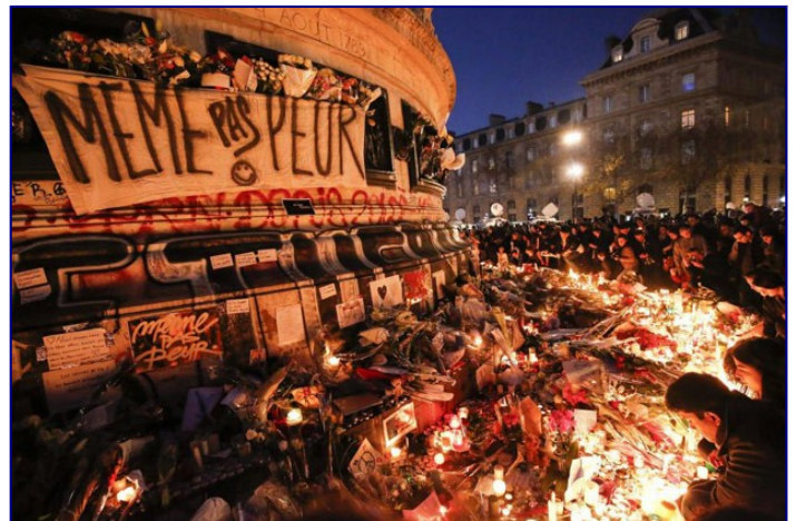
People gathering at the Place de la République after the attacks.

activity. In addition, President François Hollande is trying to add new elements to the law governing the state of emergency, including policies such as stripping French citizenship from people recognized as a threat to national security, or closing mosques preaching a conservative interpretation of Islam.