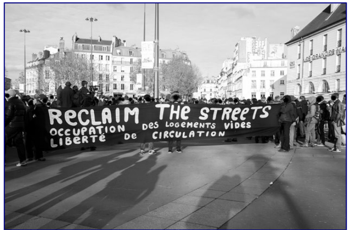
Confronting the "state of emergency" on November 22.