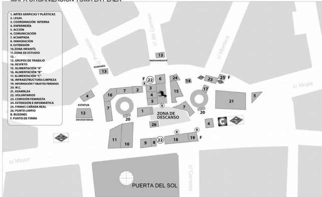
Map of the Plaza del Sol, May 20, 2011