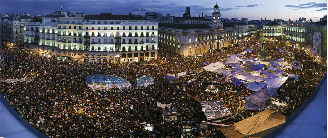
Thousands of people fill the Plaza del Sol in Madrid during the 15M mobilization in 2011.