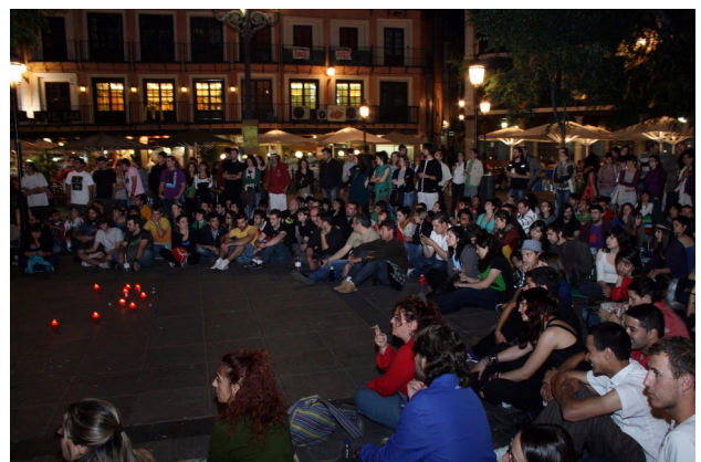
Neighborhood assembly, May 2011.

In time, the 15M movement subsided, blending back into the social conflicts that gave birth to it, which continued unabated. For a while, many anarchists in Barcelona participated with thousands of other people in the neighborhood assemblies that replaced the Plaça Catalunya occupation. Home defense protests against foreclosures gained frequency. There were occupations of schools and hospitals against austerity measures. General strikes and riots. Protests against new repressive laws. Waves of arrests and counterprotests. The struggle continued.