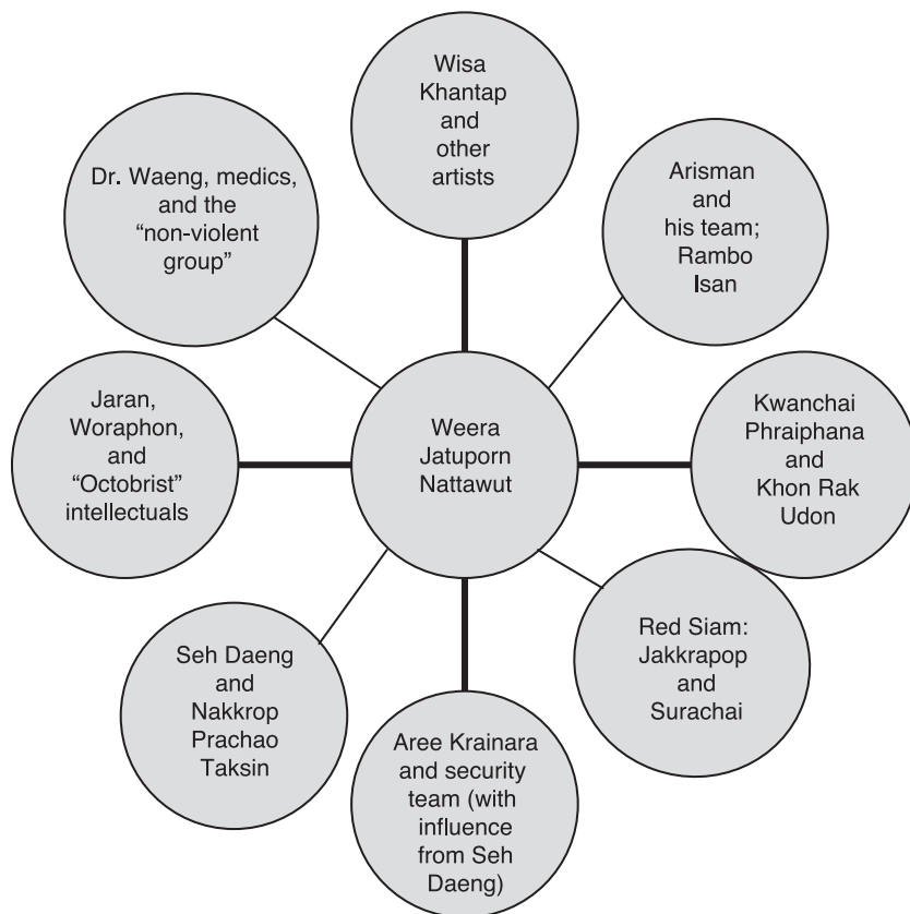
FIGURE 1. Leadership Structure of UDD, 2010