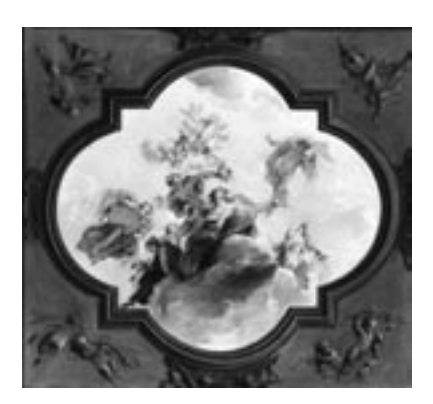
Toledo Museum of Art Provenance Report, page 47

Accession Number: 1974.43 Artist: WIT, JACOB DE (1695 - 1754) Title: Zephyr and Flora Date of: 1723 Medium/Technique: Oil on canvas Dimensions: 20 x 24 3/8 in. (50.8 x 61.8 cm.) Inscription: Inscribed: J D Wit Invt Ft/1723 (JD in monogram) Nationality: Dutch