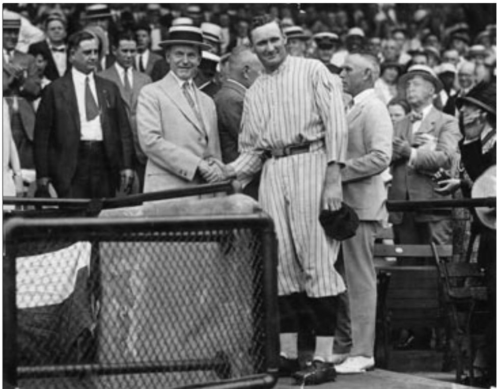
Washington Senators pitcher Walter Johnson shakes hands with Calvin Coolidge at Griffith Stadium.

Panelists discuss the extraordinary measures that NARA had to take in 2005 to make federal records in Washington and Presidential records in California available to the Senate and the public