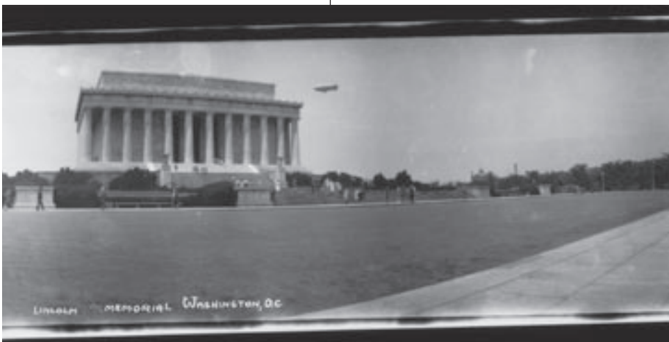
The Lincoln Memorial, circa 1920.