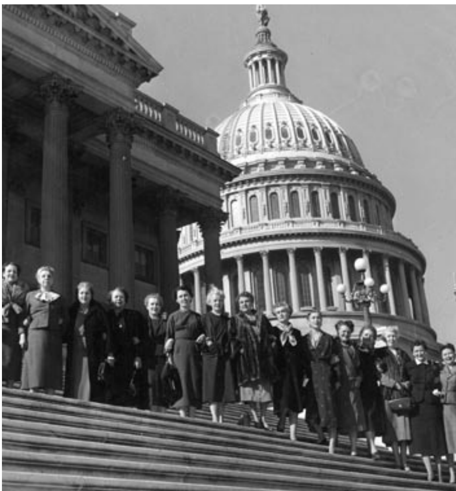
Women belong in the House . . . and the Senate. Women senators brave the cold in January 1955 to pose on the steps of the Capitol.