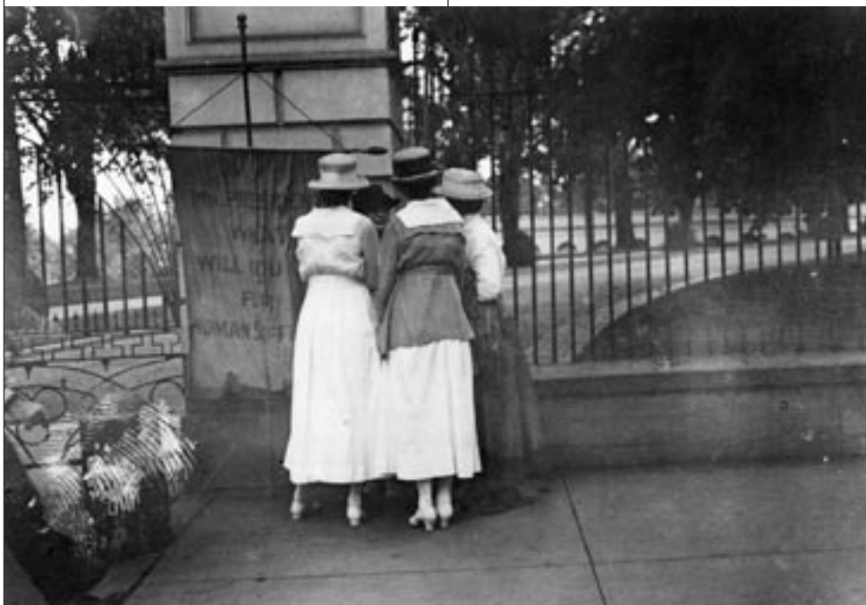
National Woman's Party picketers gather in front of the White House, 1917.

There is a successful oral history interview or project in your future! You'll receive a thorough overview of oral history, including its integration into archives. Topics include the value and uses of oral history, project development, recording equipment, interviewing, media storage, video interviews, and an evaluation of digital technology of particular interest to oral historians.