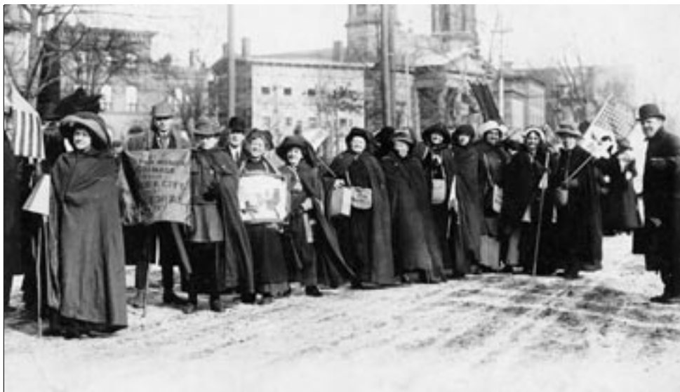
National Woman's Party members participate in a 1913 suffrage march down Pennsylvania Avenue.

Government case files have grown at an alarming rate since World War II, clogging storage centers, archival repositories, and computer systems alike. Library and Archives Canada addressed the appraisal and selection challenges of operational case files by producing a groundbreaking records disposition authority for all Canadian federal government institutions. This disposition tool and application guidance will greatly assist archivists and records managers. Speakers present the context, methodology, and results of this project.