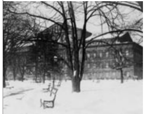
Snow blankets the Pension Office (now the National Building Museum) in January 1930.

Speakers examine the shifting roles and responsibilities for librarians, archivists, records managers, and information technologists as they participate in initiatives (such as the Library of Congress National Digital Information Infrastructure Preservation Program [NDIIPP]) that work to develop sustainable strategies for collecting, managing, and preserving digital content. The panelists, who represent a variety of institutional perspectives, suggest ways in which the spectrum of information professionals can better collaborate to achieve shared goals.