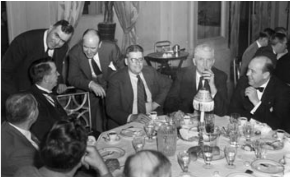
Enjoying the Virginia Dinner, a 1941 banquet at the Willard Hotel in Washington, DC, for Virginia senators and representatives in the United States Congress.

Funkmaster George Clinton once said of the eccentric jazz musician Sun Ra, "He's out to lunch, but we eat at the same place." The "same place" for members of the Council of State Archivists, the National Association of Government Archives and Records Administrators, and the Society of American Archivists (CoSA, NAGARA, and SAA) is DC 2006: The Joint Annual Meeting, where archivists of all stripes can get together — perhaps even for lunch!