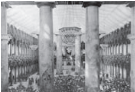
The Great Hall of the Pension Office in 1901.