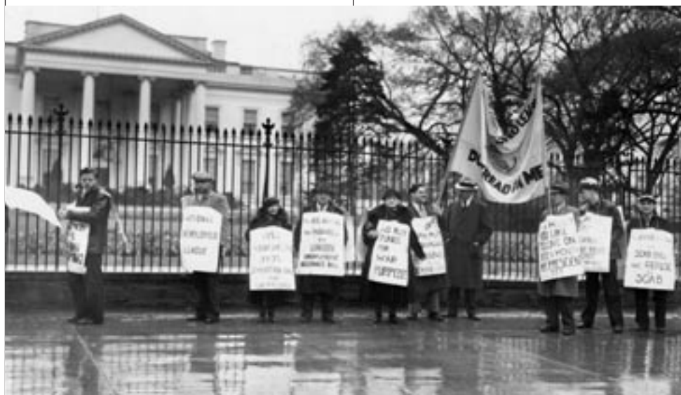
Unemployed demonstrators register their discontent with the Depression at the White House in April 1935.

During the past 60 years, several thousand people have attended archival institutes to obtain basic archives education. Although graduate education has become today's preferred method of entry into the archival profession, institutes continue to thrive and attract capacity audiences each year. Drawing on years of experience, speakers discuss the unique histories of their institutes, their impact, and their future role in archival education.