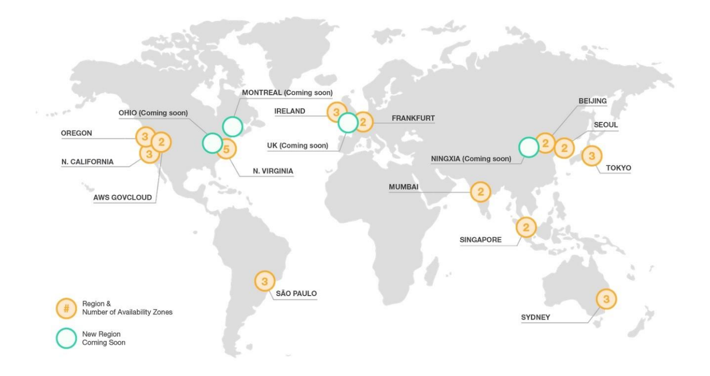
Figure 2 – AWS Global Regions

AWS data centres are built in clusters in various global regions. We refer to each of our data centre clusters in a given country as a "Region". Customers have access to thirteen AWS Regions around the globe<sup>8</sup>, including an Asia Pacific (Singapore) Region. Customers can choose to use one Region, all Regions or any combination of Regions. Figure 2 shows AWS Region locations: